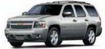
Graystone Metallic 2