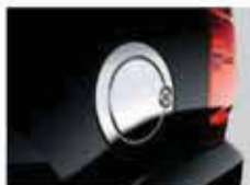
Chrome Fuel Door