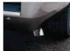
Stainless Steel Exhaust Tip