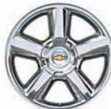
20" Chrome-Aluminum Wheel (available on LTZ)