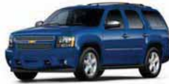
Blue Topaz Metallic 1,2,4,5,6