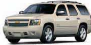
Gold Mist Metallic 1,2