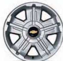
18" Aluminum Wheel (available on LT 1/2-ton; requires available Z71 Off-Road Suspension Package)