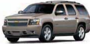
Mocha Steel Metallic 2