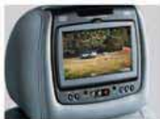
Head Restraint DVD System