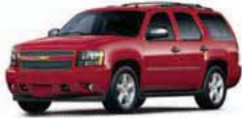
Crystal Red Tintcoat 1