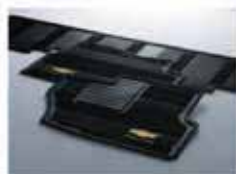
All-Weather Premium Floor Mats

PERSONALIZE YOUR SUBURBAN AT CHEVY.COM/ACCESSORIES