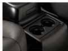
Rear Floor Console Organizer