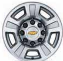
17" Eight-Lug Bright Machined-Aluminum Wheel (standard on 3/4-ton)