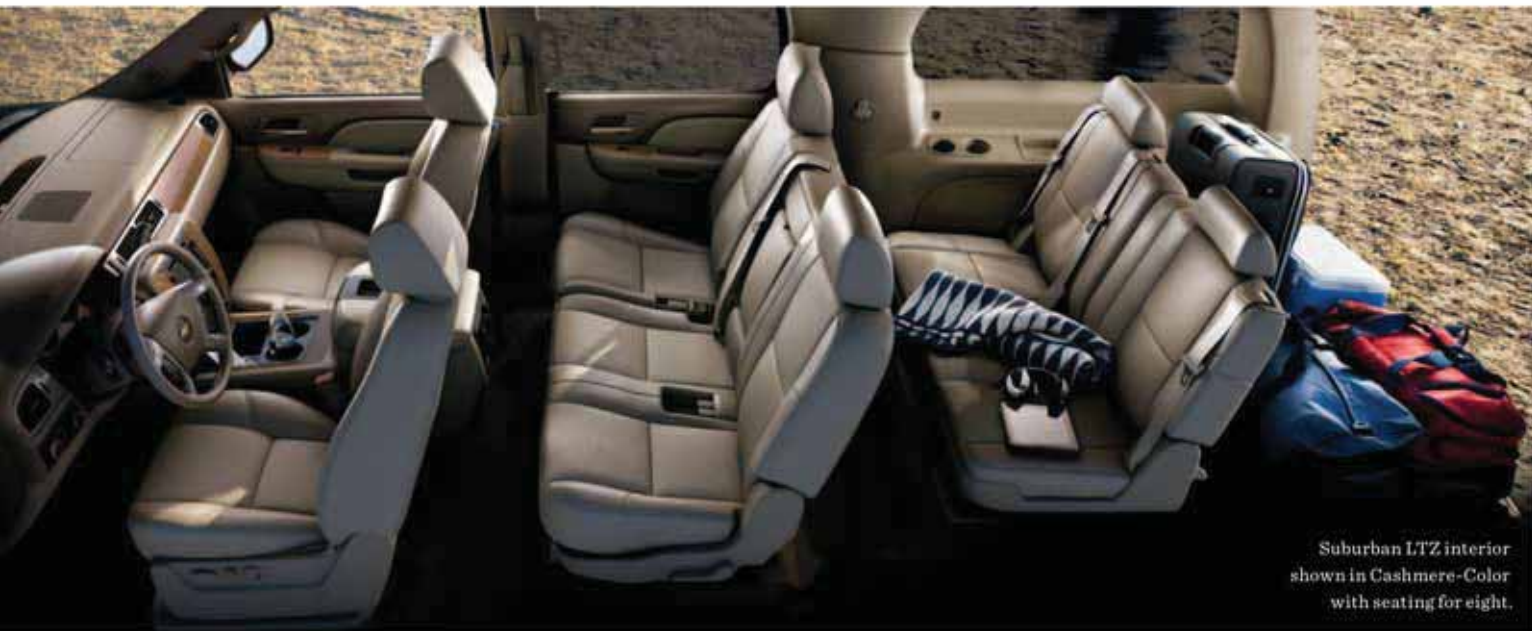
Suburban LTZ interior shown in Cashmere-Color with seating for eight.

ENJOY THE WORLD of possibilities with seating for up to nine 1 and upscale accommodations. Indulge in visions of far-off places with the impressive fuel economy 2 and uncompromised capability OF TAHOE AND SUBURBAN.