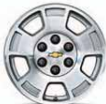
17" Aluminum Wheel with Rectangular Pockets (standard on LS and LT 1/2-ton)