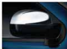
Outside Rearview Mirror Covers