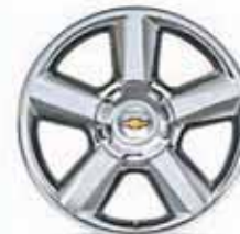
20" Polished-Aluminum Wheel (standard on LTZ)