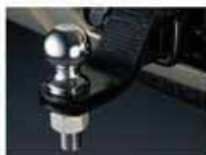
Hitch Ball Assembly