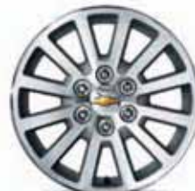
18" 12-Spoke Aluminum Wheel (standard on Hybrid)