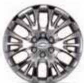
22" 12-Spoke Split-Aluminum Alloy Wheel 17

PERSONALIZE YOUR TAHOE AT CHEVY.COM/ACCESSORIES