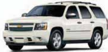
White Diamond Tricoat 1,7