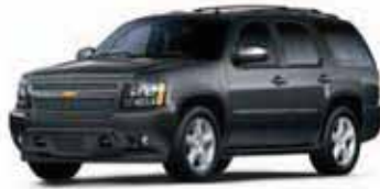
Black Granite Metallic 1,2,3