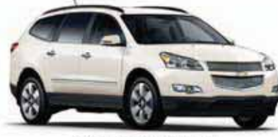
White Diamond Tricoat 1,2