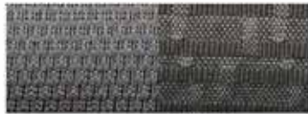
Dark Gray Cloth 3,4