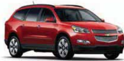
Crystal Red Tintcoat 1,2