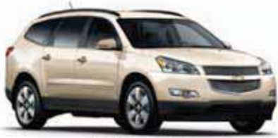
Gold Mist Metallic 2