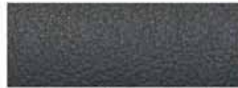
Ebony Leather Appointments 5