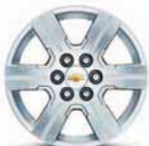
18" Machined-Aluminum Wheel