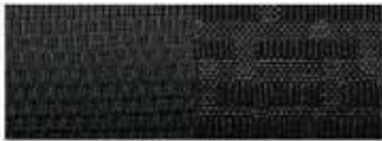
Ebony Cloth 4