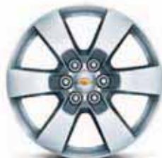
20" Aluminum Wheel