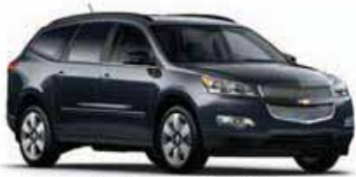
Black Granite Metallic 1,2