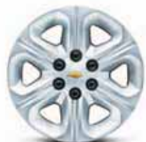
17" Steel Wheel with Painted Cover