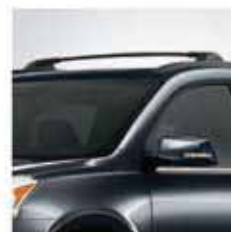
Roof Rack Side and Cross Rail Package