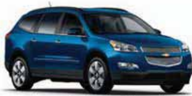
Dark Blue Metallic