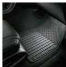
Premium All-Weather Floor Mats