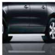
6" Chrome Oval Assist Steps

PERSONALIZE YOUR TRAVERSE AT CHEVY.COM/ACCESSORIES