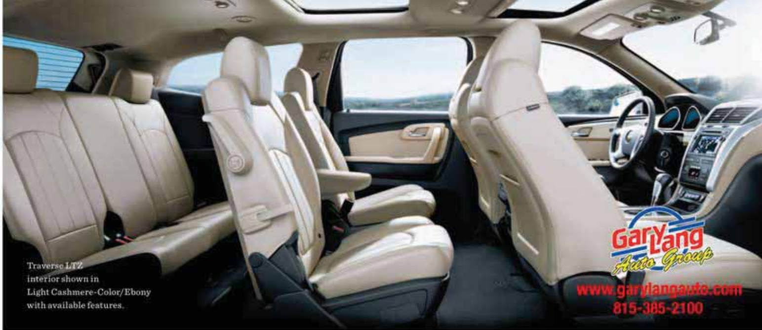
Traverse LTZ interior shown in Light Cashmere-Color/Ebony with available features.