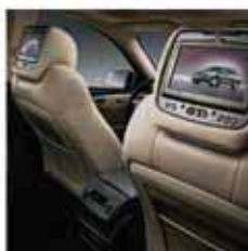
Dual Headrest DVD System