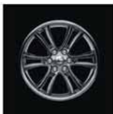
20" Chrome Wheel 1