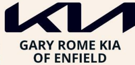
GARY ROME KIA OF ENFIELD