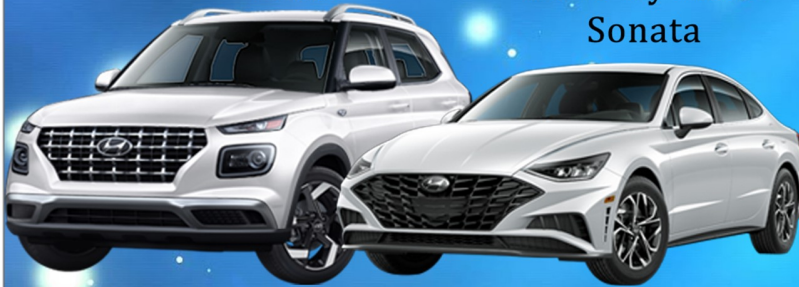
2020 Hyundai Sonata