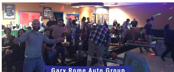
Gary Rome Auto Group