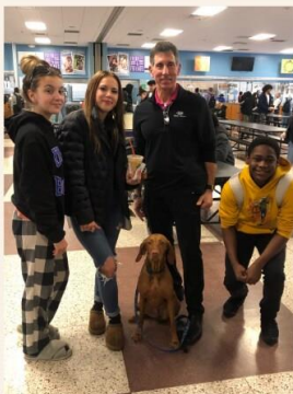
Holyoke High School North