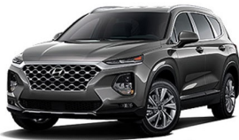
2019 Hyundai Santa Fe