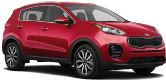
2019 Kia Sportage