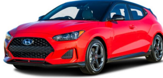
2019 Hyundai Veloster