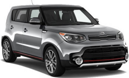
2019 Kia Soul