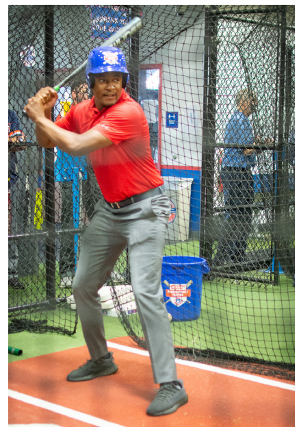
The Gates Automotive Variable Department management team closes a business quarter with team building at Four Winds Field.