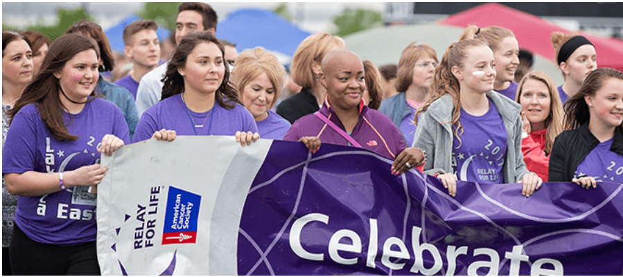
Above: The American Cancer Society brings together cancer survivors, caregivers, and volunteers to participate in Relay For Life across the nation.