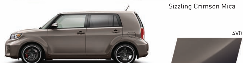
Army Rock Metallic