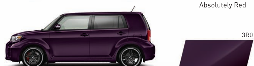
Sizzling Crimson Mica