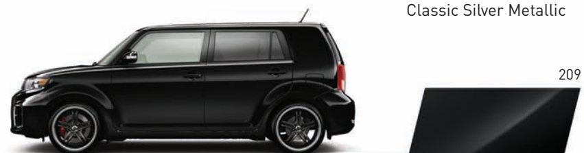
Black Sand Pearl