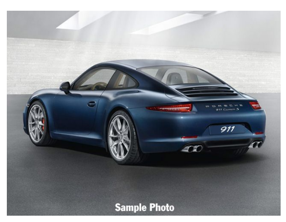
2+2 seat Coupe Intelligent lightweight construction... Galvanized steel body shell components