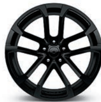
20" Forged-Aluminum Black-Painted 10-Spoke 4 (Standard on ZL1; available on SS 6 )