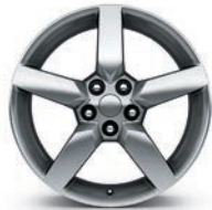
19" Bright Silver-Painted Aluminum (Standard on 2LT, shown) Polished-Aluminum (Available on 1LT and 2LT)