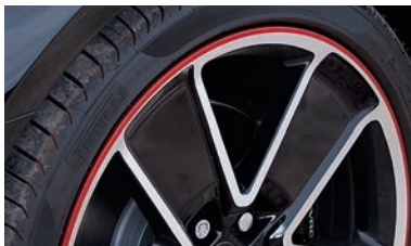
21" 5-Spoke Wheel with Red Flange Stripe and Black Spokes

PERSONALIZE YOUR CAMARO AT CHEVROLET.COM/ACCESSORIES