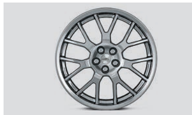
21" Multi-Spoke Chrome Wheel