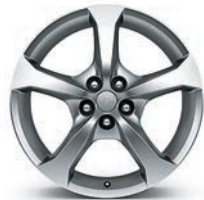
20" Polished-Aluminum 4 (Available on LT 5 and SS, shown) Bright Silver-Painted Aluminum 4 (Standard on SS; available on LT 5 )