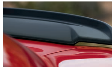
Black-Painted Rear Spoiler