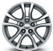
18" Silver-Painted Aluminum (Standard on LS and 1LT)