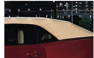
Beige Convertible Top