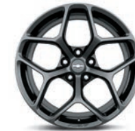
19" Black Forged-Aluminum 4 (Standard on Z/28)