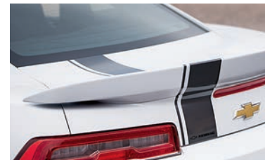
Chevrolet Performance Stripe