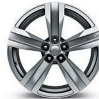
20" Forged-Aluminum Bright 5-Spoke 4 (Available on ZL1)