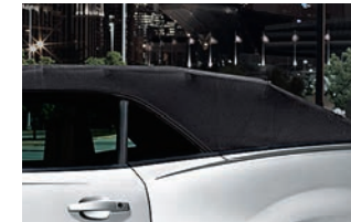
Black Convertible Top