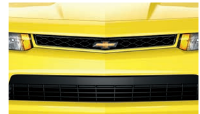
Upper Grille Insert

1 Not available on Z/28. 2 Extra-cost color. 3 Not available on LS. 4 These wheels are paired with summer-only tires. Do not use summer-only tires in winter conditions, as it would adversely affect vehicle safety, performance and durability. Use only GM-approved tire and wheel combinations. Unapproved combinations may change the vehicle's performance characteristics. For important tire and wheel information, go to gmaccessorieszone.com or see your dealer. 5 Requires available RS Package. 6 Available on SS Coupe with 1LE Performance Package.