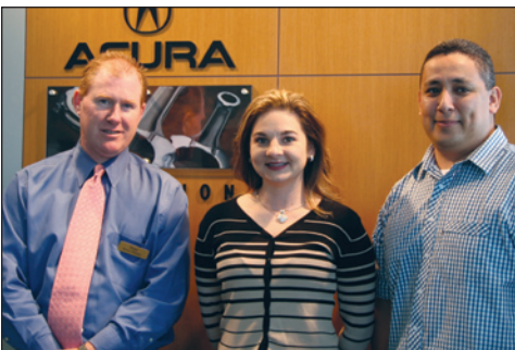
Service and Parts Managers with Excell Facilitator