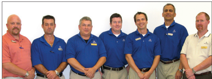
Gillman Acura Service Advisors