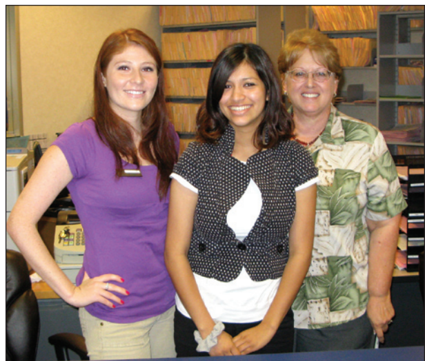
Gillman Acura Cashiers

specialists, service advisors, cashiers, the Excell Facilitator, receptionists, office staff, and every member of the Gillman Acura crew.