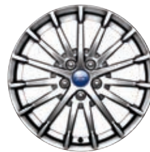
17" Machined Aluminum Standard

Ford has teamed up with SunPower® to offer a rooftop solar system that provides clean, renewable energy for use throughout your home. It's another smart step you can take in your commitment to green living. Right now, this offer has been extended to Ford hybrid and plug-in vehicle drivers. 3 To sign up for a free, no-obligation home evaluation, visit sunpowercorp.com/ford or call 1-800-SUNPOWER.