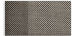
1 Medium Light Stone Cloth with Medium Dark Stone Accents