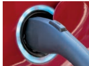
External charge port with LED-illuminated state-of-charge indicator.