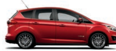
Ruby Red Tinted Clearcoat Metallic