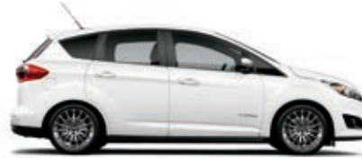
White Platinum Tri-coat Metallic