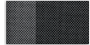
2 Charcoal Black Cloth with Warm Steel Accents