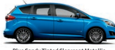
Blue Candy Tinted Clearcoat Metallic