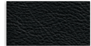
4 Charcoal Black Leather