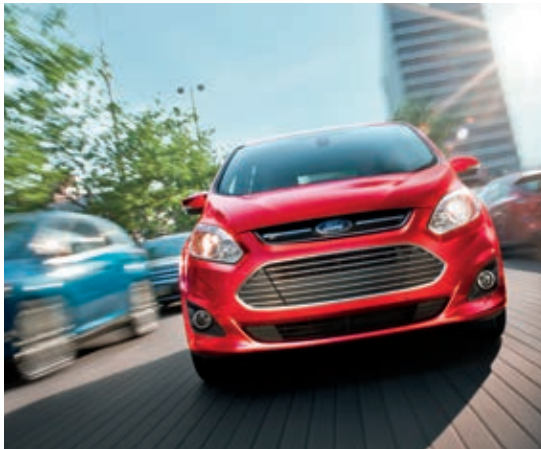
Ruby Red Tinted Clearcoat Metallic. Available equipment.