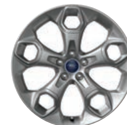
19" Premium Luster Nickel-Painted Aluminum Optional