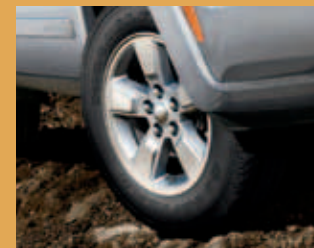
16-inch Keystone Aluminum Painted Sparkle Silver Liberty Sport (Standard)