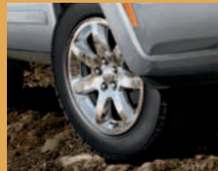
18-inch Echelon Chrome-Clad Liberty Limited (Available)