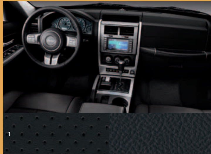
1 Axis Perforated McKinley Leather Trim/McKinley Vinyl — Dark Slate Gray with Pastel Slate Gray accent stitching (Standard)