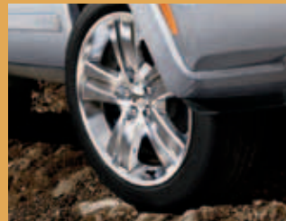
20-inch Polished and Painted Aluminum Liberty Limited Jet (Standard)