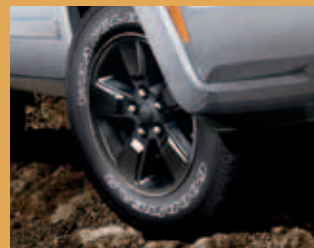
16-inch Aluminum Semigloss Black Wheels Liberty Sport (Available with Arctic Package)