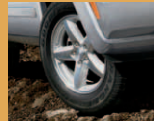
17-inch Victory Aluminum Painted Tech Silver Liberty Limited (Standard)