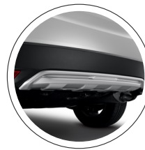
REAR SKID PLATE