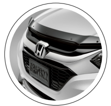
HOOD EDGE DEFLECTOR