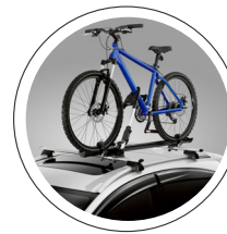
ROOF RACK, BIKE