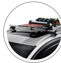
ROOF RACK, SKI