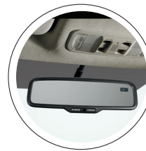
AUTOMATIC DIMMING MIRROR