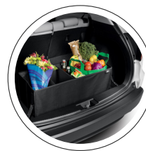
SOFT CARGO ORGANIZER