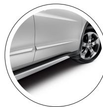
BODY SIDE MOULDING