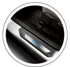
DOOR SILL ILLUMINATED