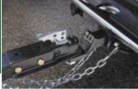
7-wire trailer wiring harness and frame-mounted hitch receiver (shown with aftermarket hitch equipment).