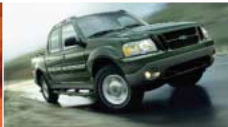
EXPLORER SPORT TRAC