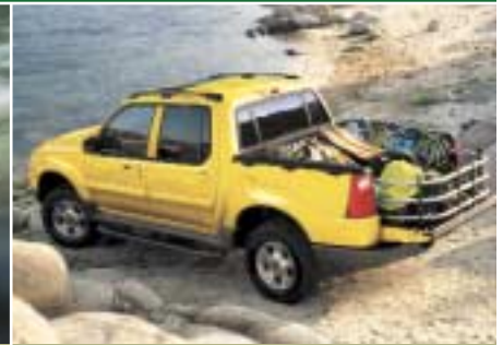
EXPLORER SPORT TRAC

The innovative 4-door Explorer Sport Trac combines the comfort and convenience of an SUV with the added utility of a flexible, open cargo area for “one vehicle does it all” versatility. Rugged, athletic styling shared with the Sport model makes Sport Trac the most versatile and active model in the Explorer lineup.