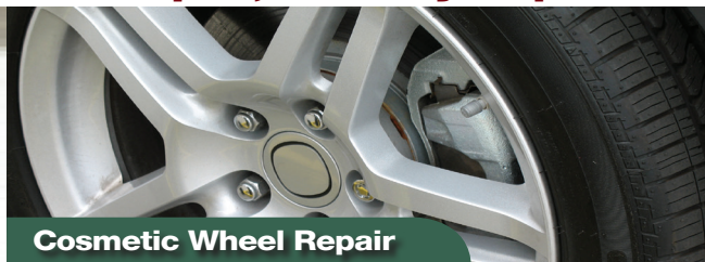
Cosmetic Wheel Repair