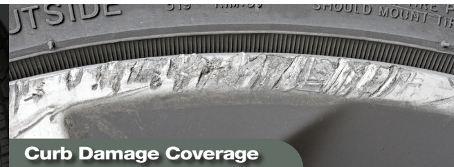
Curb Damage Coverage