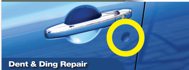
Dent & Ding Repair