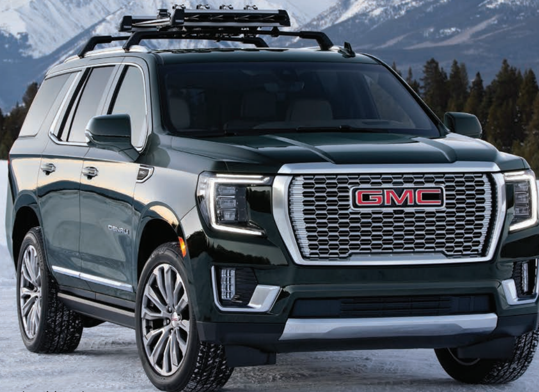
The exciting and much anticipated next-generation Yukon and Yukon XL arrived this past summer.

cu. ft.; class-leading available power-sliding center console; 10.2" diagonal premium GMC Infotainment System; wireless Apple CarPlay™ compatibility; wireless Android Auto™ compatibility; available HD Surround Vision; heated and ventilated driver and front passenger perforated leather seating surfaces; and 41.5 cu. ft. of cargo space behind the third row in the Yukon XL.