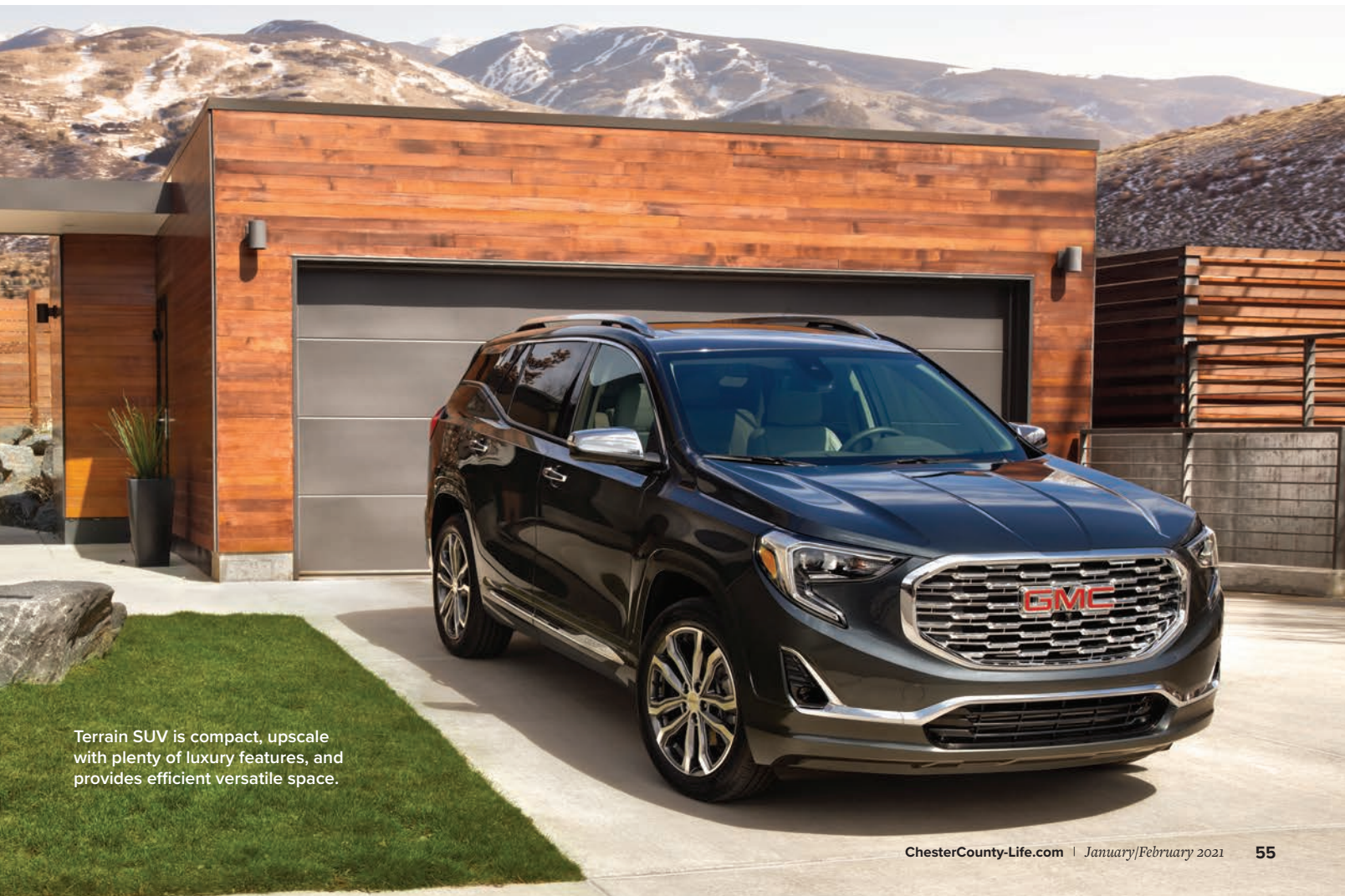
Terrain SUV is compact, upscale with plenty of luxury features, and provides efficient versatile space.