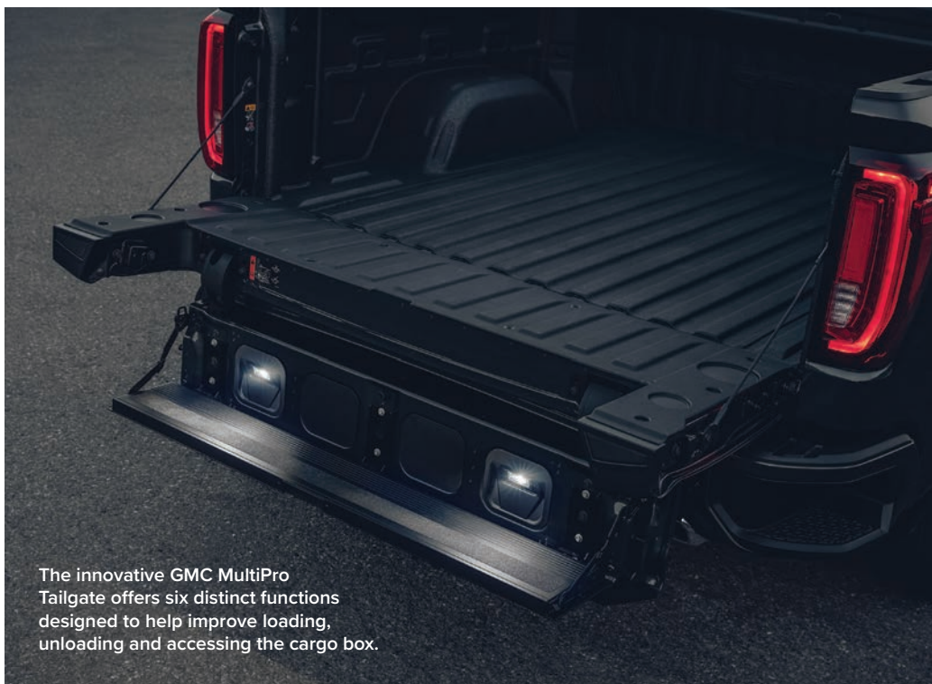
The innovative GMC MultiPro Tailgate offers six distinct functions designed to help improve loading, unloading and accessing the cargo box.