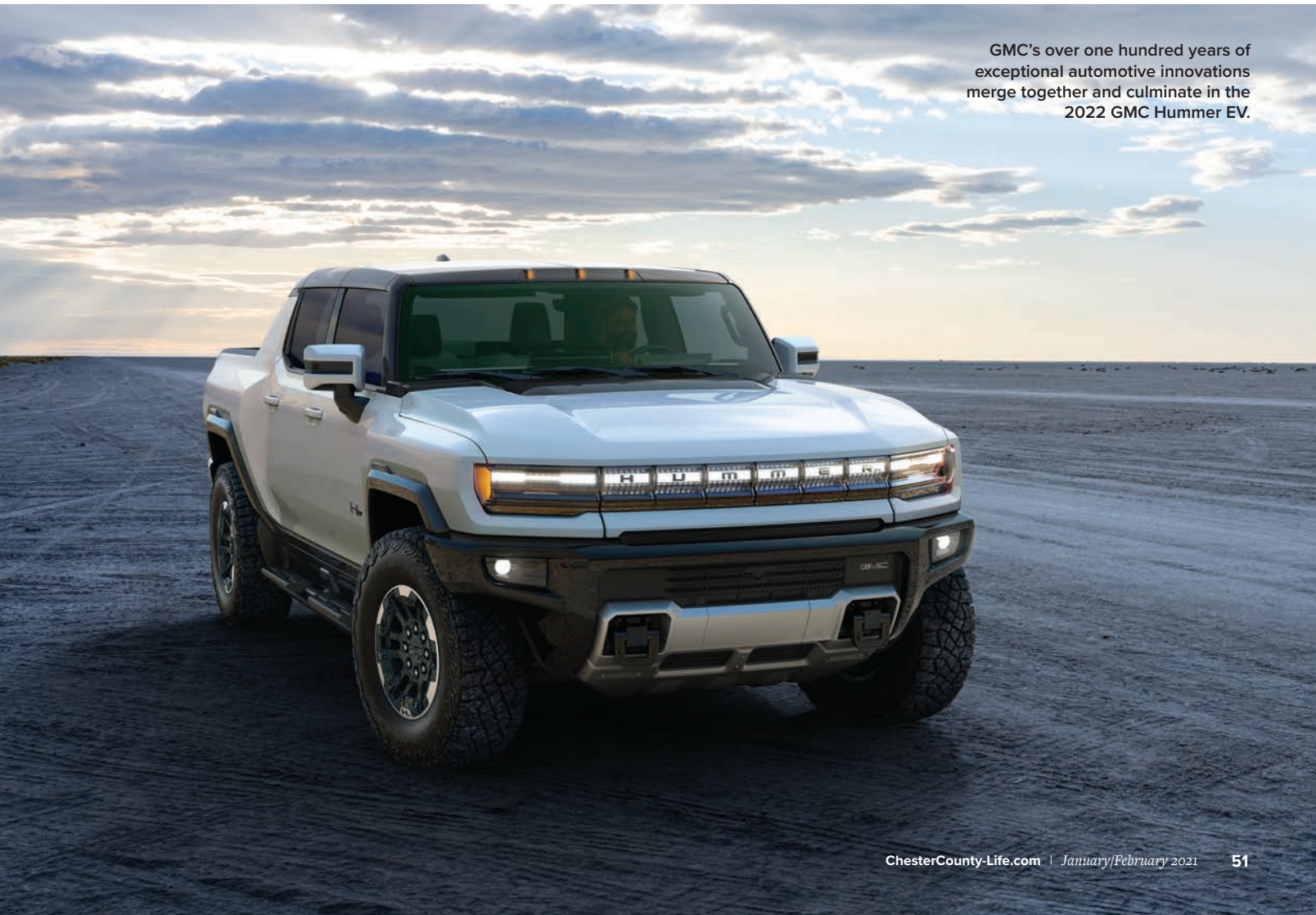
GMC's over one hundred years of exceptional automotive innovations merge together and culminate in the 2022 GMC Hummer EV.