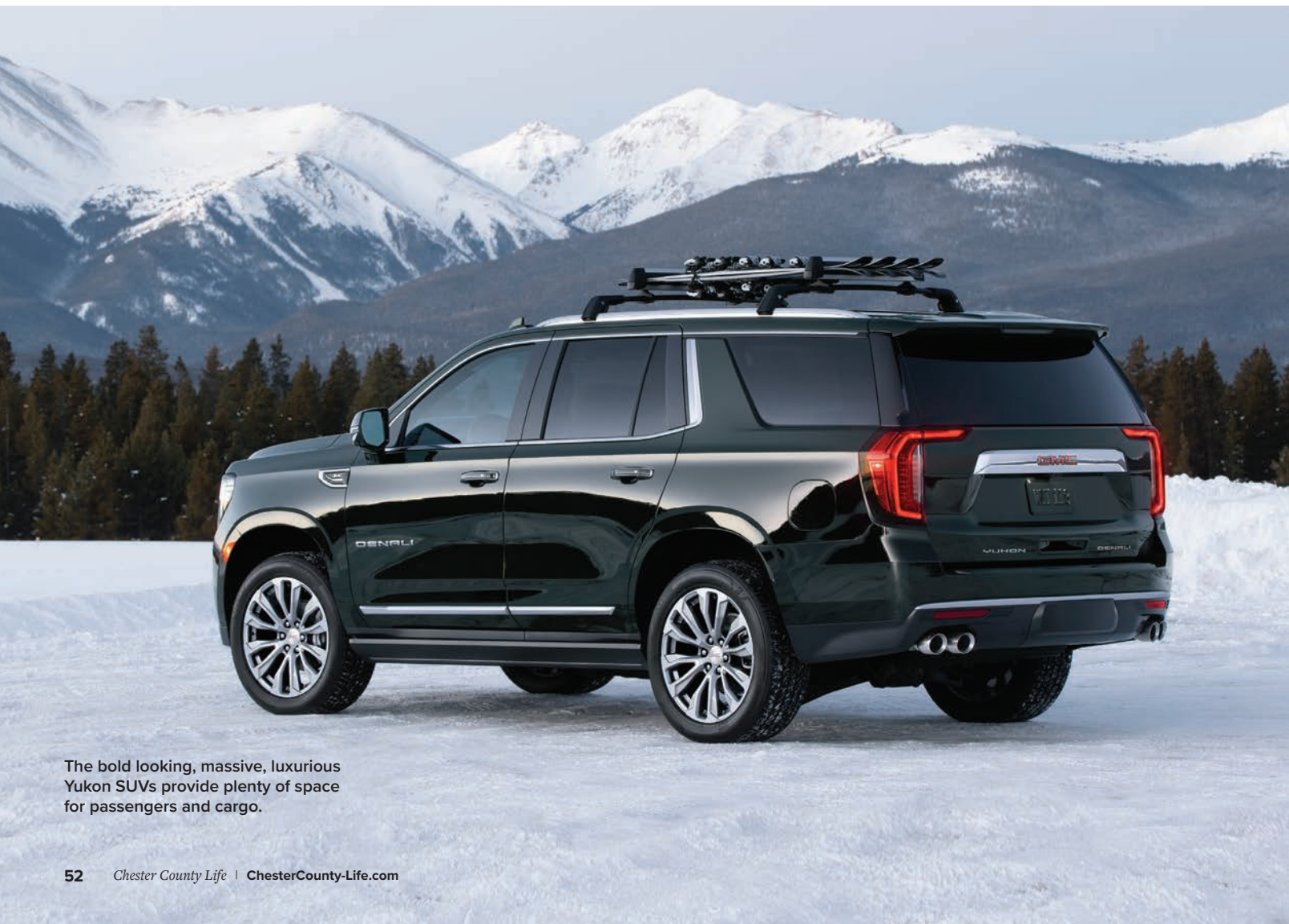
The bold looking, massive, luxurious Yukon SUVs provide plenty of space for passengers and cargo.

GM's Super Cruise with driver-assistance technology provides hands-free driving and automatic lane changing on more than 200,000 miles of compatible roads. A host of safety features include lane-keeping assist, blind-spot monitoring, and more.