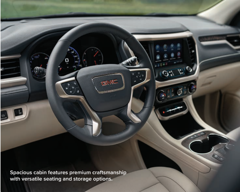
Spacious cabin features premium craftsmanship with versatile seating and storage options.

convenience such as the available six-inch diagonal color head-up display. Technology features include an eight-inch diagonal GMC Infotainment System with Navigation, Apple CarPlay compatibility, Android Auto compatibility, and five USB charging ports.