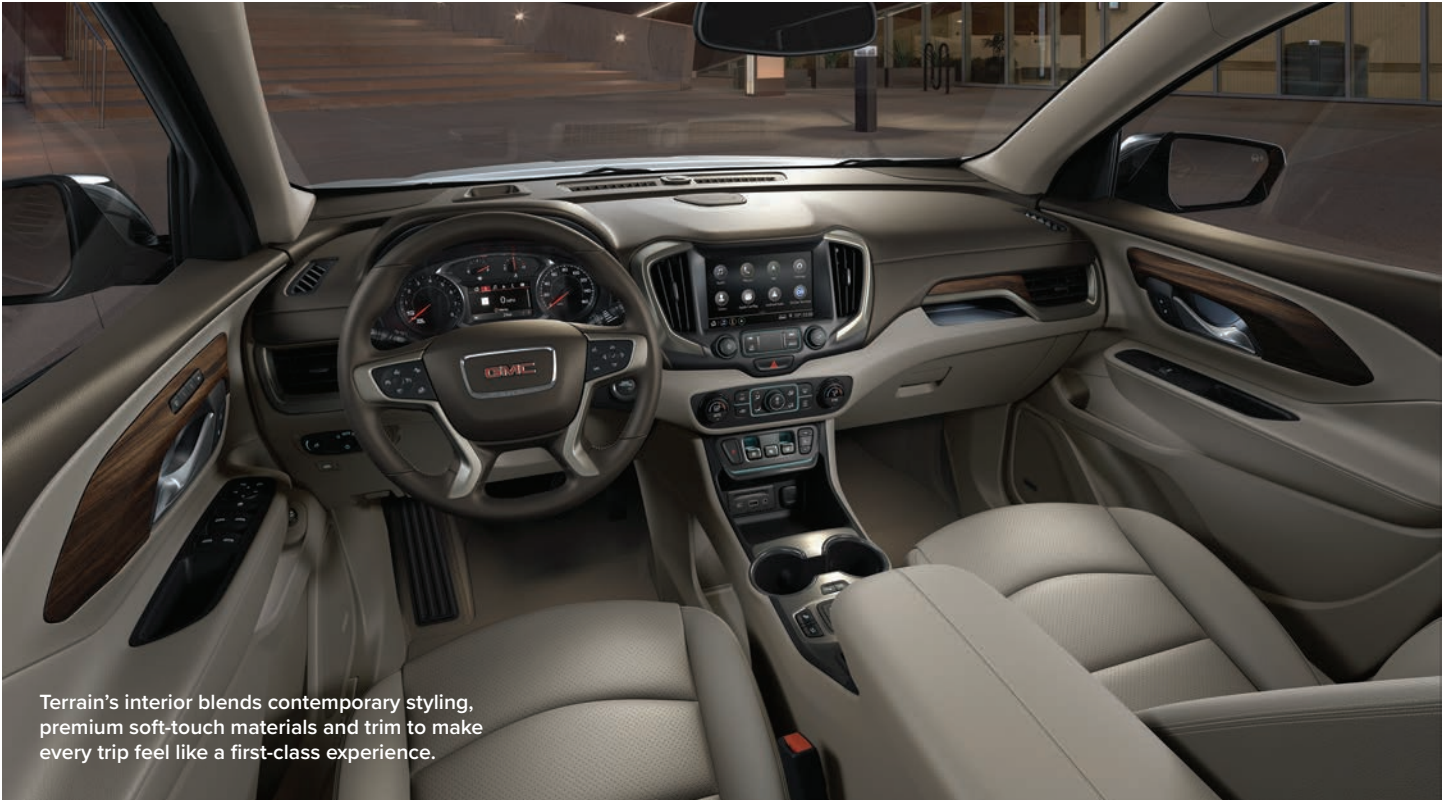
Terrain's interior blends contemporary styling, premium soft-touch materials and trim to make every trip feel like a first-class experience.