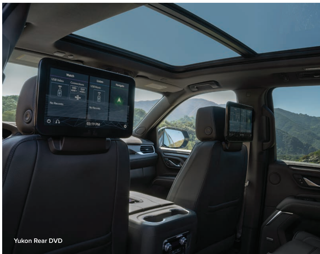
Yukon Rear DVD

Key features of the Yukon SLT model include a 5.3L V8 engine with 355 hp and 383 lb-ft of torque; 10-speed automatic transmission; best-in-class max cargo volume of 144.7