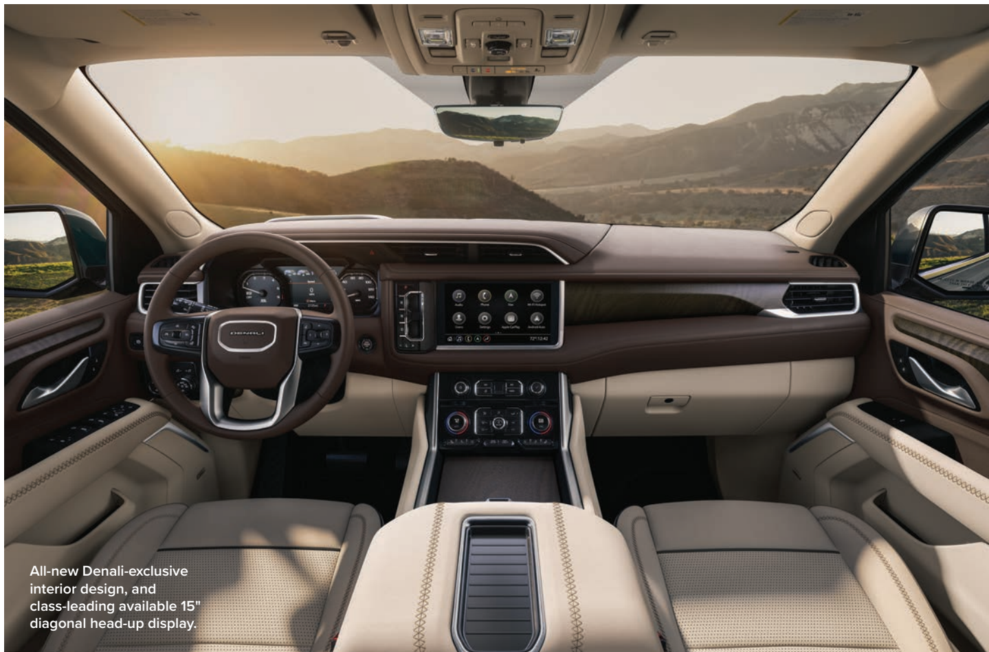
All-new Denali-exclusive interior design, and class-leading available 15" diagonal head-up display.

When it comes to range and charging efficiency, GM's new Ultium battery-pack technology adeptly supplies the Hummer EV an estimated 350-plus miles of driving range per charge. Recharging is fast and efficient. The 800-volt electrical design with 350-kilo-watt fast-charging capability adds 100 miles of driving range as quickly as 10 minutes.