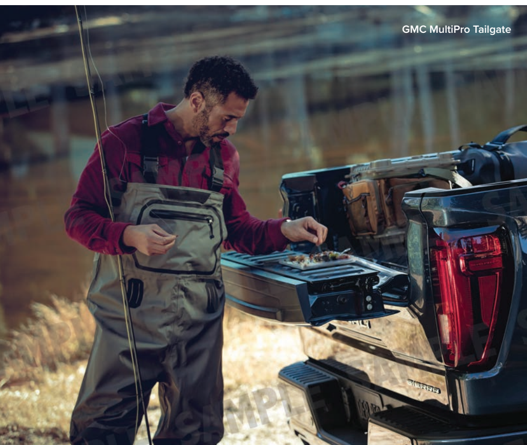
GMC MultiPro Tailgate