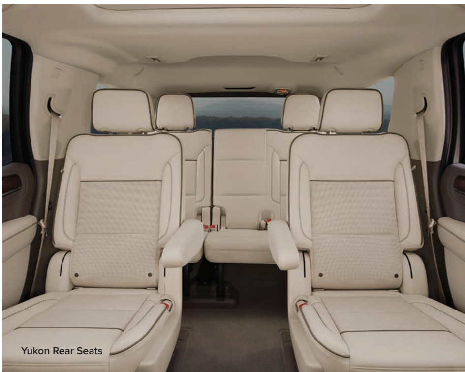
Yukon Rear Seats

This past fall is the first-ever Yukon AT4 arrived. Take your adventures off-road. Yukon AT4 offers exclusive features designed to tackle rugged terrain. Key features include