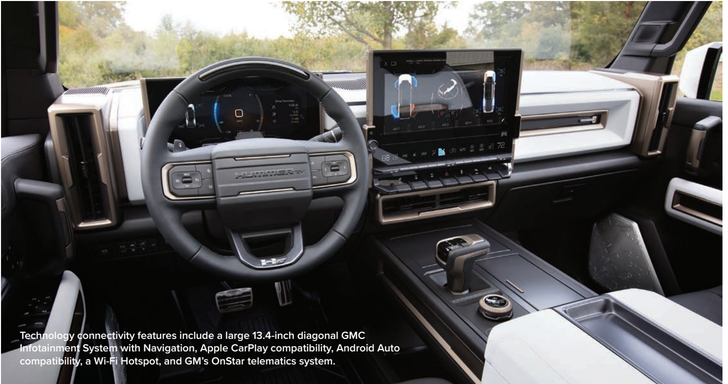
Technology connectivity features include a large 13.4-inch diagonal GMC Infotainment System with Navigation, Apple CarPlay compatibility, Android Auto compatibility, a Wi-Fi Hotspot, and GM's OnStar telematics system.