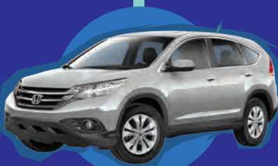
2014 Honda CR-V

Visit your local Honda dealer to pick up one of our interactive brochures and see which model fits your lifestyle!