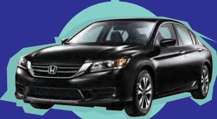
2014 Honda Accord