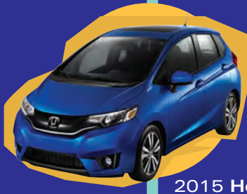
2015 Honda Fit

Just like your degree, there are benefits to getting a new Honda. Check out which model fits your lifestyle. Pick your next set of wheels through the Honda Grad Program. [3]