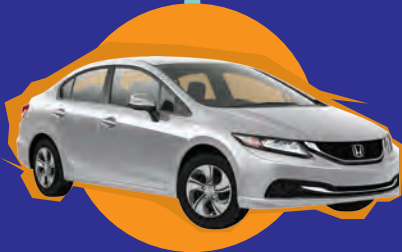
2014 Honda Civic