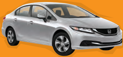
2014 Honda Civic