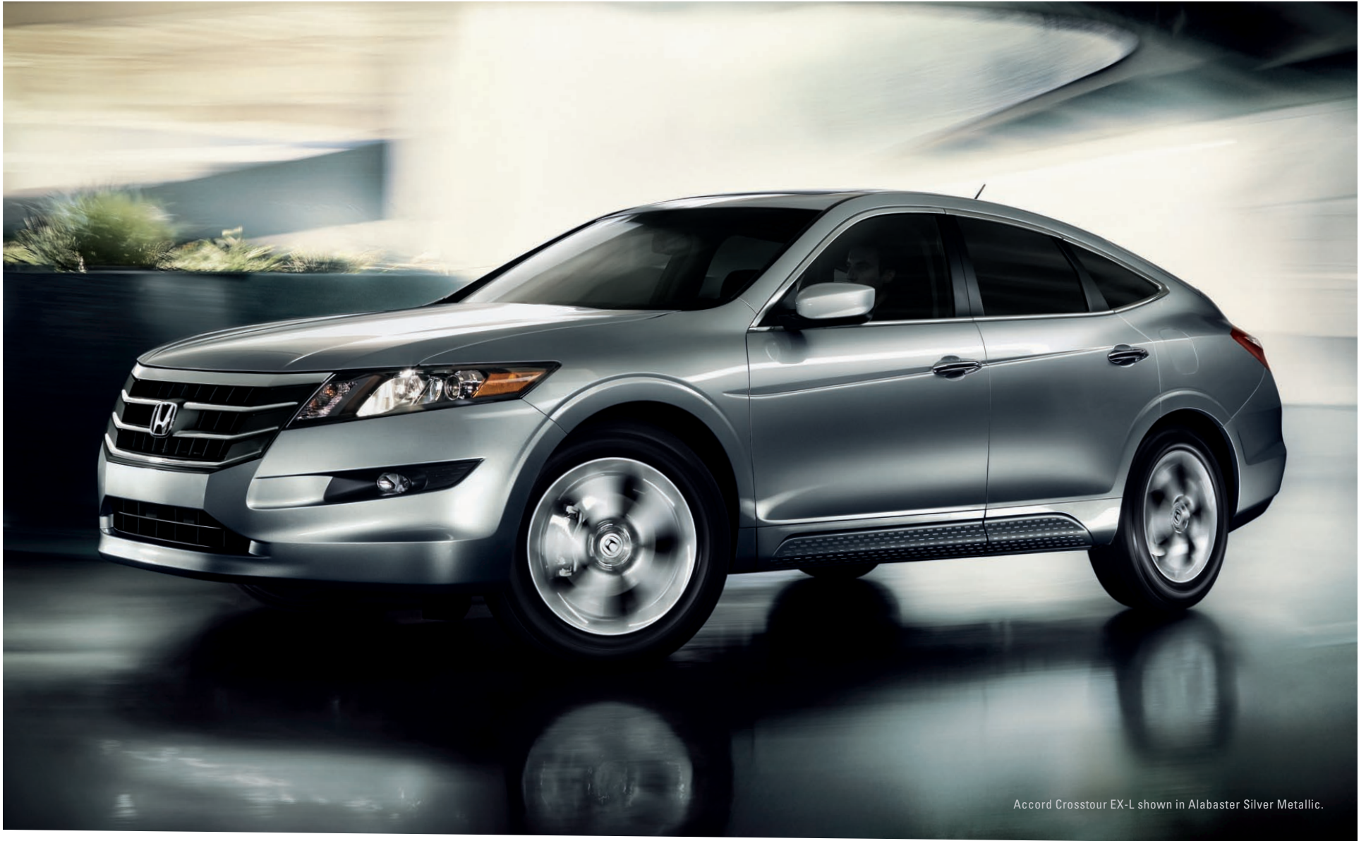
Accord Crosstour EX-L shown in Alabaster Silver Metallic.

CALL IT WELL-ROUNDED, UN-SQUARED OR SIMPLY, SLEEK