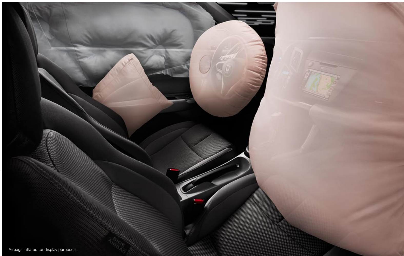
Airbags inflated for display purposes.

The CR-Z is equipped with 4-wheel disc brakes with anti-lock braking system (ABS) for impressive stopping power. The Brake Assist feature helps apply full braking in some emergency situations, and Electronic Brake Distribution (EBD) can distribute brake force among the four wheels based on how much load each wheel is bearing.