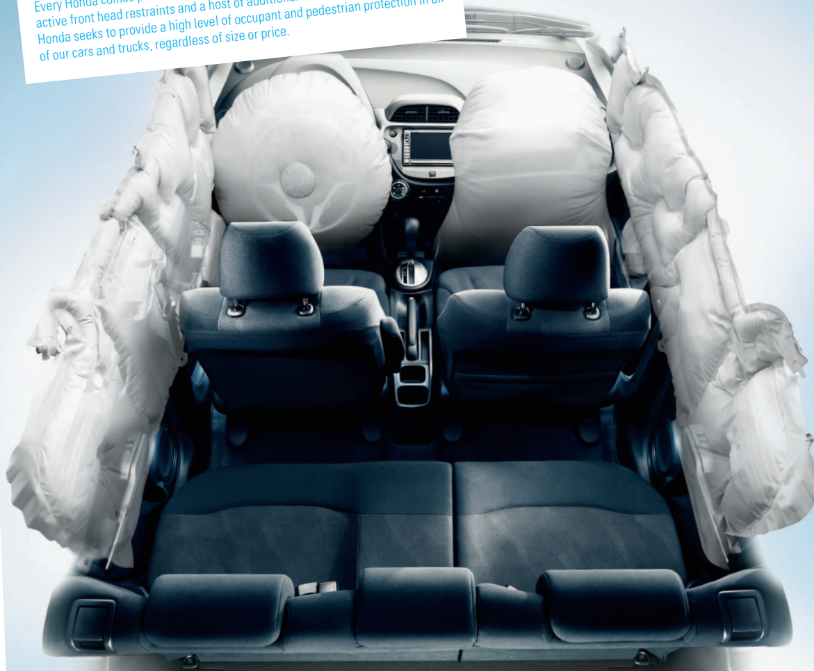
Fit Sport shown with Black Fabric and available Honda Satellite-Linked Navigation System.†

Every Honda comes packed with safety technology. Take Fit. It offers six airbags, active front head restraints and a host of additional standard safety features.* Honda seeks to provide a high level of occupant and pedestrian protection in all of our cars and trucks, regardless of size or price.