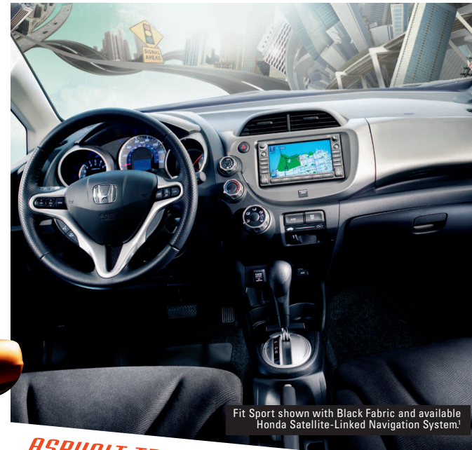
Fit Sport shown with Black Fabric and available Honda Satellite-Linked Navigation System!

It commands respect. And admiration. An urban accomplice housed in five doors. Turn the key and 1.5 liters of pent-up energy spring into action. Change up the seating and challenges back down. This is Fit. A city's greatest champion.