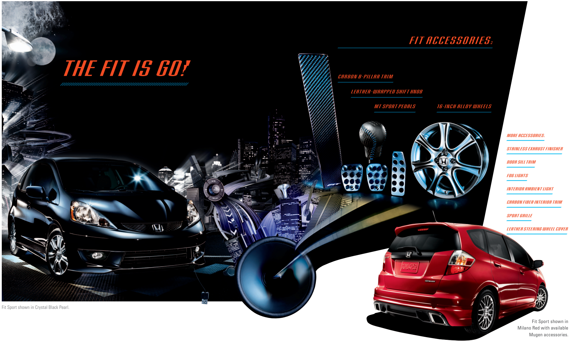
Fit Sport shown in Crystal Black Pearl.