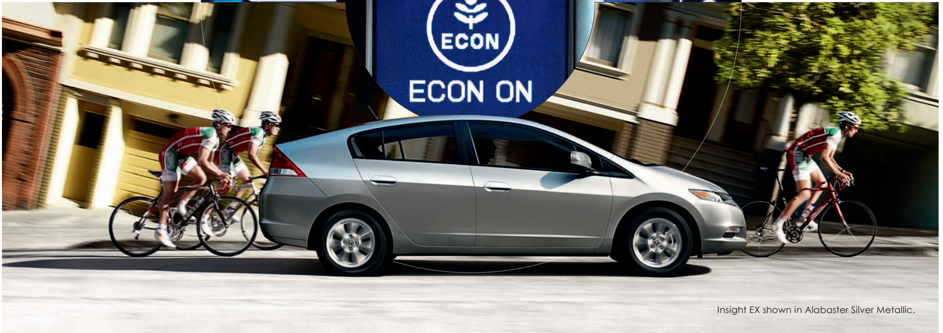
Insight EX shown in Alabaster Silver Metallic.

EPA numbers are important, but the way you drive also affects your fuel economy. 2 The Insight features the remarkable Eco Assist system that helps you monitor your driving habits, enabling you to make adjustments to your style that may help improve your efficiency.