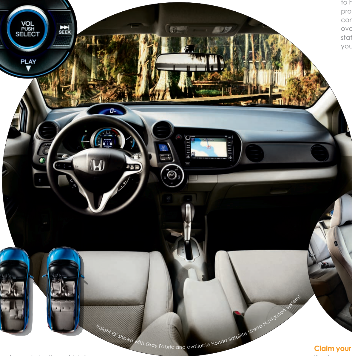
Insight EX shown with Gray Fabric and available Honda Satellite-Linked Navigation System†