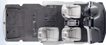
3-passenger cargo mode