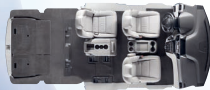
3-passenger cargo mode 2