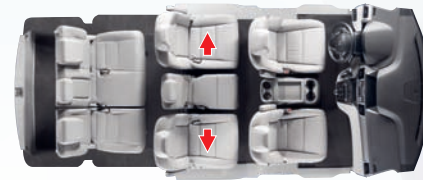
2nd-row "wide mode"