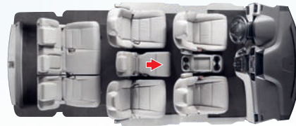
Multi-function center seat slides forward