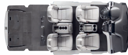
4-passenger cargo mode