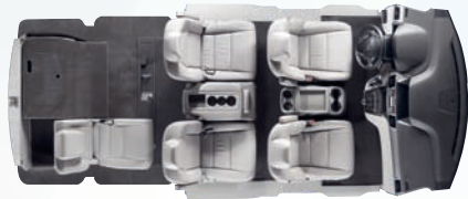
5-passenger cargo mode

There's one main reason for buying a minivan: flexibility. And the 2011 Honda Odyssey has been rethought to be even more configurable than ever before. Whether the day involves transporting adults in comfort, maximizing your kid-carrying capacity or even making a run to the lumber yard, this interior is ready to respond—quickly and easily.