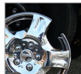
Cosmetic Damage to Hubcaps