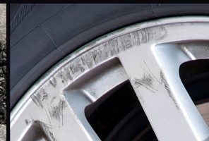
Cosmetic Wheel Coverage