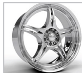
Cosmetic Damage to Chrome/Chrome Clad