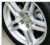
Aftermarket Wheels with no Surcharges