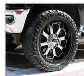
Oversize Tires and Wheels