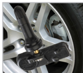
Tire Pressure Monitoring Sensors