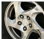
Cosmetic Damage Wheel Replacement