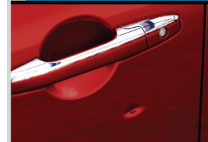
Paintless Dent Repair