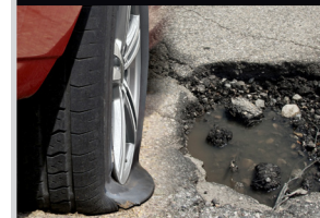
Tire & Wheel Protection