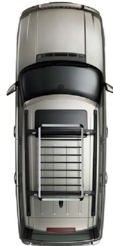
Luggage Carrier* Load capacity: 191 lbs. on Sports Bars; 181 lbs. on Roof Rails and Crossbars. LR006848