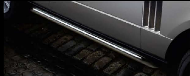
Side Protection Tubes – Stainless Steel Can be fitted with or without front mudflaps. VUB001230

Body-Colored Mirror Kit (not shown) For 2003-09 vehicles only. Buckingham Blue — LR004863 Chawton White — LR004862 Java Black — LR004864 Rimini Red — LR004833 Stornoway Grey — LR004837 Zermatt Silver — LR004836 Primed (Upper) — LR004867 Primed (Lower) — LR004866