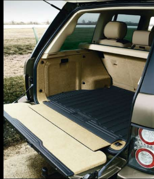
Loadspace Rubber Mat Helps protect carpet from dirt. Waterproof with retaining lip and non-slip surface. LR003894