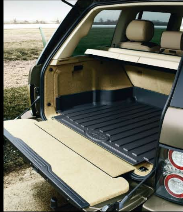
Loadspace Protector With removable eyelets that provide easy access to tie-down points, this accessory also includes an anti-slip mat (not shown). EBF000040