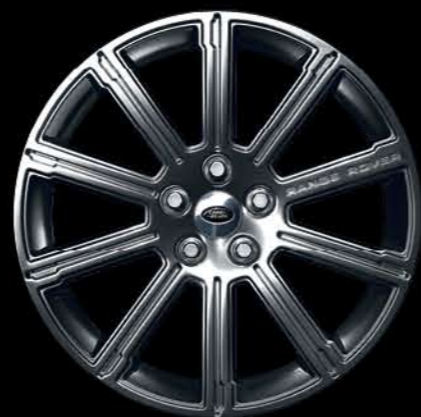
20-inch 10-Spoke Alloy Wheel (Rim only) Polished Finish* — LR017926 2010 vehicles onward

Center Cap: Sparkle Silver Finish — RRJ500030WYS** High Gloss Silver Finish — RRJ500030WYT**