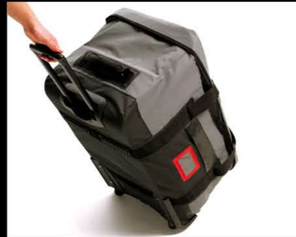
Rolling Duffel Bag This rainproof duffel bag features 4 cu. ft. of storage, a telescoping handle and inline wheels. It easily attaches to, and detaches from, the Luggage Carrier. LR004681