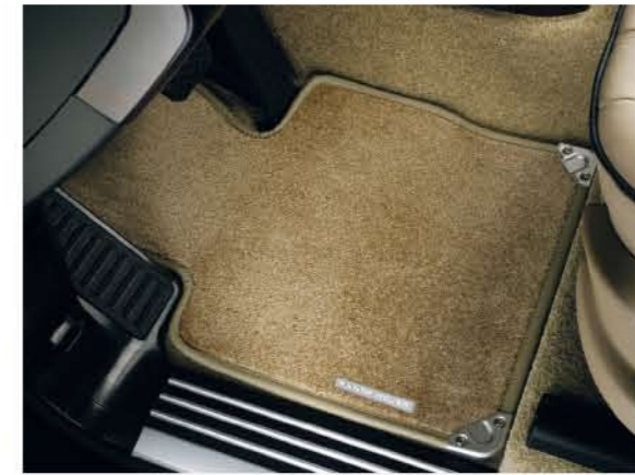
Premium Carpet Mat Set Deep pile carpet with waterproof backing.