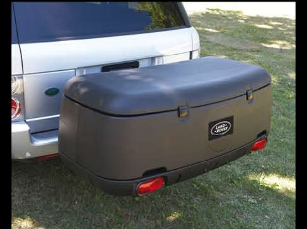
Cargo Carrier Carry additional items and gear without compromising interior space with this 13.5-cu.-ft. storage pod. This durable container holds up to 250 lbs. and comes with tail lights and a detachable 21" x 49" tray. Requires Towing Electrics Kit (see page 18), sold separately, for installation. LR004682