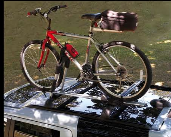
Bike Carrier (Ride Ready) Securely transport your bike on the roof of your Range Rover with this durable, lockable carrier that conveniently requires no disassembly of the bike. LR006847