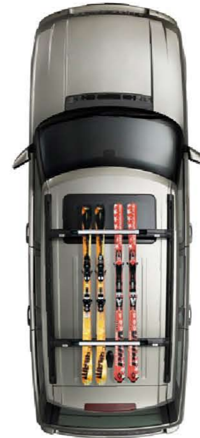
Ski and Snowboard Carrier* Lockable for security. Carries four pairs of skis or two snowboards. Incorporates slider rails for easy loading. Load capacity: 79 lbs. LR006849