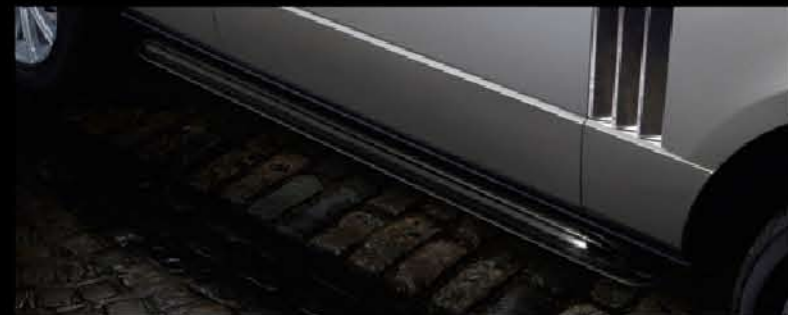
Side Protection Tubes – Black Steel Can be fitted with or without front mudflaps. VUB002510