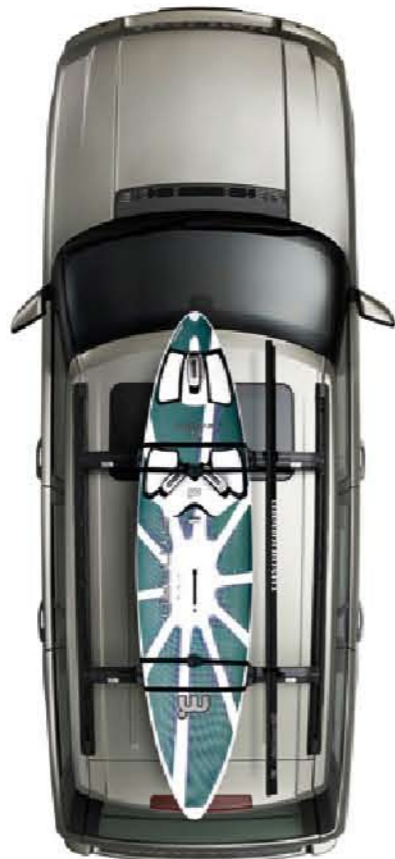
Aqua Sports Carrier* Carries one surfboard or sailboard and mast, or one canoe or kayak. Load capacity: 99 lbs. LR006846