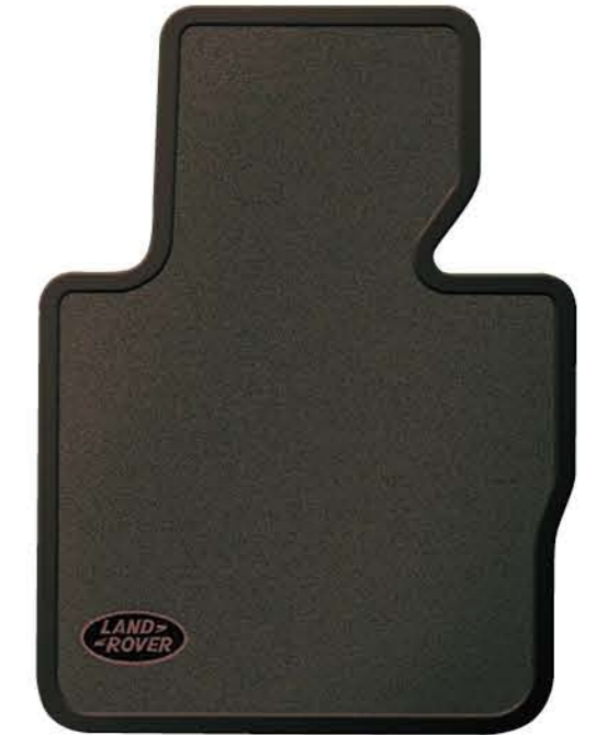
Rubber-Backed Carpet Mat Range Rover's stain-resistant rubber-backed mats feature standard pile carpeting for the front and rear seats. Available in four colors.

Aspen — EAH000310LUP Jet — EAH000310PVA Navy — EAH000310JMN Sand (shown) — EAH000310SUN