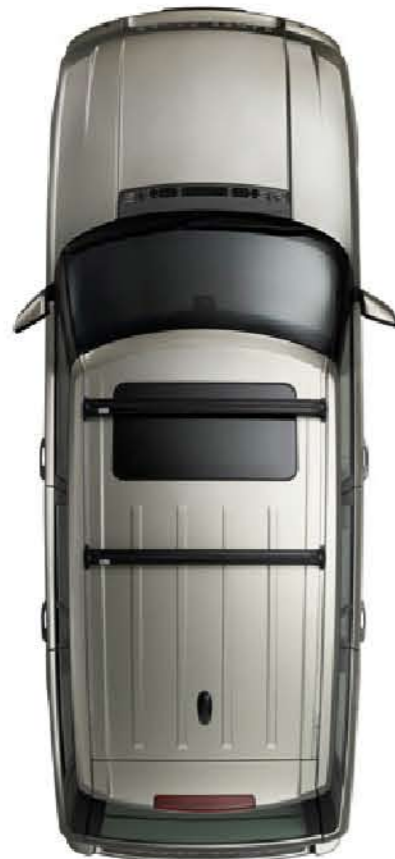
Sports Bars Fixed position crossbars for carrying Land Rover roof-mounted accessories. Easily removed when not in use. Aerodynamic profile. Load capacity: 212 lbs. Vehicle height when fitted: 76.36". VUB502790