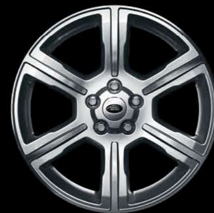
20-inch 6-Spoke Alloy Wheel (Rim only) Diamond Turned Finish* — LR012835 2010 vehicles onward

Center Cap: Bright Polished Finish — RRJ500060WYU**