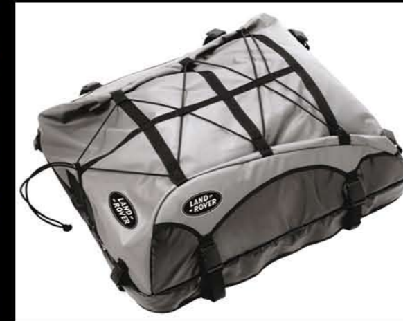
Roof Cargo Bag Store up to 15 cu. ft. of goods in this durable, attractive bag. Made from weatherproof materials and comes with eight straps. Works ideally with the Luggage Carrier (LR006848) found on page 15. LR004683