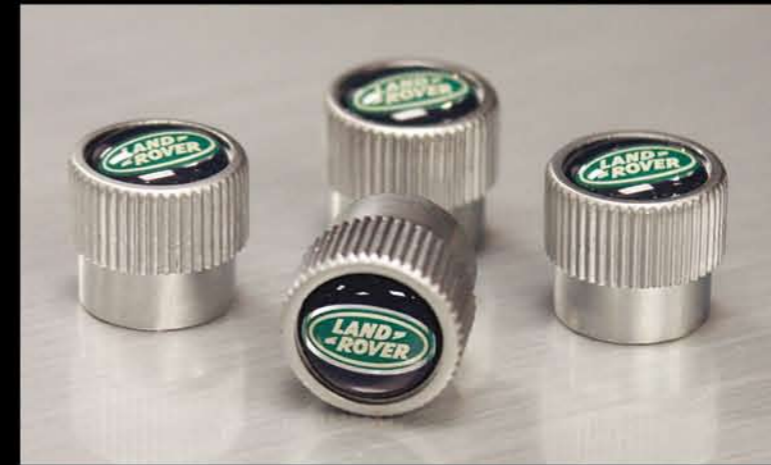
ABS Valve Stem Caps Enable the Land Rover presence to permeate every detail of your Range Rover — right down to its tire valve stem caps (Tire Pressure Monitoring System compatible). Full-color Land Rover logo — LR006186 Black logo on silver background — LRN90310