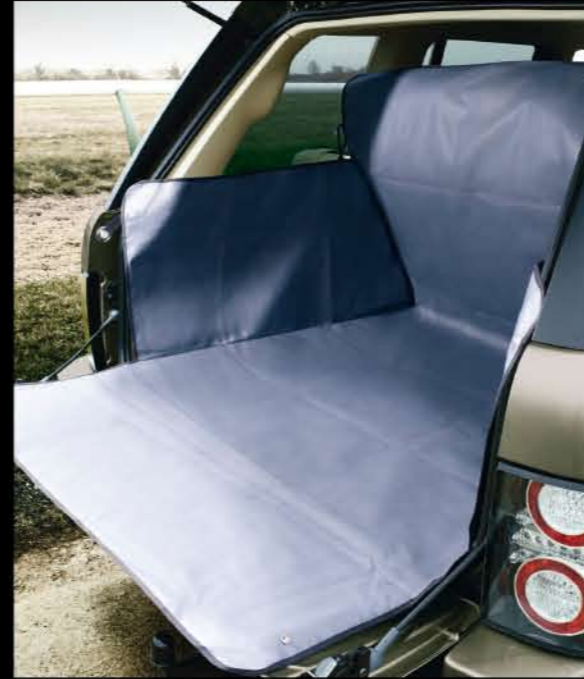
Flexible Loadspace Protector Heavy-duty fabric protects loadspace up to window height. Includes protective gloves. VPLMS0017