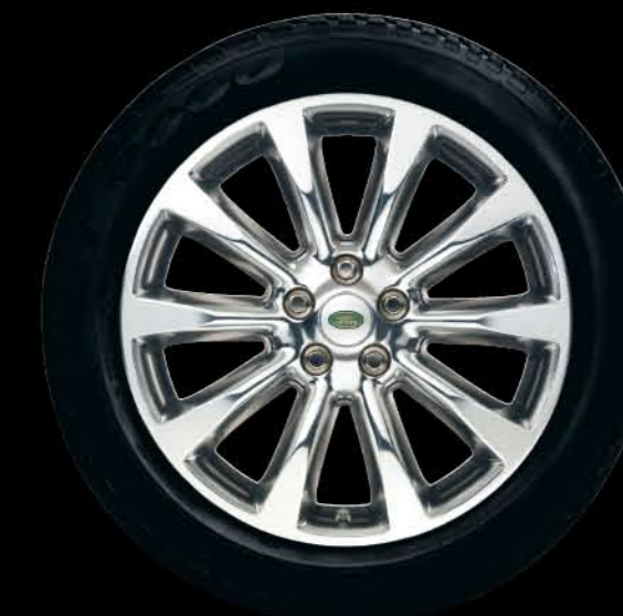
20-inch 10-Spoke Alloy Wheel (Rim only) Polished Finish — 2006-09 gasoline and TDV8 vehicles only 315MHz — RRC503940MMM

Center Cap: Bright Polished Finish — RRJ500060MUZA Bright Polished Finish — RRJ500060WYU**