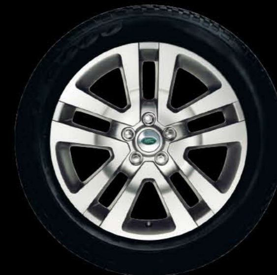
20-inch Bi-Colored Alloy Wheel (Rim only) 2006-09 gasoline and TDV8 vehicles only — LR005241

Center Cap: Bright Polished Finish — RRJ500060WYU**