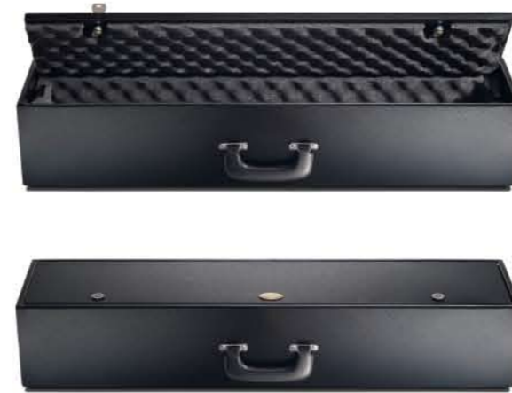
Gun/Security Box Heavy gauge steel with two high security locks. Internal dimensions: 34" long x 7" wide x 7" high. STC8018AB

Gun/Security Box Installation Kit (not shown) VUB000750