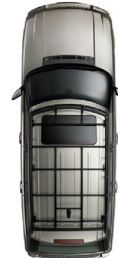
Expedition Roof Rack Load capacity: 178 lbs. Vehicle height when fitted: 78½". CAB500070PMA