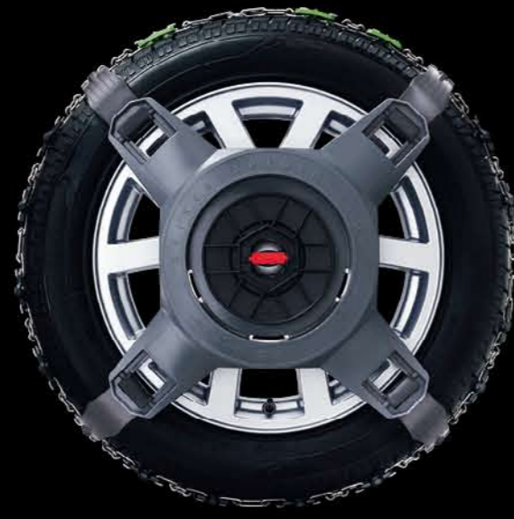
Snow Traction System For front 20" wheels only LR005737

Center Cap: Sparkle Silver Finish — RRJ500030MNH ^ Sparkle Silver Finish — RRJ500030WYS **