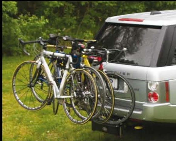
Swing-Away Bike Rack Transport bikes with this durable rack that swings away for easy loadspace access. 4-bike-capacity rack — LR005983