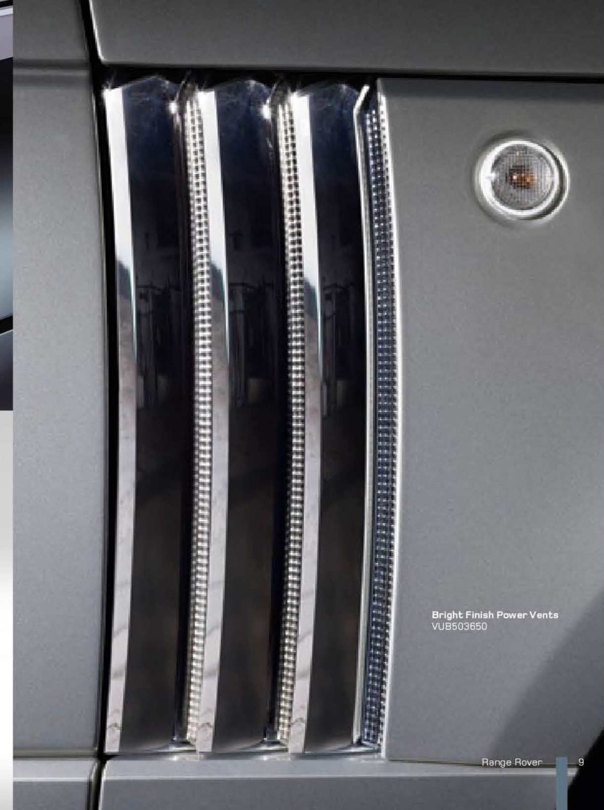
Bright Finish Power Vents VUB503650