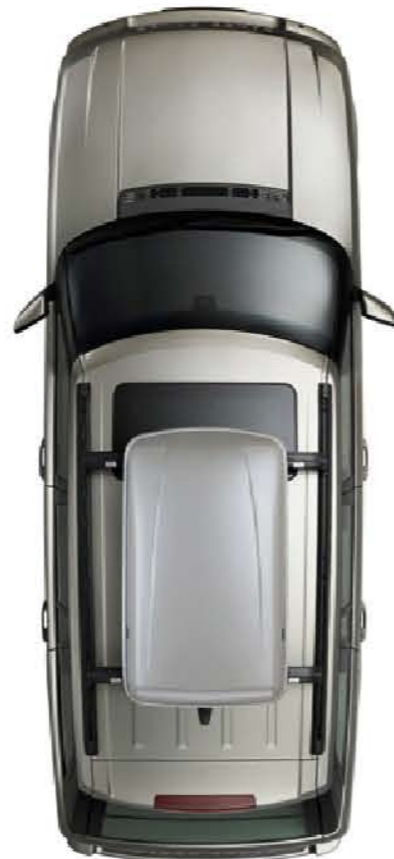
Luggage Box* Lockable for security. Opens from both sides. External dimensions: 63" long x 37" wide x 16" high. Volume: 118 gallons. Load capacity: 132 lbs. LR005334