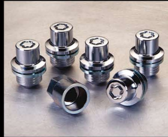
Locking Wheel Nuts These exclusively designed Locking Wheel Nuts help deter wheel theft. They're finished in black to match your Range Rover's lug nuts. For 2006 vehicles and newer — VUB504120 For 2003-05 vehicles — RRB500040

Snow Chains (not shown) For rear 18" and 19" wheels VUJ000020