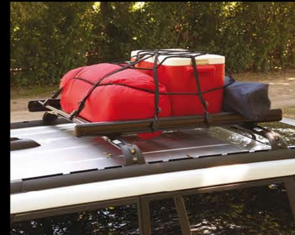
Bungee Cargo Net Secure cargo with this durable cargo net that will not rust or scratch your gear. Extremely flexible, this net works especially well with the Land Rover Luggage Carrier (LR006848) found on page 15. LR005083