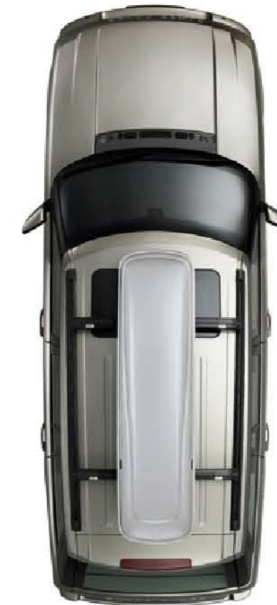
Sports Box* Can be mounted on either side of the vehicle for curbside opening in any country. Internal retention system for skis or other long objects. Lockable for security. External dimensions: 90" long x 24" wide x 15" high. Volume: 105 gallons. Load capacity: 132 lbs. VPLDR0002