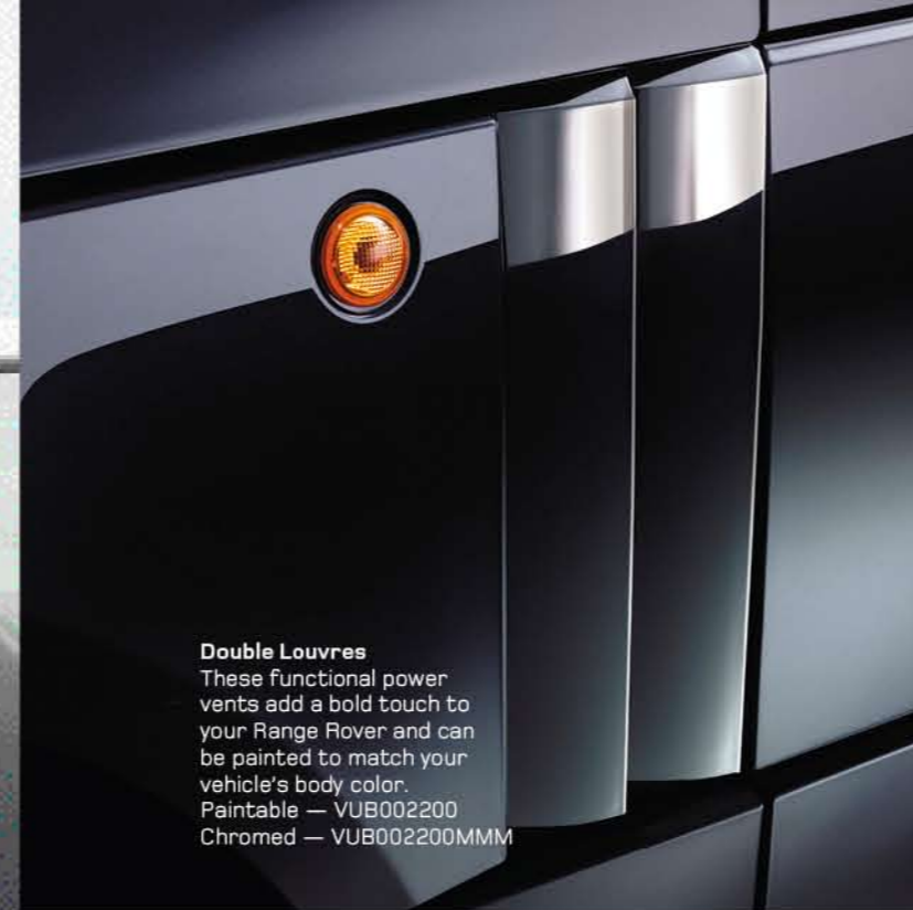
Double Louvres These functional power vents add a bold touch to your Range Rover and can be painted to match your vehicle's body color. Paintable — VUB002200 Chromed — VUB002200MMM

Wind Deflectors Limit wind noise and airflow into your Range Rover when driving with the windows open with these easy-to-attach, smoke-colored Wind Deflectors. Sunroof — LR006517 Side Windows — LR006516 Hood — LR006518