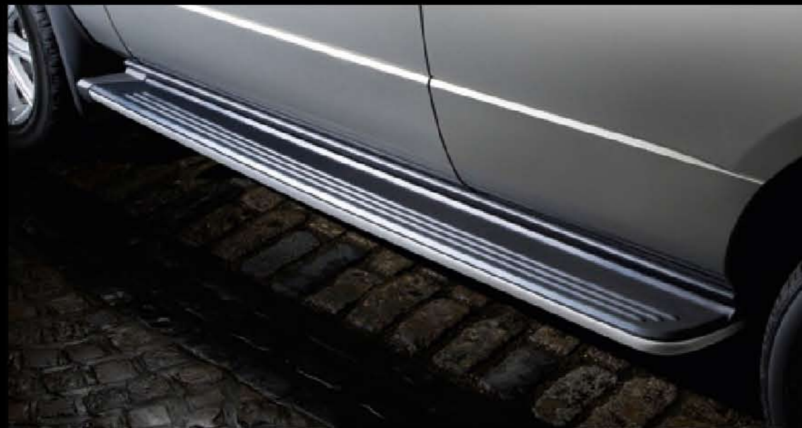
Fixed Side Steps Includes integrated front mudflaps. VUB503660

The Range Rover's elegant lines can be tailored to meet more individual tastes with a number of uniquely styled exterior accessories. Deployable side steps aid entry and exit, as well as roof loading. They are automatically activated when the doors are opened and then stowed as the doors are closed. Side protection tubes are available in stainless steel and black finishes, while a bright finish mirror kit also adds sophistication.