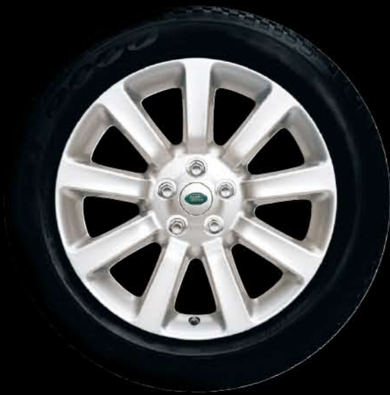
20-inch 9-Spoke Alloy Wheel (Rim only) Sparkle Silver Finish — RRC502690MNH For 2006-09 gasoline and TDV8 vehicles only

Recommended Tire: Continental Conti Cross UHP 255/50 R20 109V AT-S