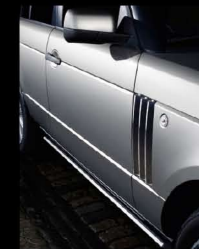
Deployable Side Steps (stowed)

*The Electronic Control Unit (ECU) and Wiring Harness must be ordered with deployable side steps.