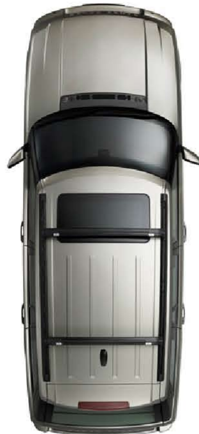
Roof Rails and Crossbars Adjustable position crossbars included for carrying all Land Rover roof-mounted accessories featured. Lockable for security. Load capacity: 201 lbs. Vehicle height when fitted: 77.35". CAB000040PMA