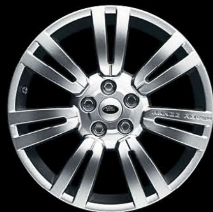
20-inch V-Spoke Alloy Wheel (Rim only) Sparkle Silver Finish* — LR008766 2010 vehicles onward

A set of striking alloy wheels for the new 2010 Range Rover can add that dash of personalization. A number of unique designs have been created to surpass the most demanding requirements while extreme winter conditions are addressed with a snow traction system.