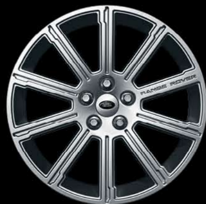
20-inch 10-Spoke Alloy Wheel (Rim only) Sparkle Silver Finish* — LR010666 2010 vehicles onward

Center Cap: Sparkle Silver Finish — RRJ500030WYS** High Gloss Silver Finish — RRJ500030WYT**