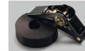
Ratchet Strap Tie strap for securing items onto roof racks. Length: 16'4". CAR500010

Despite the Range Rover's impressive load carrying capabilities, extra capacity is sometimes required. Eight specialized roof carriers are available to handle a variety of items, from sailboards to suitcases. There is also a rear-mounted bike carrier. Should even greater load carrying capabilities be required, towing equipment is available.