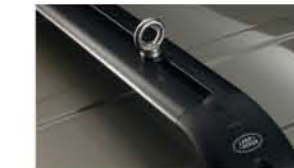
Lashing Eye Kit Six additional tie-down points for use with T-slots on Roof Rails and Crossbars or Sports Bars. VUB503160