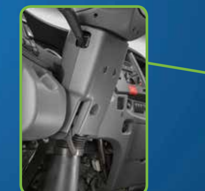
Steering column tilts and adjusts for height