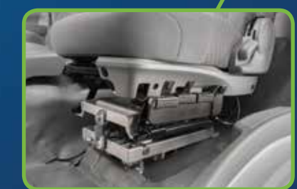
Suspension seat with adjustable height control