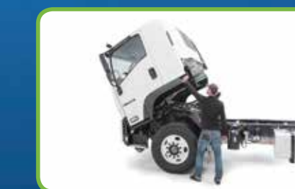
Tilt cab for ease of maintenance