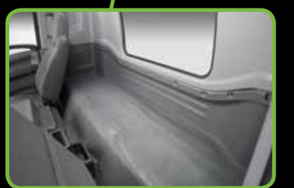
Rear cab area • storage behind seats