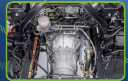
Allison 2000 Series transmission with PTO