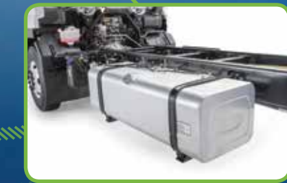
100 gallon aluminum fuel tank