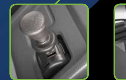
Parking Air Brake