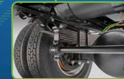
Rear leaf spring