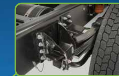
Frame end view • 80 KSI strength