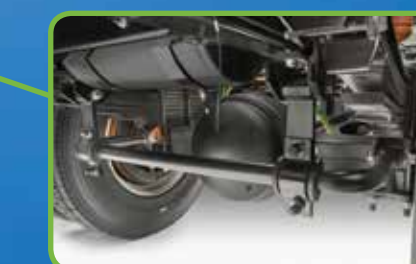
Rear sway bar