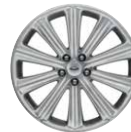
20" Polished Aluminum Optional: 300A Included: 301A, 303A