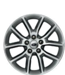
17" Painted Aluminum Standard: SE