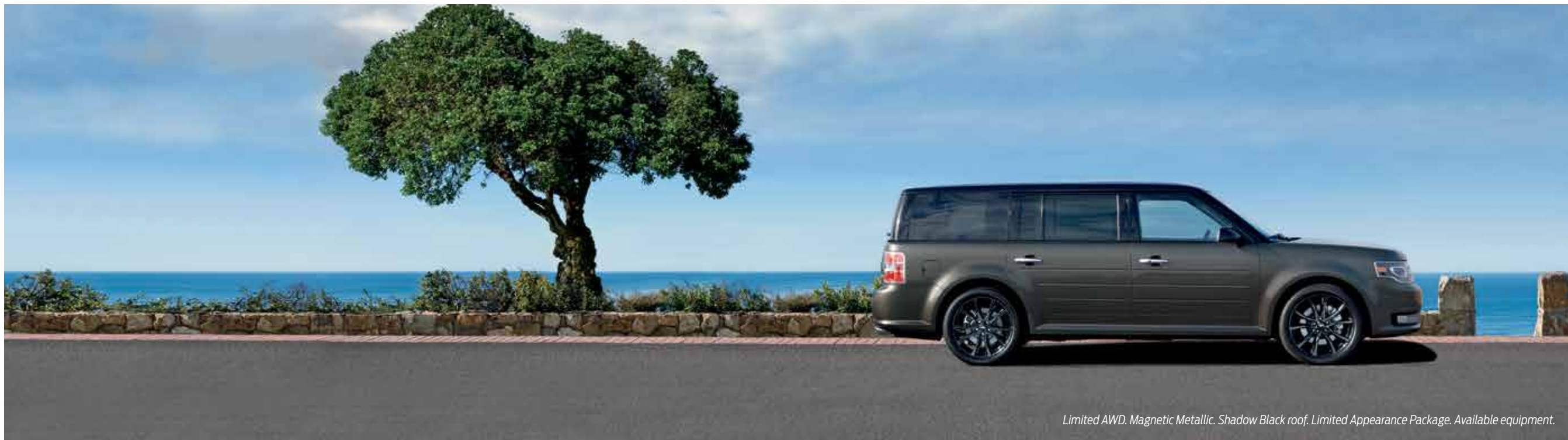
Limited AWD. Magnetic Metallic. Shadow Black roof. Limited Appearance Package. Available equipment.