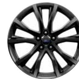
20" High-Gloss Black-Painted Aluminum Included: Limited Appearance Package