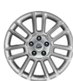
18" Painted Aluminum Standard: SEL