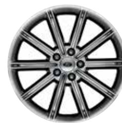
19" Painted Aluminum Standard

High-intensity discharge (HID) headlamps.