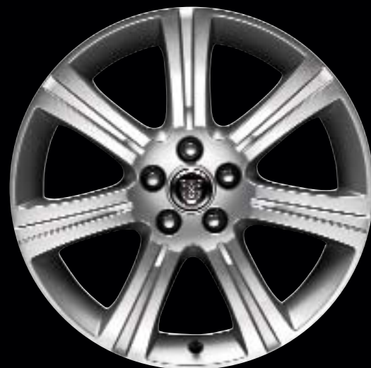
18" VENUS 02C2Z1010