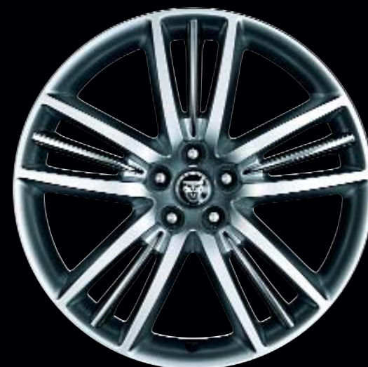
20" SELENA 02C2P14975