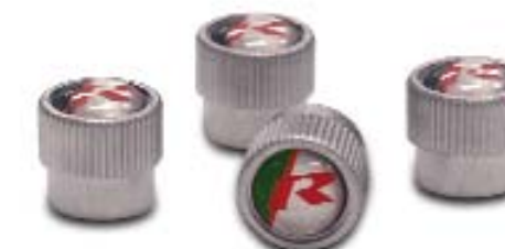
VALVE STEM CAPS (SUPERCHARGED LOGO)