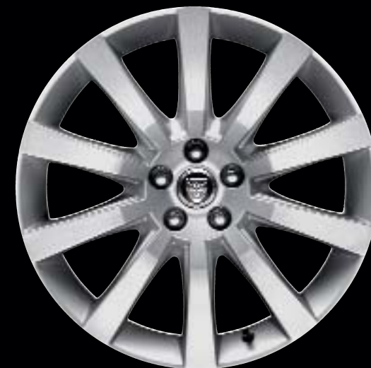
19" CARELIA 02C2Z12002