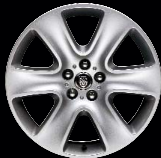
18" CYGNUS 02C2Z3371

ENHANCE THE STRIKING APPEARANCE of your XF with a set of sporty alloy wheels. Both attractive and durable, these alluring accessories help make your XF your own. Thoughtfully engineered by Jaguar specialists, the wheels meet the same exacting standards as your vehicle's standard wheels while complementing the vehicle's beautifully sculpted proportions.