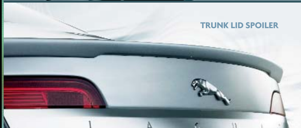
TRUNK LID SPOILER