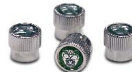
VALVE STEM CAPS (GROWLER LOGO)