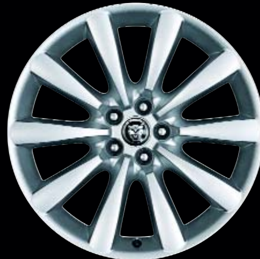
19" ARTURA 02C2Z14209