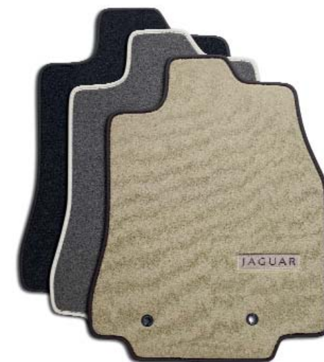
PREMIUM CARPET MATS