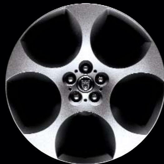
20" VOLANS FRONT SHADOW CHROME 02C2Z14680 20" VOLANS REAR SHADOW CHROME 02C2Z14681