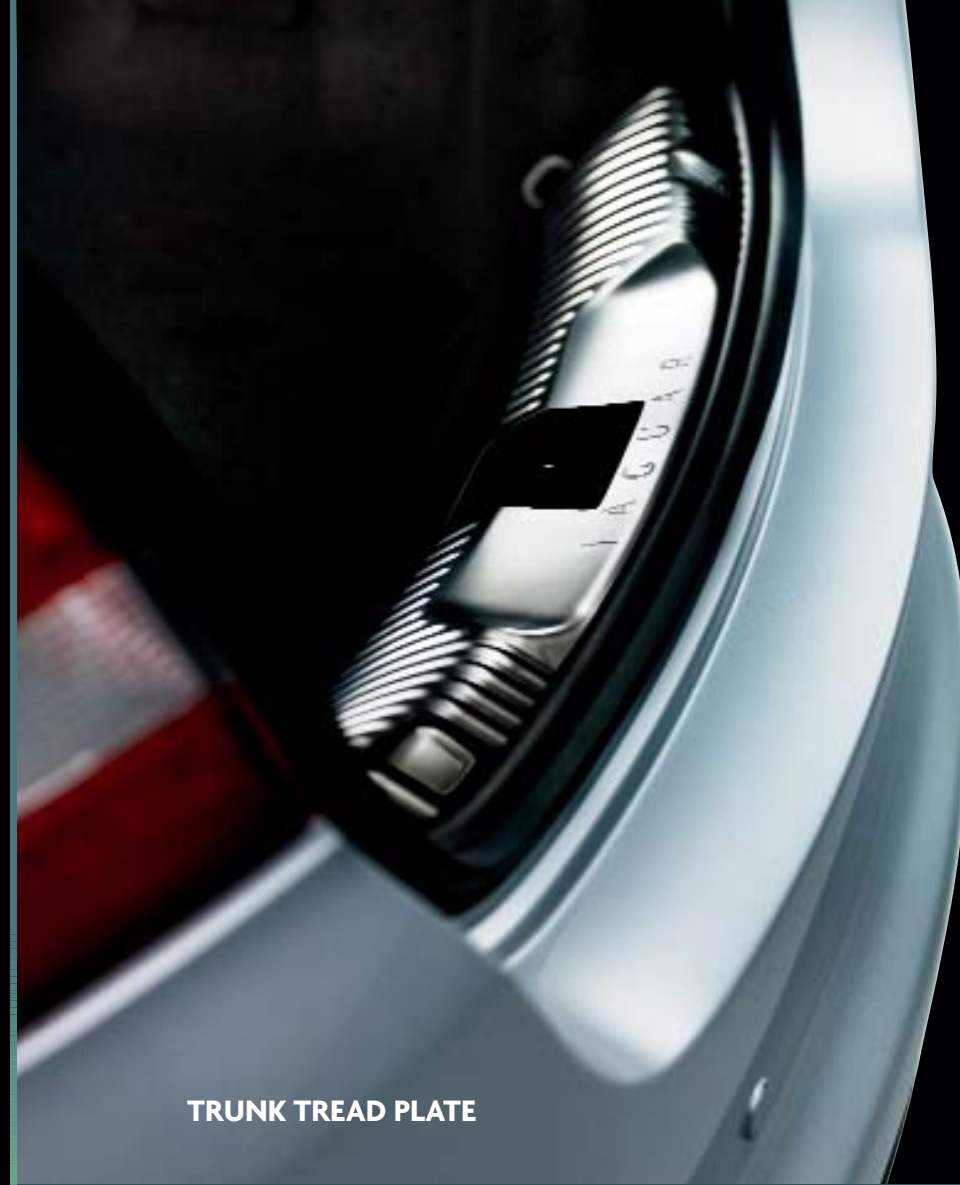
TRUNK TREAD PLATE