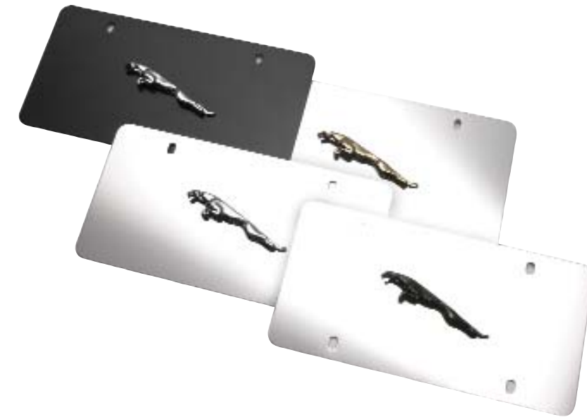
JAGUAR "LEAPER" PLATES

Polished surround with R Performance Logo C2C20092