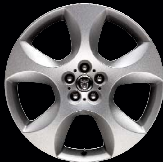
20" VOLANS FRONT 02C2Z2652 20" VOLANS REAR 02C2Z2653