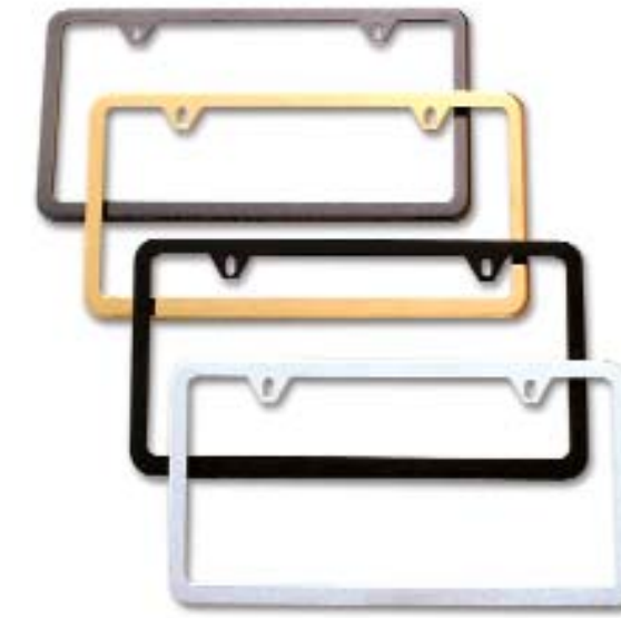
LICENSE PLATE FRAMES (SLIMLINE)