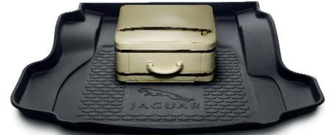
TRUNK UTILITY MAT