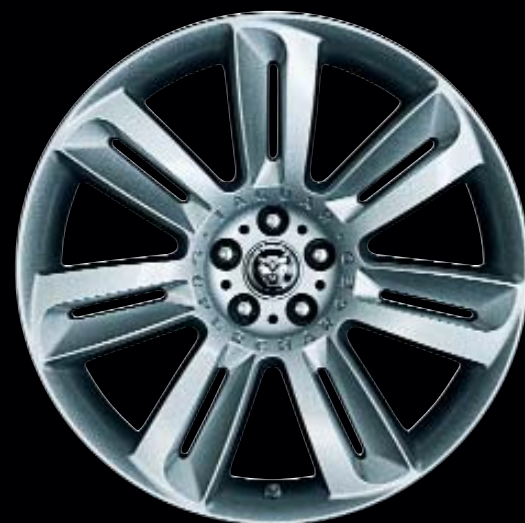
20" NEVIS 02C2Z4429