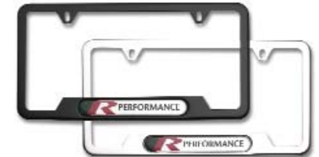
R PERFORMANCE PLATE FRAMES