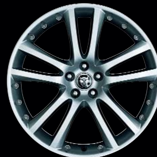
20" SENTA 02C2Z1014