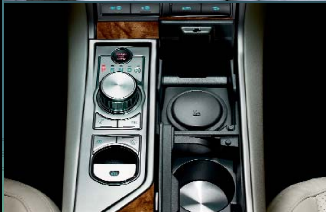
ASHTRAY AND LIGHTER