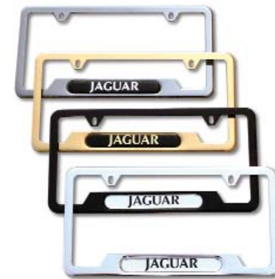
LICENSE PLATE FRAMES (JAGUAR LOGO)