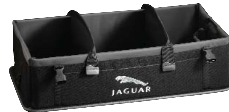
COLLAPSIBLE CARGO CARRIER