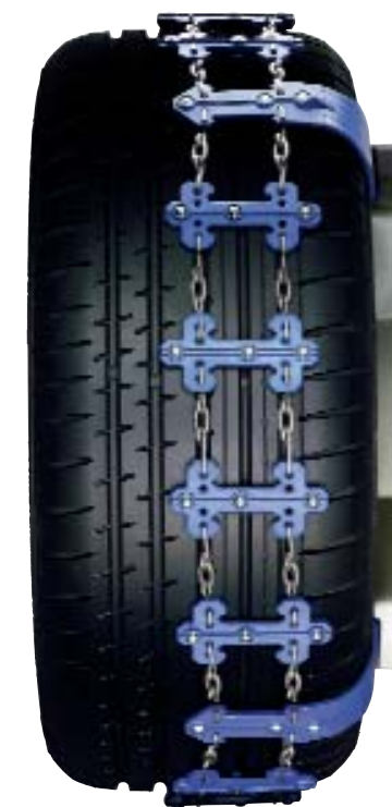
SNOW TRACTION SYSTEM

Accentuate your sedan's wheels with a set of chrome valve stem caps embossed with your choice of two logos. Each set includes four caps. Growler logo C2C39770 Supercharged logo C2C39771