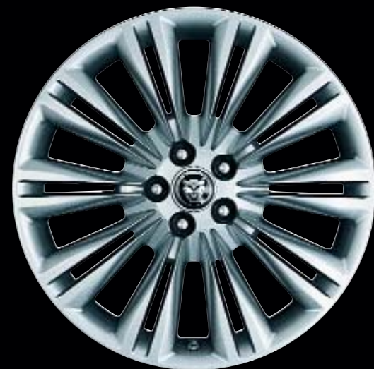
19" CARAVELA FRONT 02C2Z12613 19" CARAVELA REAR 02C2Z12614