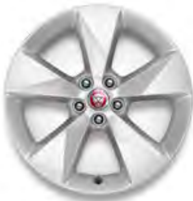
18" Style 5048, 5 spoke, Gloss Silver finish