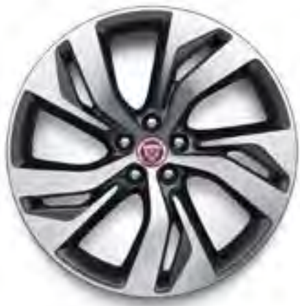
20” Style 5120, 5 spoke, Satin Grey Diamond Turned finish