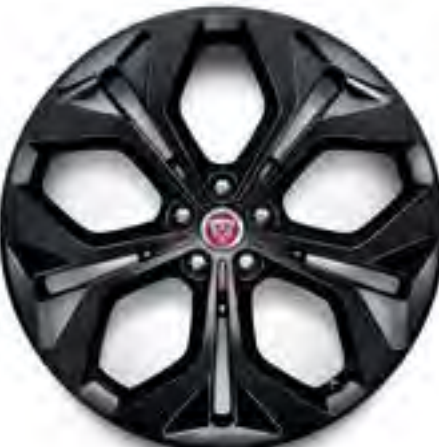
21” Style 5053, 5 split-spoke, Gloss Black