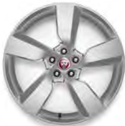
19" Style 5049, 5 spoke, Gloss Silver finish