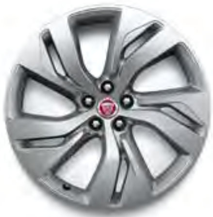
20” Style 5120, 5 spoke, Chrome Shadow