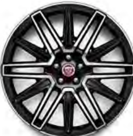
21” Style 1078, 12 split-spoke, Gloss Black Diamond Turned finish