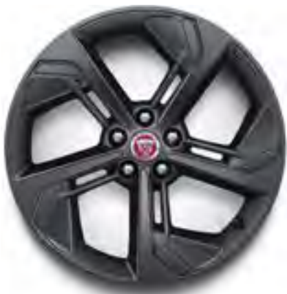
19" Style 5119, 5 spoke, Satin Dark Grey