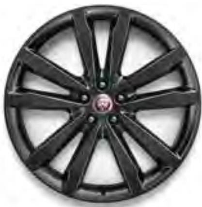
20" Style 5051, 5 split-spoke, Gloss Black