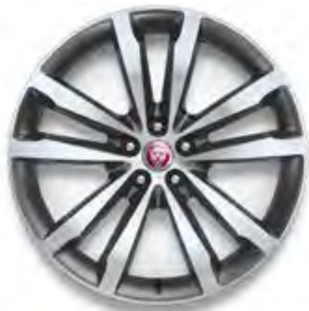
20" Style 5051, 5 split-spoke, Satin Grey Diamond Turned finish