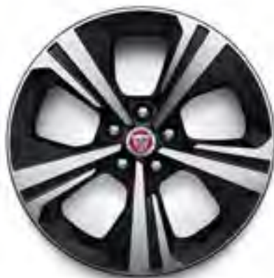
18" Style 5118, 5 spoke, Satin Black Diamond Turned finish