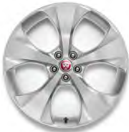
20” Style 5054, 5 spoke, Gloss Silver finish

Personalize your vehicle with a selection of alloy wheels featuring a wide range of contemporary and dynamic designs.