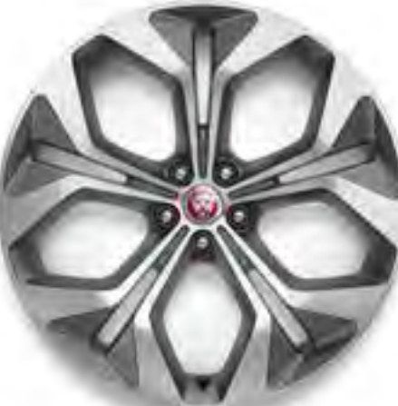
21” Style 5053, 5 split-spoke, Satin Grey Diamond Turned finish