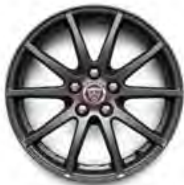
17" Style 1005, 10 spoke, Satin Dark Grey

Personalize your vehicle with a selection of alloy wheels featuring a wide range of contemporary and dynamic designs.