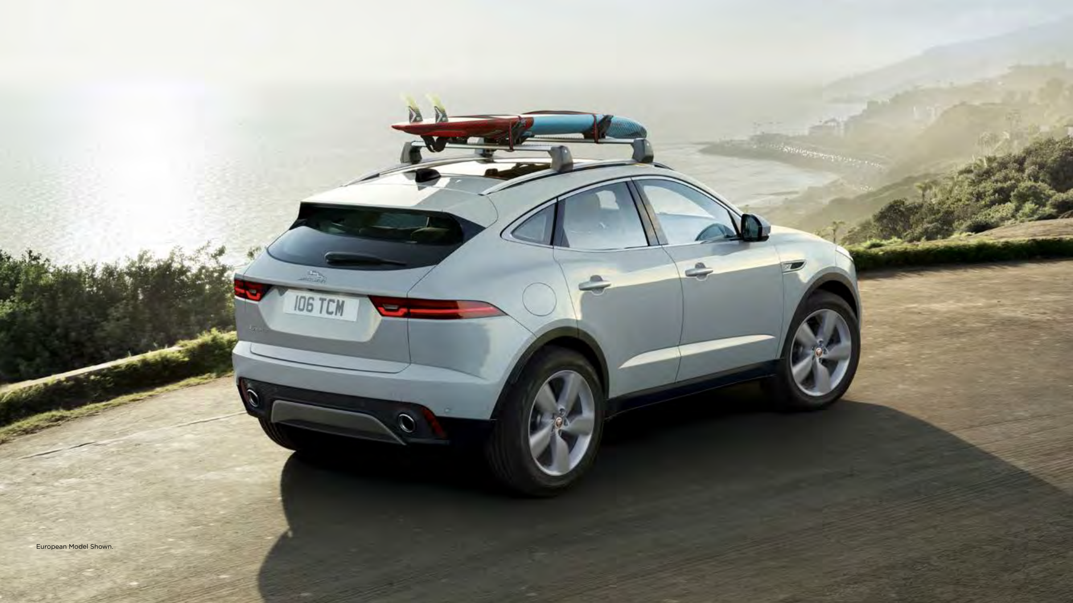
European Model Shown.