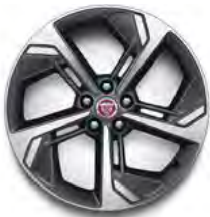
19" Style 5119, 5 spoke, Satin Dark Grey Diamond Turned finish