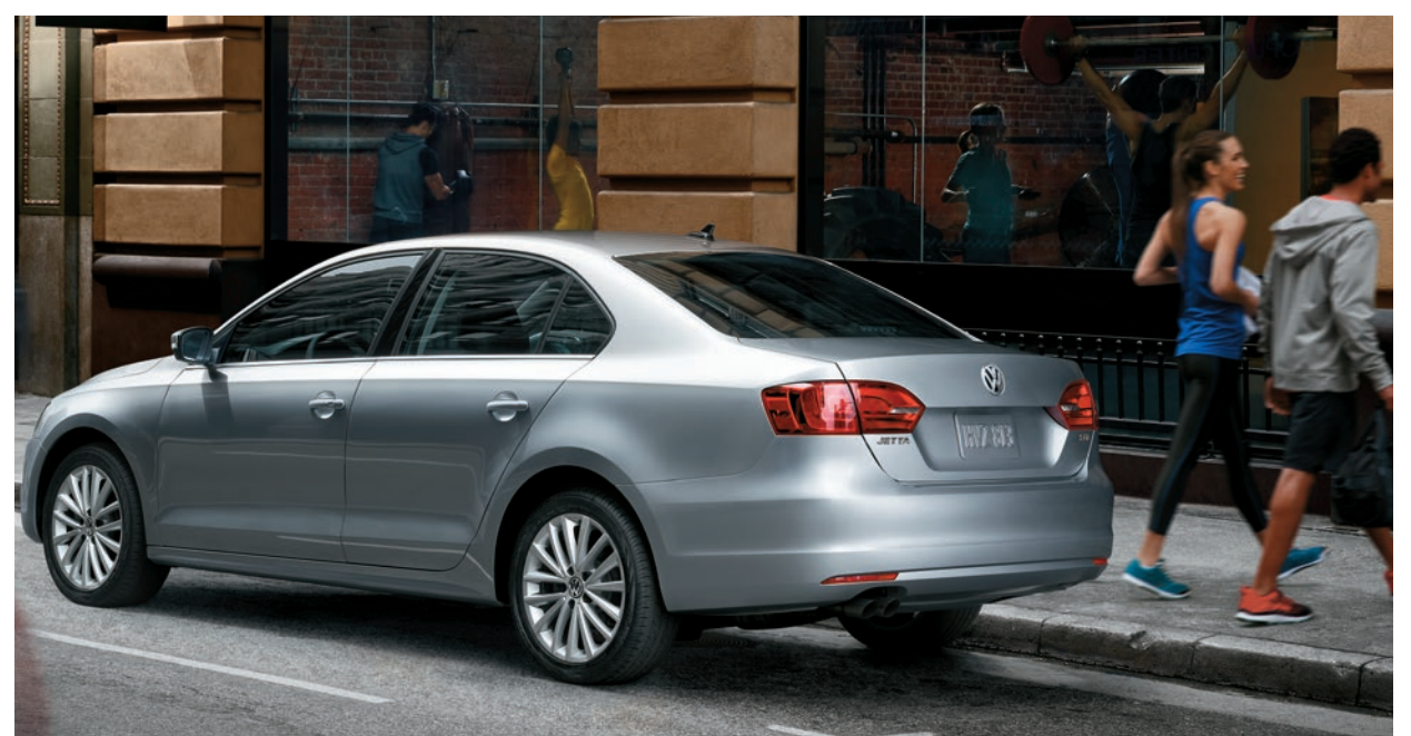
2014 Jetta Quick-Start Guide