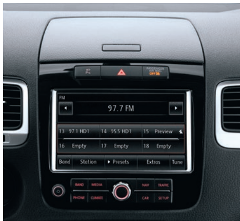
Image shown is the RNS 850.