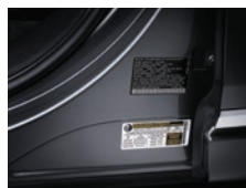
Correct tire pressure

If your vehicle's tires begin losing pressure, you will be alerted by the Tire Pressure Monitoring System. The low pressure light will appear, plus your multifunction display will show you which tires are low.