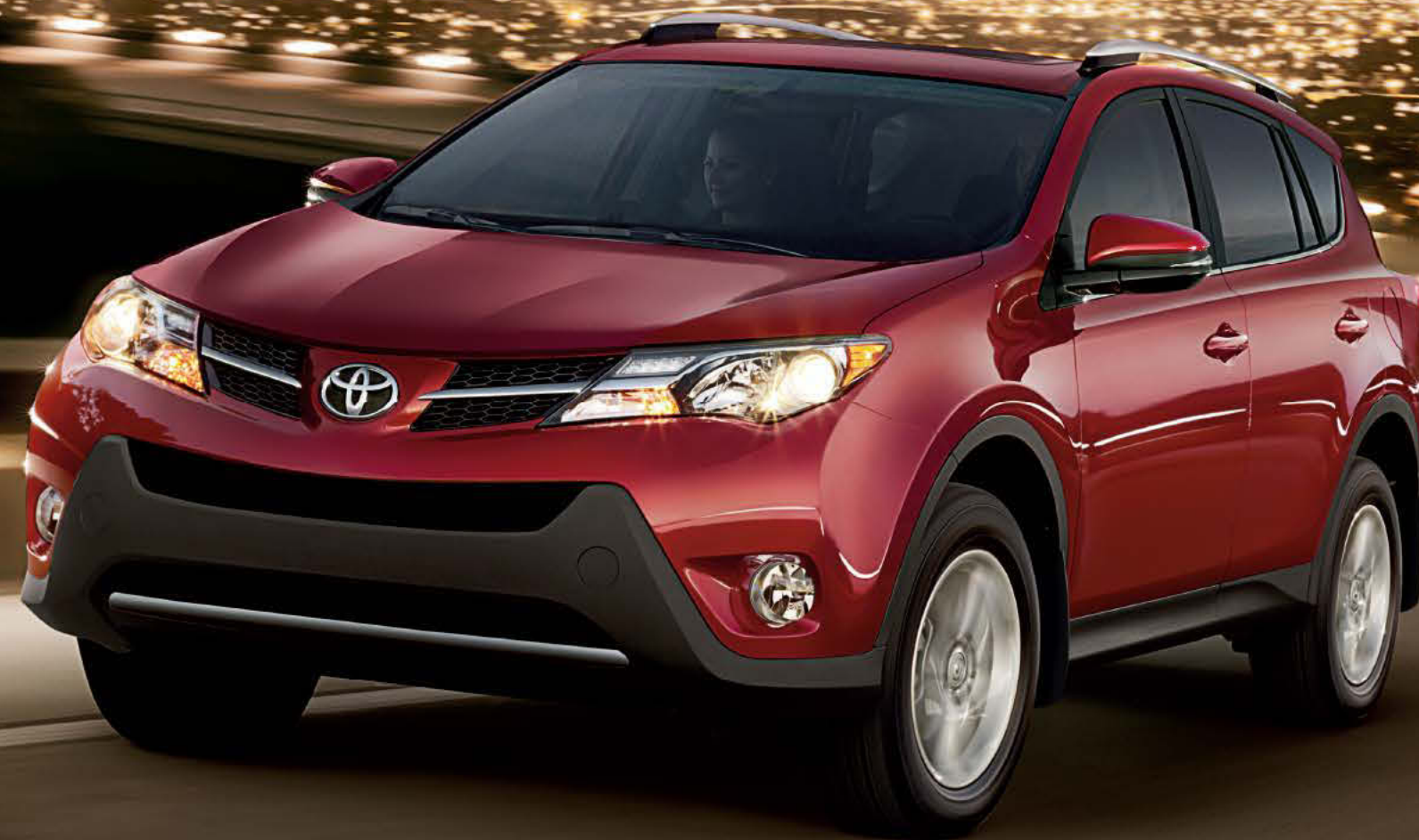
RAV4 XLE shown in Barcelona Red Metallic.

Drive Mode Select enables you to make your RAV4 more responsive or efficient. ECO mode moderates the throttle response, and climate settings for increased fuel efficiency. Sport mode alters the powertrain for faster gear changes and more dynamic throttle mapping. In RAV4 AWD, Sport Mode also adjusts the distribution of engine torque based on steering input to enhance cornering ability.