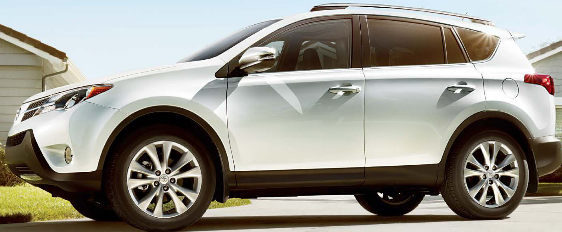
RAV4 Limited shown in Blizzard Pearl.

Incredible features that make your ride complete