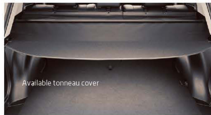
Available tonneau cover

When you need extra space in a hurry, RAV4's 60/40 split rear seatback can fold-down easily to create a wide, flat and spacious cargo area.