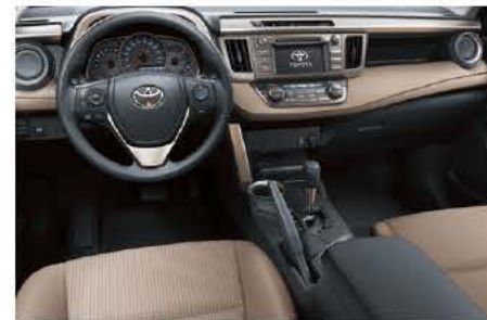
Sand Beige Fabric