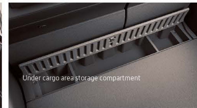
Under cargo area storage compartment