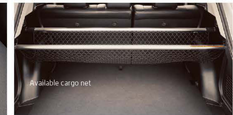
Available cargo net