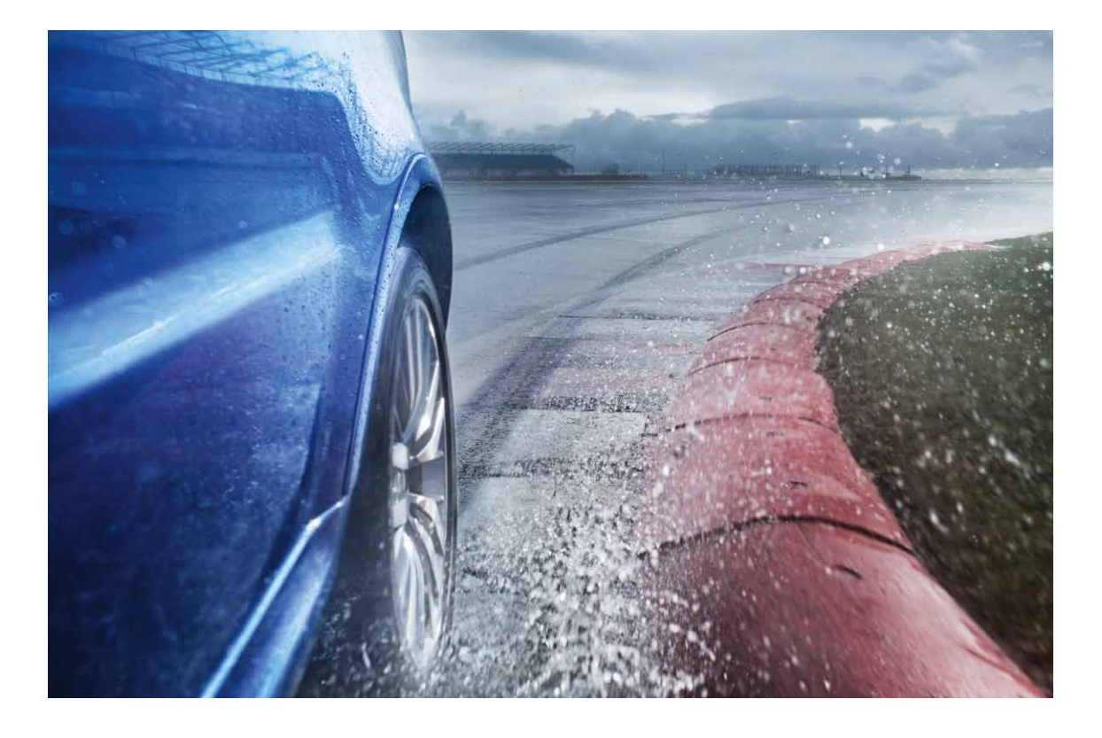
Specialist engineers have tuned the vehicle's chassis for even more agile responses and complemented it with independent suspension. By monitoring the vehicle's movements at least 500 times a second, Adaptive Dynamics also adds greatly to the drive. This is achieved by adjusting damping forces in response to changing road-surface conditions and the way you drive. The vehicle's Anti-Roll Control has also been tuned for faster, flatter cornering and its revised Electric Power-Assisted Steering system delivers a more engaged feeling at speed.