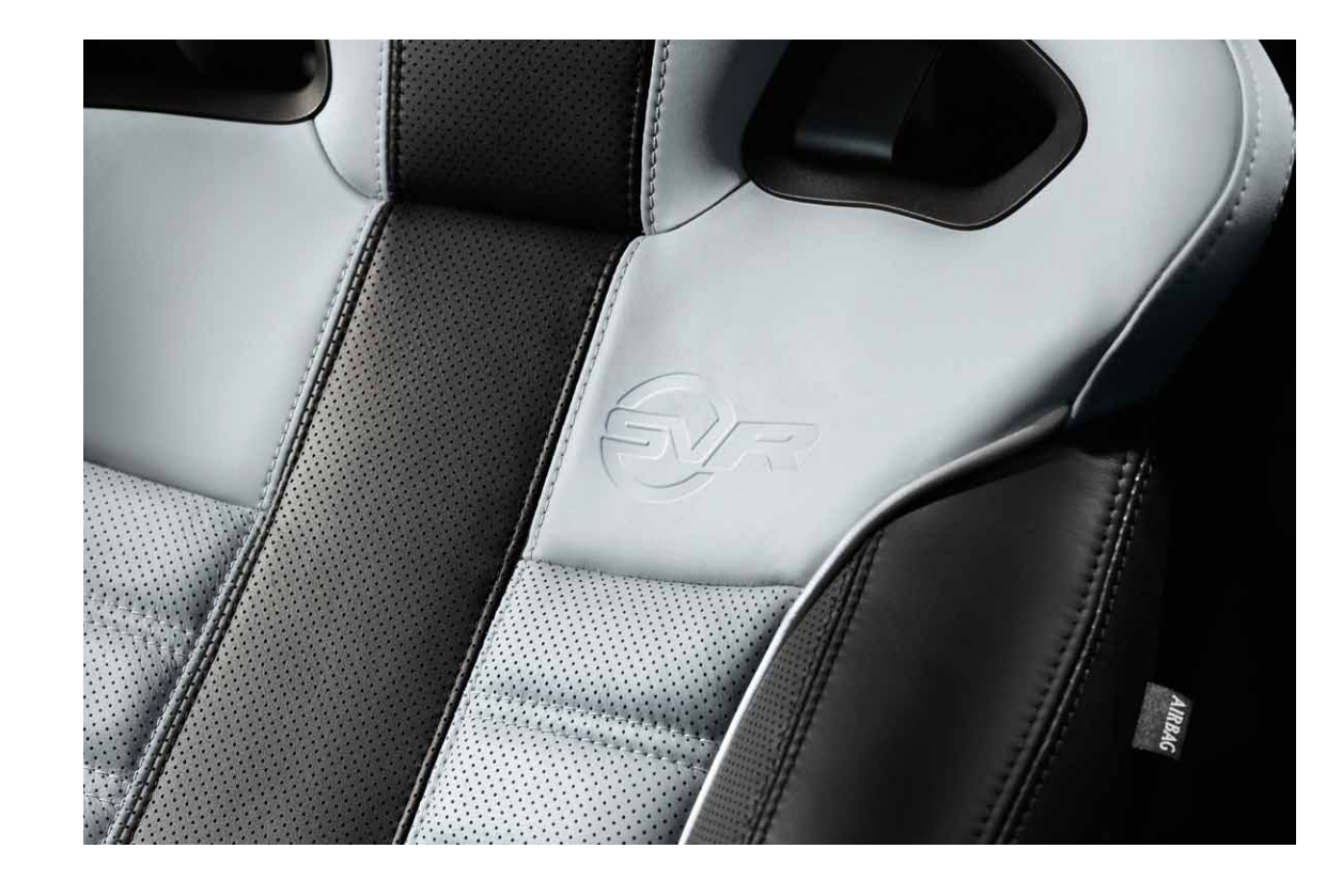
The stylish cabin has been designed around the driver. The 16-way Sports Powered seats – with memory and SVR embossing in the upper bolster – are in the softest Oxford perforated leather. A choice of four colourways enables you to personalise the space to your taste. Whilst deft touches such as optional Carbon Fibre finisher add greatly to the look. Sit behind the wheel and you'll know why Range Rover Sport SVR takes the performance SUV to its most rounded and compelling level yet.