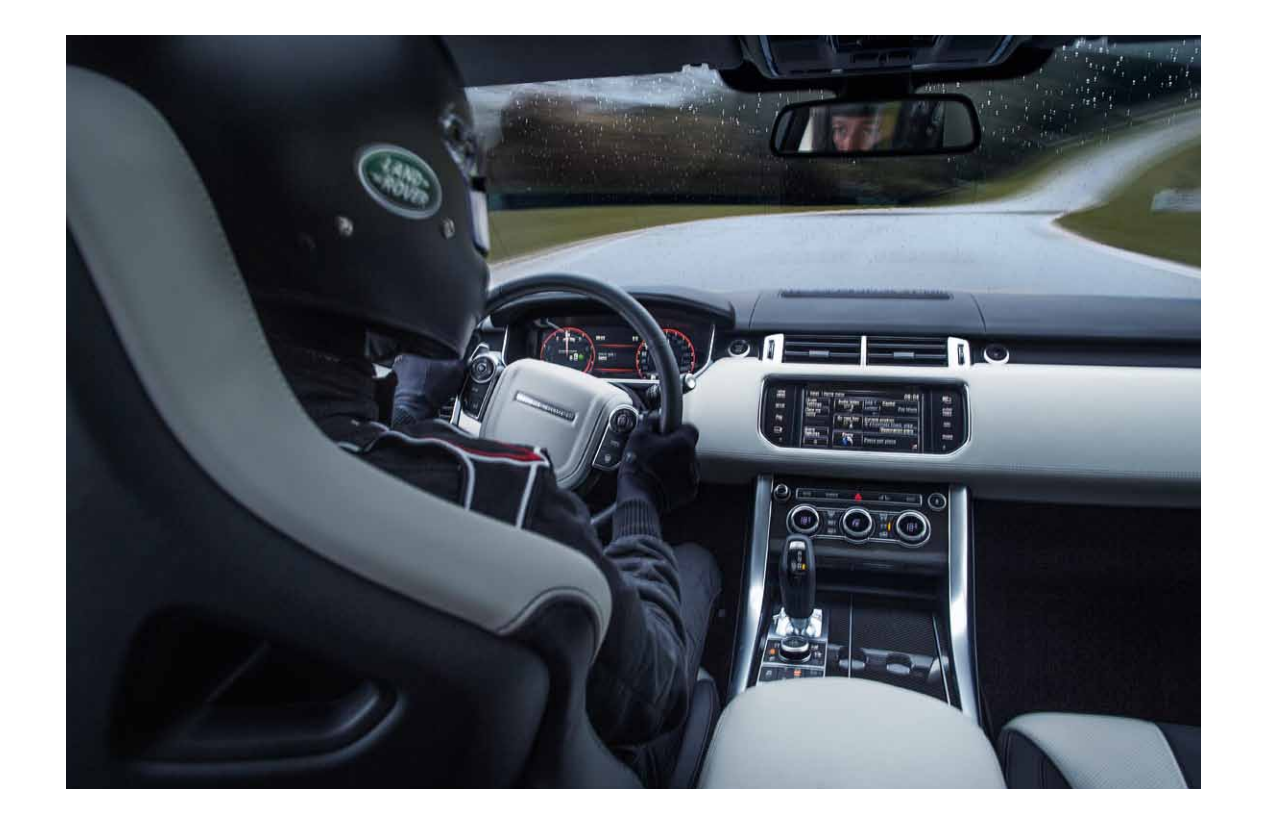
Range Rover Sport SVR goes from 0-100kph in 4.7 seconds. It has a top speed of 260kph. Its 5.0 litre Supercharged V8 Petrol engine delivers 550PS and 680Nm. This breathtaking increase in performance has been enabled by a recalibration of the engine and its management system to increase maximum available boost pressure. An enhanced eight-speed transmission with sharper, faster gearshifts has also been incorporated. This creates a more immediate connection to the vehicle, helping to make it the most powerful and quickest Land Rover ever.