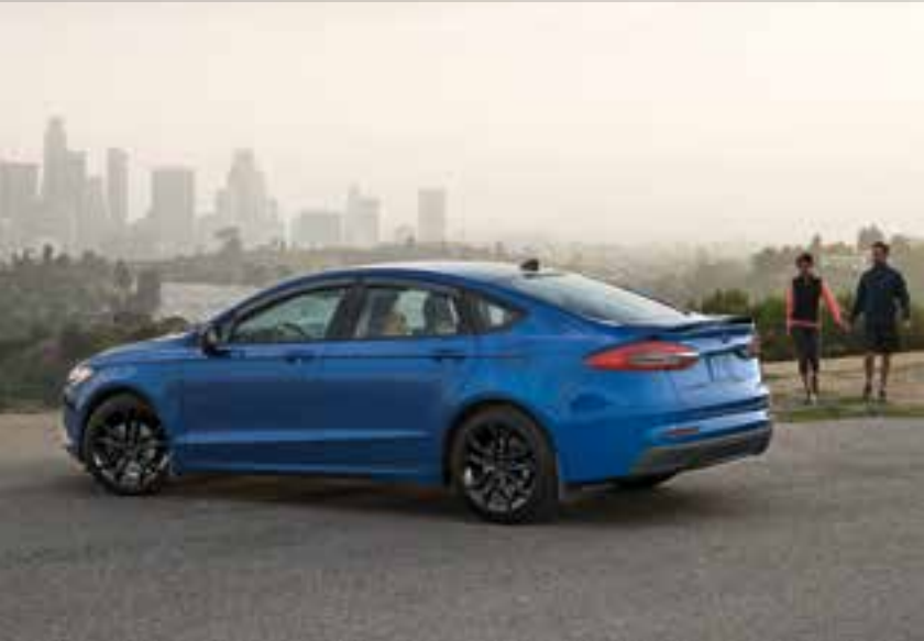
SE with SE Appearance Package in Velocity Blue accessorized with molded splash guards and smoked side window deflectors, as well as the rear decklid spoiler and 18" Ebony Black-painted aluminum wheels that are part of the SE Appearance Package