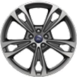
19" MACHINED-FACE ALUMINUM WITH MAGNETIC-PAINTED POCKETS Standard

LEATHER-TRIMMED SEATING SURFACES: Russet, Ebony