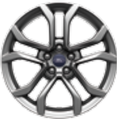
18" PREMIUM PAINTED ALUMINUM Standard

COLORS: Alto Blue Metallic Tinted Clearcoat, 2 Velocity Blue, 3 Rapid Red Metallic Tinted Clearcoat, 2 Oxford White, White Platinum Metallic Tri-coat, 2 Iconic Silver, 3 Magnetic, 3 Agate Black 3