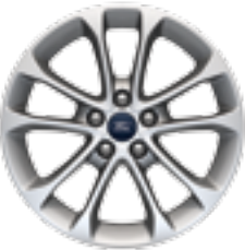
17" SPARKLE SILVER-PAINTED ALUMINUM Standard