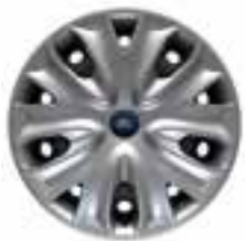
16" STEEL WITH SILVER-PAINTED COVERS Standard

CLOTH SEATING SURFACES: Medium Light Stone