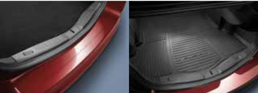
Rear bumper protector