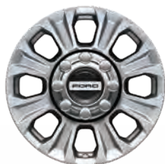
18" silver-painted cast-aluminum with bright hub cover (648) F-250/F-350 SRW (std.)