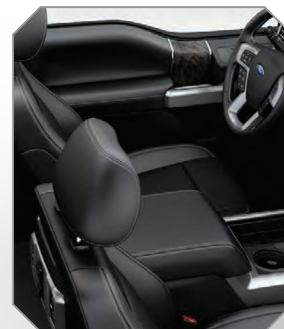
Black Standard in leather seating surfaces