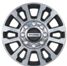
18" bright-machined cast-aluminum with Magnetic-painted pockets and bright hub cover/center ornament (64C) F-250/F-350 SRW (std.)