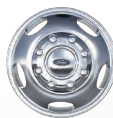
17" polished forged-aluminum with bright hub cover (64J) F-350 DRW (std.)