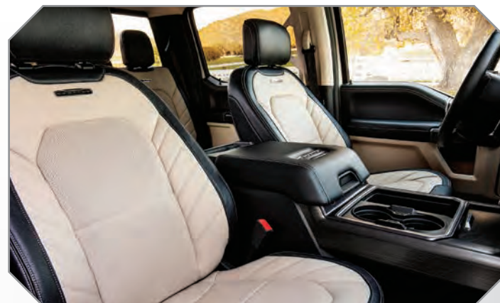
Highland Tan Two-tone Standard in full leather