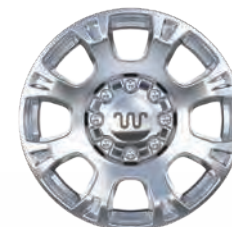
20" chrome PVD aluminum with bright hub cover/center ornament and King Ranch logo (649) F-250/F-350 SRW – reqs. Chrome Package (17C) and 4x4