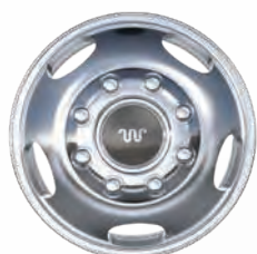
17" polished forged-aluminum with bright hub cover and King Ranch logo (64J) F-350 DRW (std.)