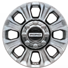
18" silver-painted cast-aluminum with bright hub cover (648) F-250/F-350 SRW – reqs. STX Appearance Package (17S)