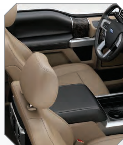
Medium Light Camel Standard in leather seating surfaces