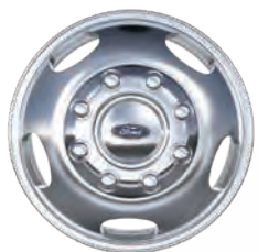
17" polished forged-aluminum with bright hub cover (64J) F-350 DRW (std.)