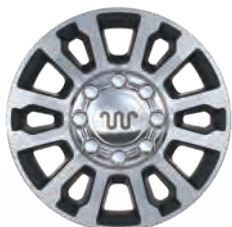
18" bright-machined cast-aluminum with Magnetic-painted pockets and bright hub cover/center ornament and King Ranch logo (64C) F-250/F-350 SRW (std.)