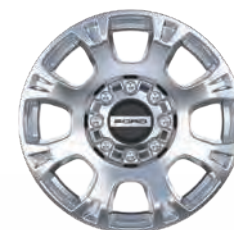
20" chrome PVD aluminum with bright hub cover/center ornament (649) F-250/F-350 SRW – reqs. Chrome Package (17C) and 4x4