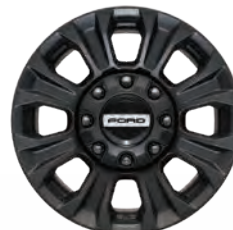
18" Low-gloss Black-painted aluminum (64E) F-250/F-350 SRW – reqs. Tremor Off-Road Package (17Y)