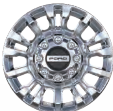
18" chrome PVD aluminum with bright hub cover/center ornament (647) F-250/F-350 SRW – reqs. Chrome Package (17C)