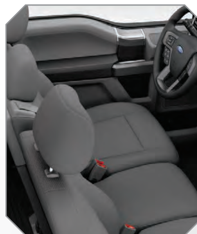
Medium Earth Gray Standard in cloth