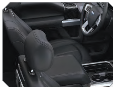
Black Standard in leather seating surfaces