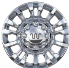
18" chrome PVD aluminum with bright hub cover/center ornament and King Ranch logo (647) F-250/F-350 SRW – reqs. Chrome Package (17C)