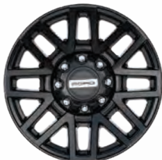
20" High-gloss Black premium-painted aluminum (646) F-250/F-350 SRW – reqs. Lariat Sport Appearance Package (17L)