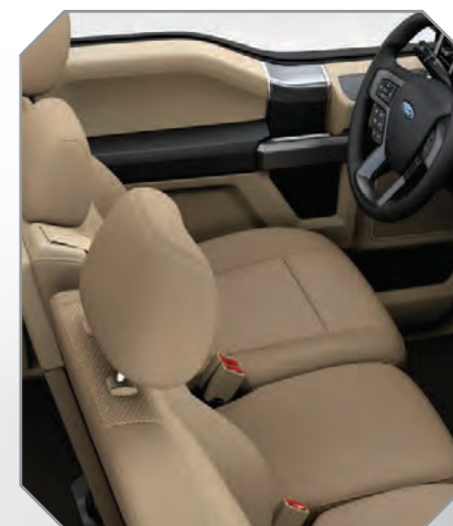
Medium Light Camel Standard in cloth

NOTE: See latest Dealer Ordering Guide for the most up-to-date feature availability.