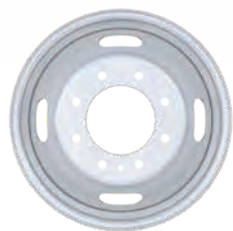
17" silver-painted steel with painted hub cover (64K) F-350 DRW (std.)