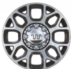
20" bright-machined cast-aluminum with Caribou-painted pockets and bright hub cover/center ornament and King Ranch logo (643) F-250/F-350 SRW – reqs. 4x4