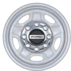
17"/18" silver-painted steel with chrome hub cover (64A/64F) F-250/F-350 SRW – reqs. XL Value Package (96V)