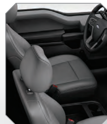
Medium Earth Gray Standard in heavy-duty vinyl; available in cloth (Opt. 40/mini console/40 shown)