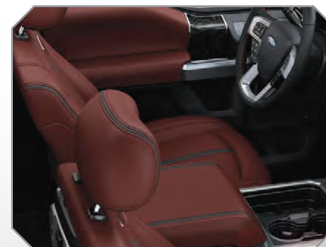
Black/Dark Marsala Standard in leather seating surfaces