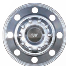
19.5" polished forged-aluminum with bright hub cover and King Ranch logo (64D) F-450 DRW (std.)