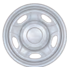
17"/18" silver-painted steel with painted hub cover (64A/64F) F-250/F-350 SRW (64A std./64F opt.)