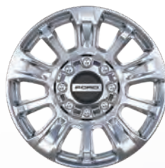
20" polished aluminum with bright hub cover/center ornament (64L) F-250/F-350 SRW (std.)