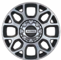
20" bright-machined cast-aluminum with Magnetic-painted pockets and bright hub cover/center ornament (642) F-250/F-350 SRW – reqs. 4x4