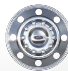
19.5" polished forged-aluminum with bright hub cover (64D) F-450 DRW (std.)

NOTE: See latest Dealer Ordering Guide for the most up-to-date feature availability.