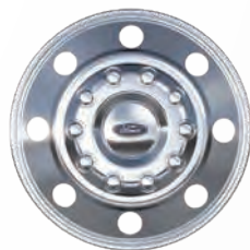
19.5" polished forged-aluminum with bright hub cover (64D) F-450 DRW (std.)