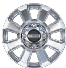
20" polished aluminum with bright hub cover/center ornament (64U) F-250/F-350 SRW (std.)