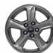
16" Premium Dark Stainless-Painted Aluminum