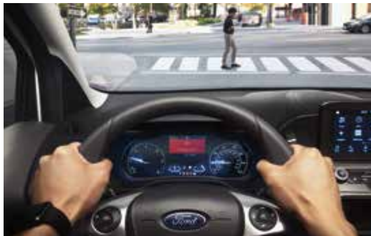
PRE-COLLISION ASSIST with Automatic Emergency Braking and Pedestrian Detection