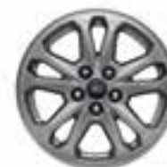
16" Sparkle Silver-Painted Aluminum