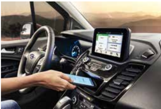
NEW WIRELESS CHARGING PAD is the only one available in the class

The new Transit Connect offers you innovative conveniences like a class-exclusive new wireless charging pad 1 that helps keep your compatible device powered up without the hassle of a cord. 2 Fully integrated with the redesigned instrument panel, it's located between the large new vents and below the vibrant SYNC ® 3 touchscreen 1 that seems to rise up from the center stack. Standard tilt and telescoping adjustability of the steering column lets you position the steering wheel right where you like it. When it's chilly outside, heated sideview mirrors 1 and a Quickclear ™ electric windshield defroster 1 help you get on your way quickly. Class-exclusive new Pre-Collision Assist including Pedestrian Detection 3 can help reduce the severity of, and, in some cases, eliminate a frontal collision with a vehicle traveling in the same direction, or a pedestrian. This advanced technology is among the many new driver-assist features you'll find on the 2019 Transit Connect.