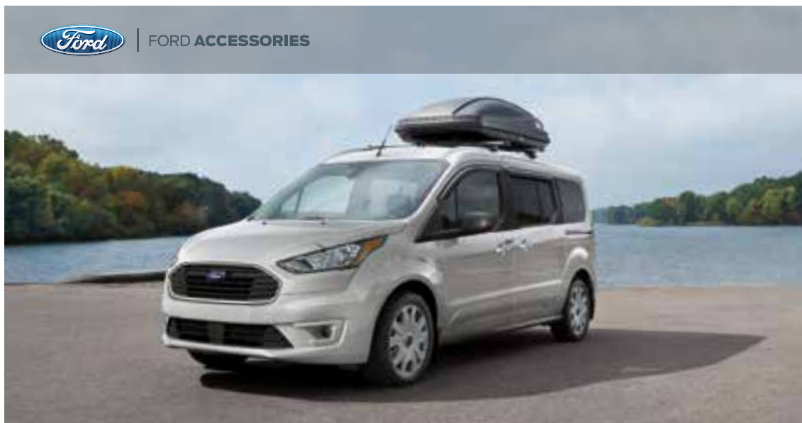
Passenger Wagon XLT LWB in Silver accessorized with keyless entry keypad, side window deflectors, 1 molded splash guards, and roof crossbars and cargo box 1,2