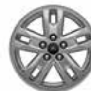
16" Premium Luster Nickel-Painted Aluminum