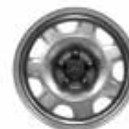
16" Shadow Silver-Painted Styled Steel