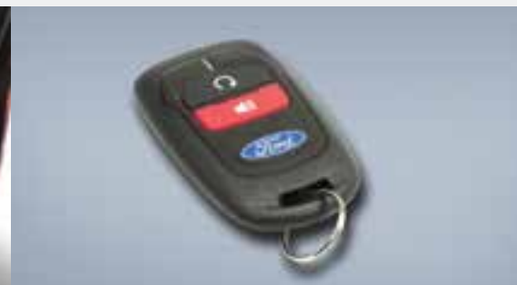
Remote start systems

Shop the complete collection at accessories.ford.com