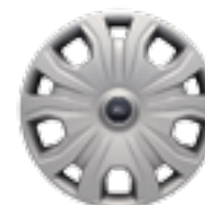
16" Steel with Full Sparkle Silver-Painted Covers