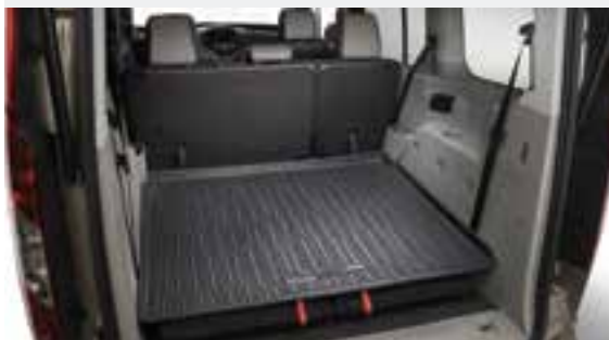
Cargo area protector