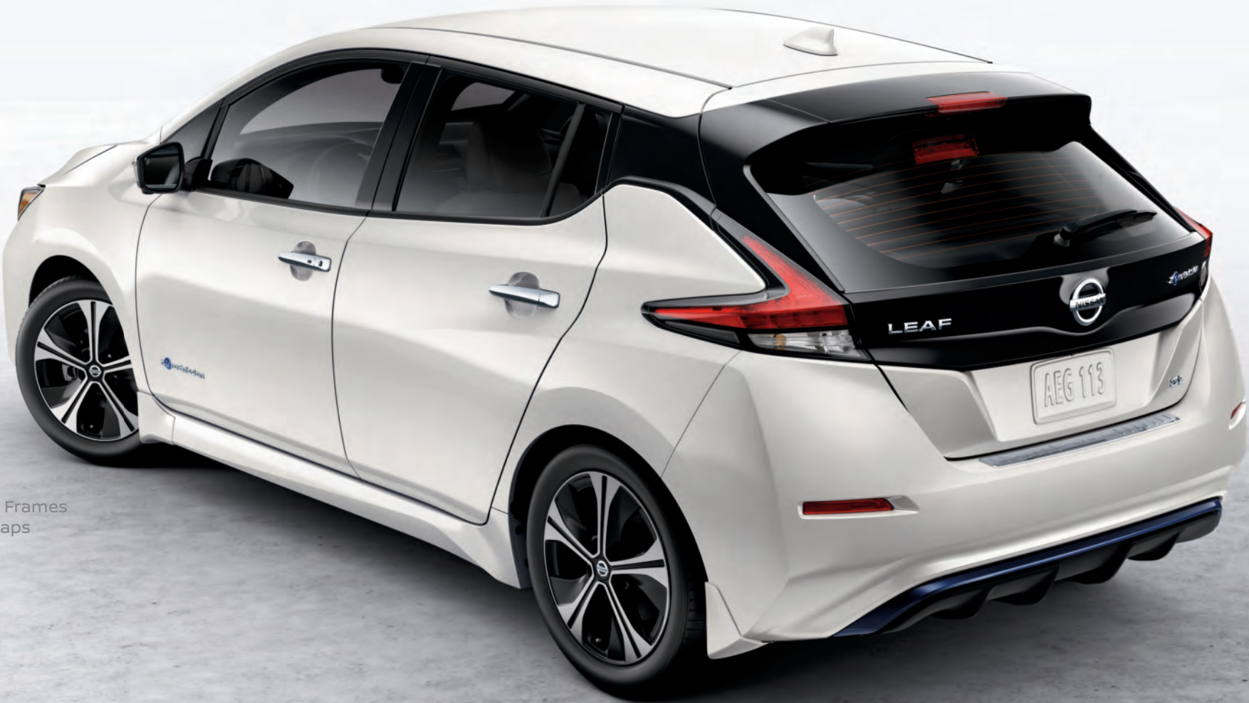
Nissan LEAF® SL shown in Pearl White with Chrome Rear Bumper Protector and Splash Guards.

For more information, and to shop online for Genuine Nissan Accessories, go to bit.ly/18leaf-estore