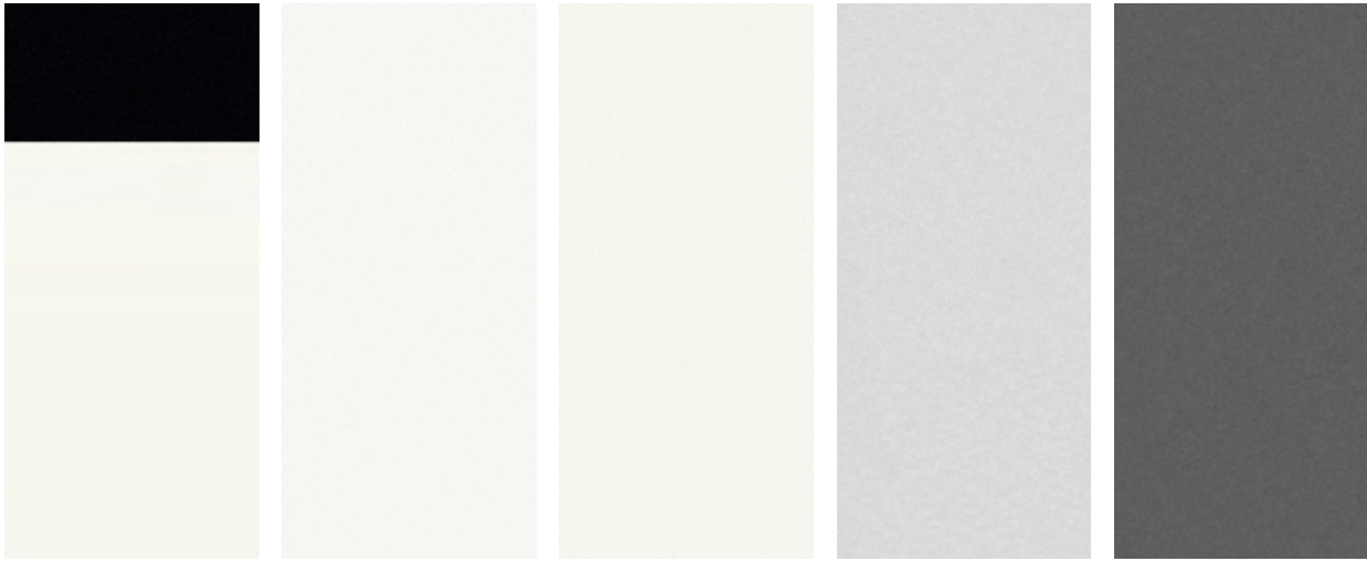
Two-tone Pearl White/ Super Black 13 XBJ Glacier White QAK Pearl White 13 QAB Brilliant Silver K23 Gun Metallic KAD