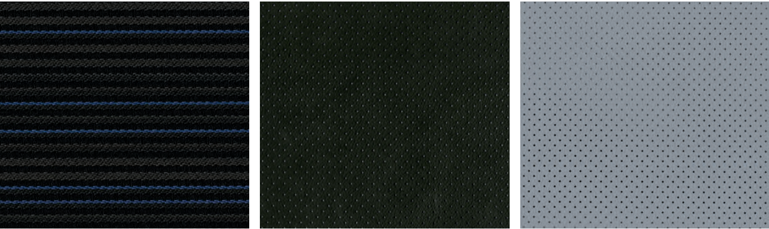
Black Cloth S | SV Black Leather SL Light Gray Leather SL