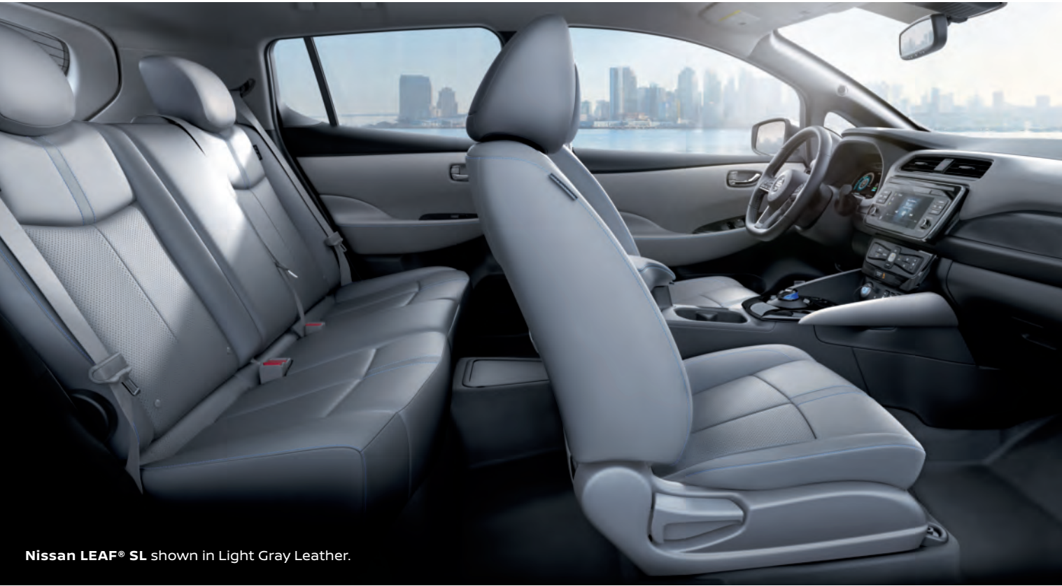
Nissan LEAF® SL shown in Light Gray Leather.