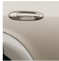
Desert Sand Mica 1 with Oak interior SR5 with Warm Silver trim