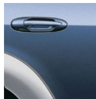
Blue Marlin Pearl 1 with Charcoal or Oak interior SR5 with Silver Sky trim