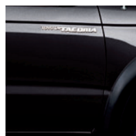
Black Sand Pear with Charcoal or Oak interior