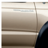
Mystic Gold Metallic 1,2,3 with Charcoal or Oak interior