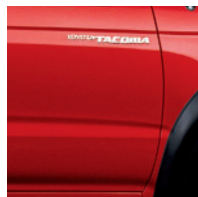
Radiant Red 4 with Charcoal or Oak interior