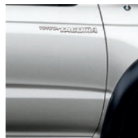
Lunar Mist Metallic 6 with Charcoal interior