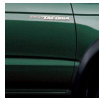
Imperial Jade Mica 4,5,6 with Charcoal or Oak interior