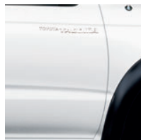
Super White 1,2,3 with Charcoal or Oak interior