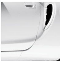
Super White with Black fabric or Tan leather interior