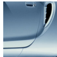
Paradise Blue Metallic with Black fabric or Tan leather interior