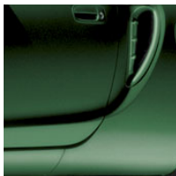
Electric Green Mica with Black fabric or Tan leather interior