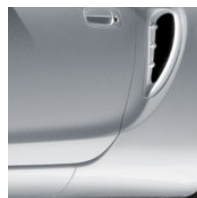
Silver Streak Mica with Gray or Black fabric or Black leather interior