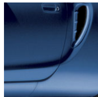
Spectra Blue Mica with Black fabric or Black leather interior