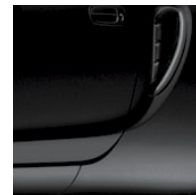
Black with Gray or Black fabric or Black leather interior