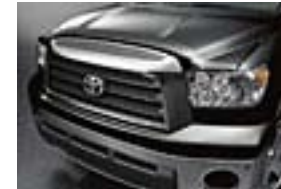
Hood Protector $165.00 Installed MSRP*