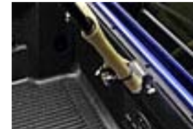
Locking Bike Fork Attachment $95.00 Installed MSRP*