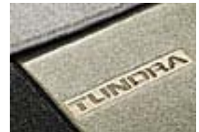
Carpet Floor Mats w/Door Sill Protector Regular Cab $111.00 Double Cab $178.00 CrewMax $181.00 Installed MSRP*