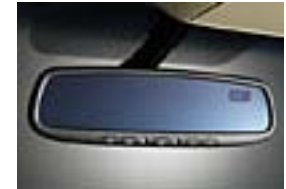
Auto Dimming Mirror $280.00 Installed MSRP*