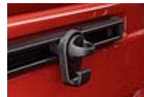
Mini Tie Down w/Hook (set of two) $45.00 Installed MSRP*

© 2007 Toyota Motor Sales, U.S.A., Inc. Produced 10.15.07