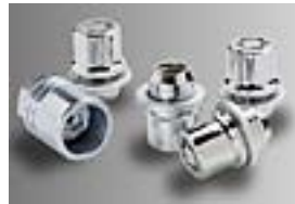
Wheel Locks $79.00 Installed MSRP*