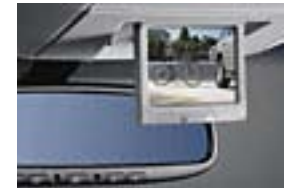
Back-Up Camera w/Monitor $695.00 Installed MSRP*