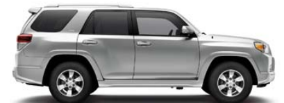
CLASSIC SILVER METALLIC Black 9 or Graphite interior