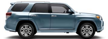
SHORELINE BLUE PEARL 10 Black 9 or Sand Beige 9 interior