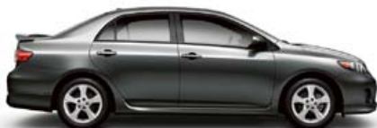
MAGNETIC GRAY METALLIC Ash, Bisque or Dark Charcoal 1 interior