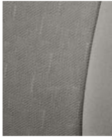
Corolla fabric in Ash