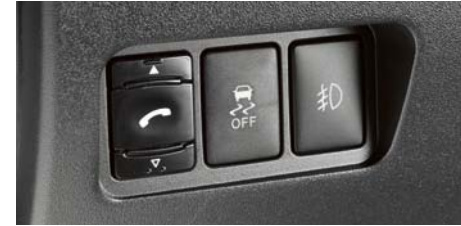
BLU Logic® Hands Free System 20