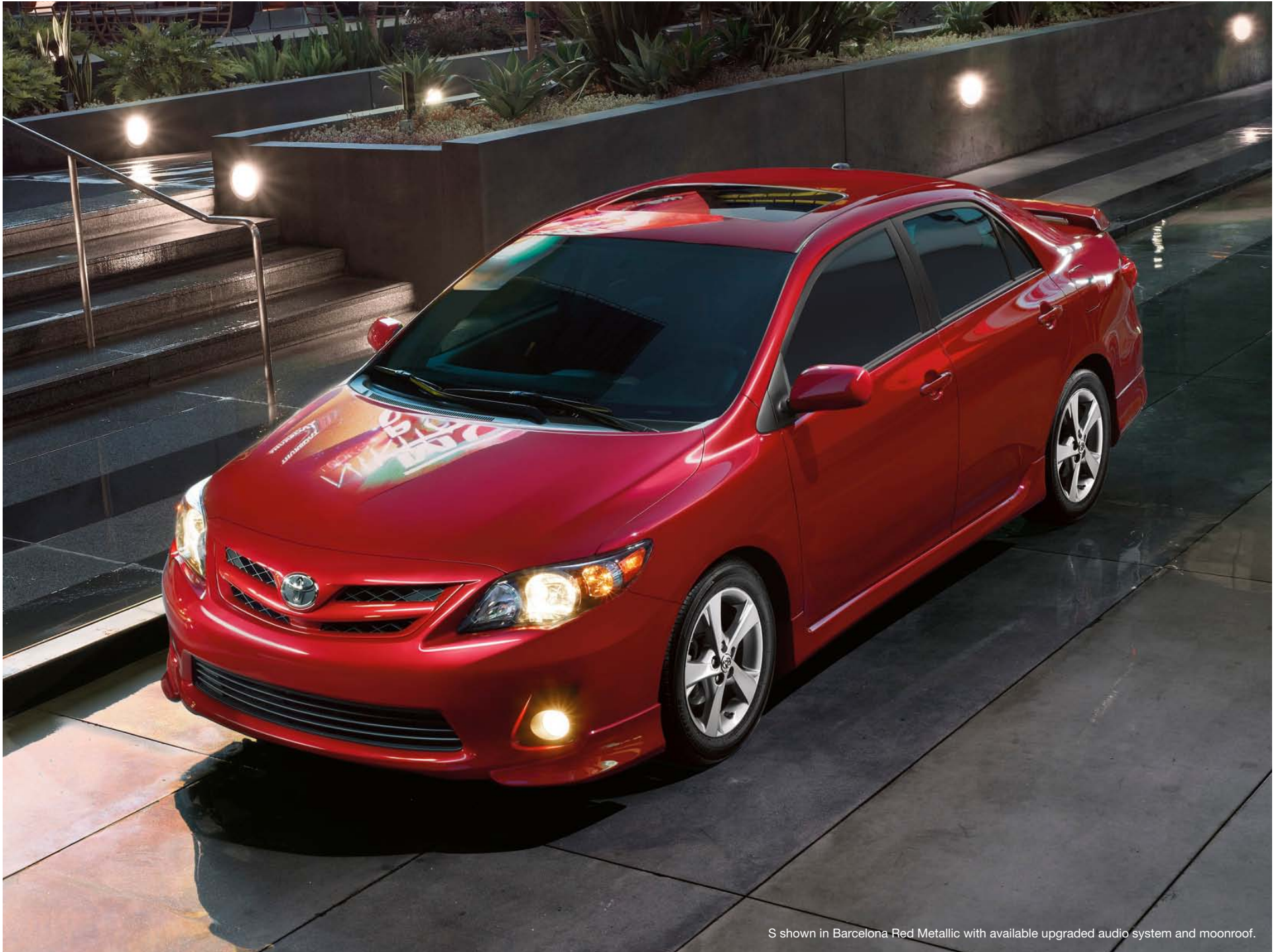
S shown in Barcelona Red Metallic with available upgraded audio system and moonroof.