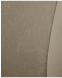
Corolla fabric in Bisque