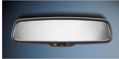
Auto-dimming rearview mirror