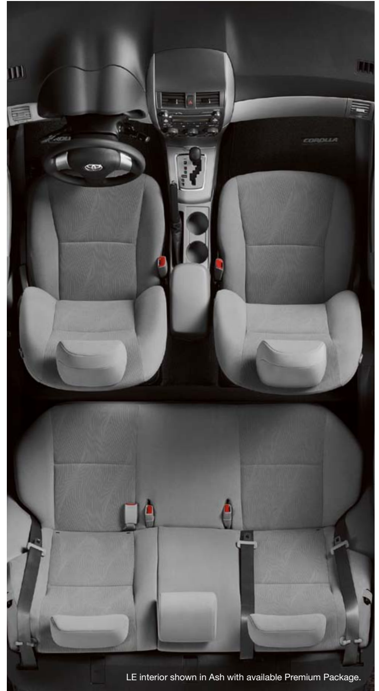
LE interior shown in Ash with available Premium Package.

Corolla may be a compact car, but you wouldn't know it to peek in the trunk. In the back, you'll be pleasantly surprised to find a full 12.3 cubic feet 2 of cargo space for road trip necessities.