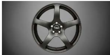
TRD 18-in. 5-spoke wheels (Silver or Black)