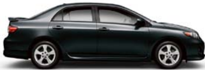
BLACK SAND PEARL Ash, Bisque or Dark Charcoal 1 interior

Corolla offers seven exterior colors to choose from — not surprising, considering Corolla’s accommodating nature. And each exterior color offers two or three interior colors to match. Decisions, decisions.