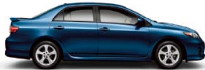
NAUTICAL BLUE METALLIC Ash, Bisque or Dark Charcoal 1 interior