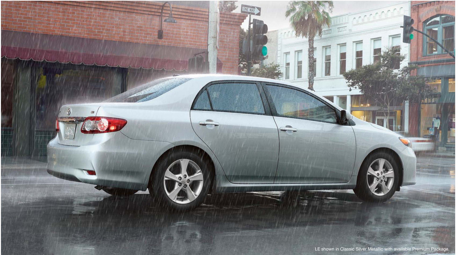
LE shown in Classic Silver Metallic with available Premium Package.

At Toyota, your safety is what drives us. That's why we've given Corolla an impressive list of active and passive safety features as standard equipment. From systems designed to help you avoid accidents to those that can help protect you should a collision occur, Corolla takes your safety seriously.