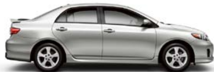
CLASSIC SILVER METALLIC Ash or Dark Charcoal 1 interior