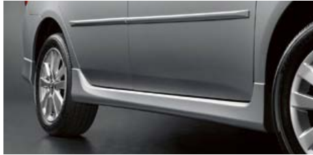
Body side moldings

Add a personal touch to your Corolla with Genuine Toyota accessories. Some accessories may not be available in all regions of the country. See your Toyota dealer for details.