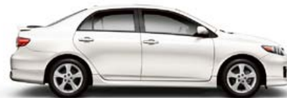
SUPER WHITE Ash, Bisque or Dark Charcoal 1 interior