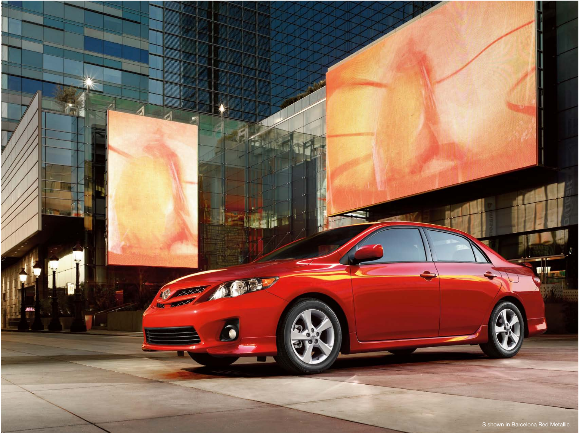
S shown in Barcelona Red Metallic.