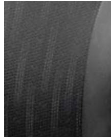
S fabric in Dark Charcoal