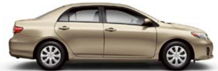
SANDY BEACH METALLIC 2 Bisque interior