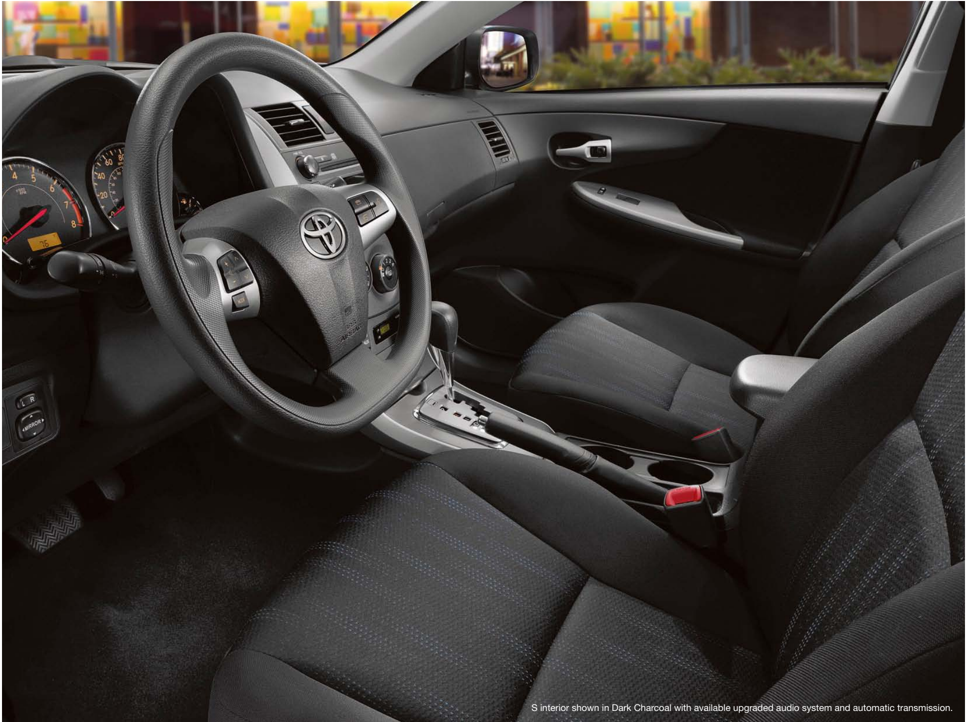
S interior shown in Dark Charcoal with available upgraded audio system and automatic transmission.