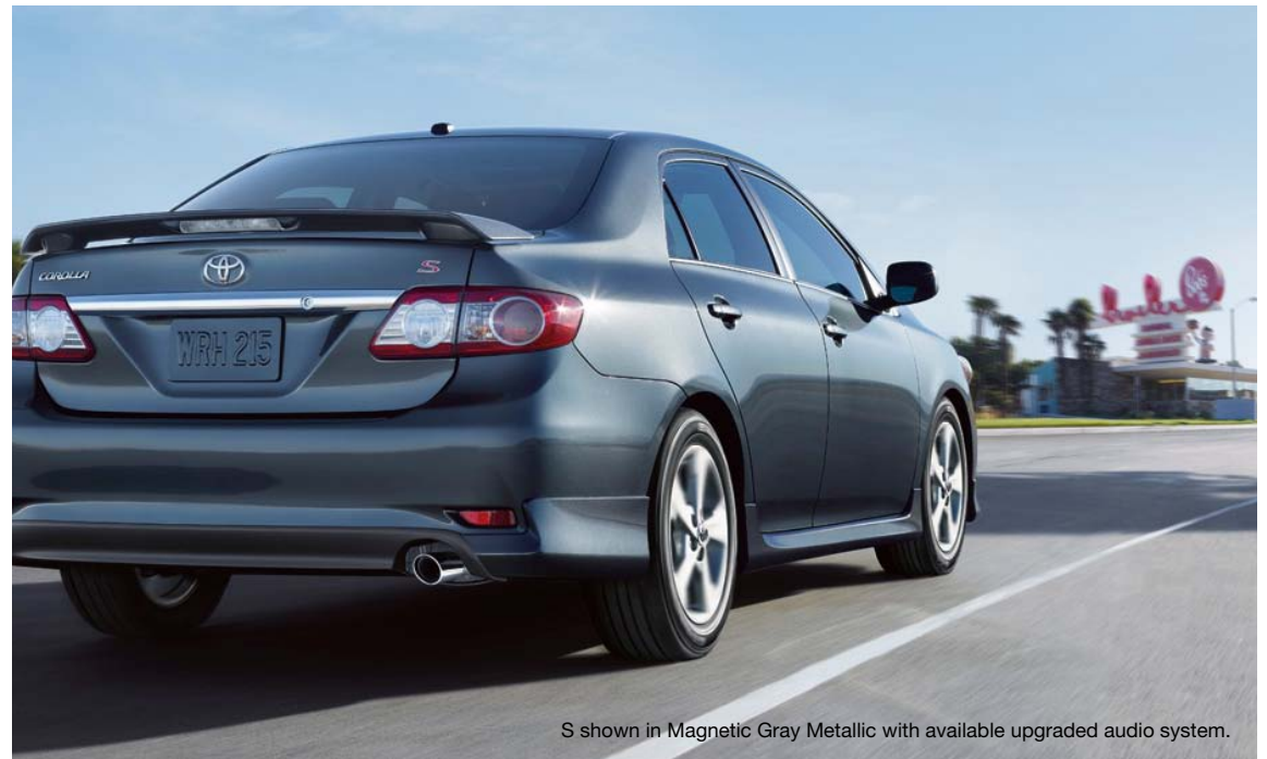
S shown in Magnetic Gray Metallic with available upgraded audio system.

Corolla's impeccable road manners begin with its rigid chassis. Built to resist body flex, it provides a reliable platform so that the suspension can best do its job. The front suspension, mounted to an additional sub-frame to reduce noise and vibration , is tuned for precision handling. In back, the rear suspension employs a torsion-type design that further smooths the ride quality .