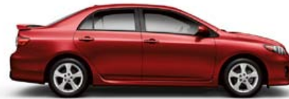
BARCELONA RED METALLIC Ash, Bisque or Dark Charcoal 1 interior