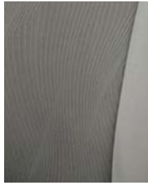
LE fabric in Ash