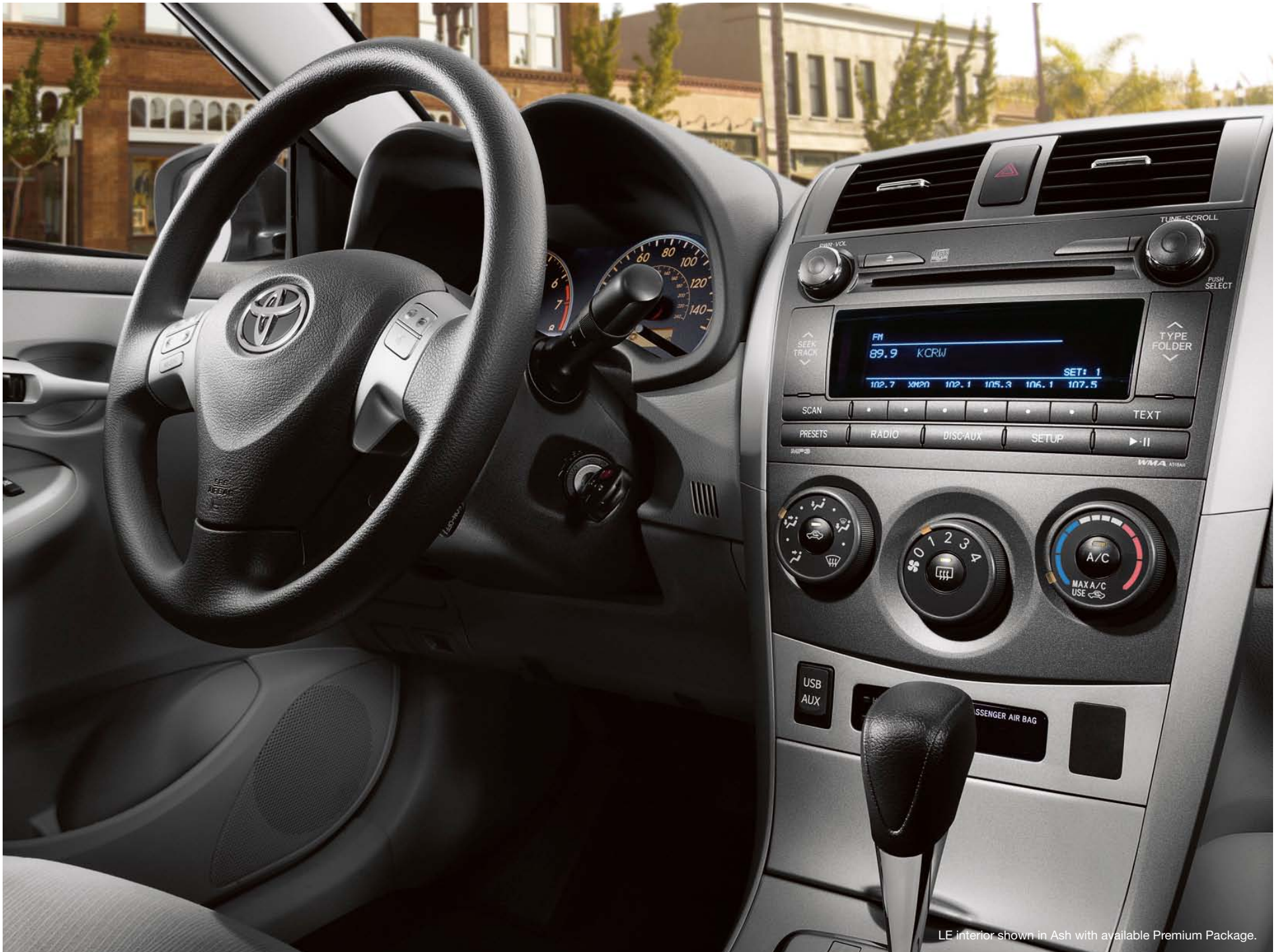
LE interior shown in Ash with available Premium Package.