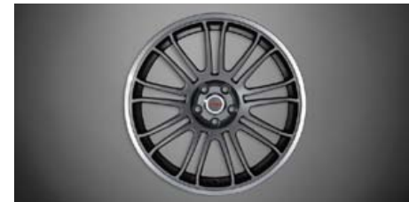
TRD 18-in. multi-spoke alloy wheels