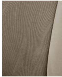
LE fabric in Bisque