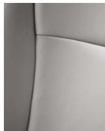
Hybrid available/SE standard leather in Ash