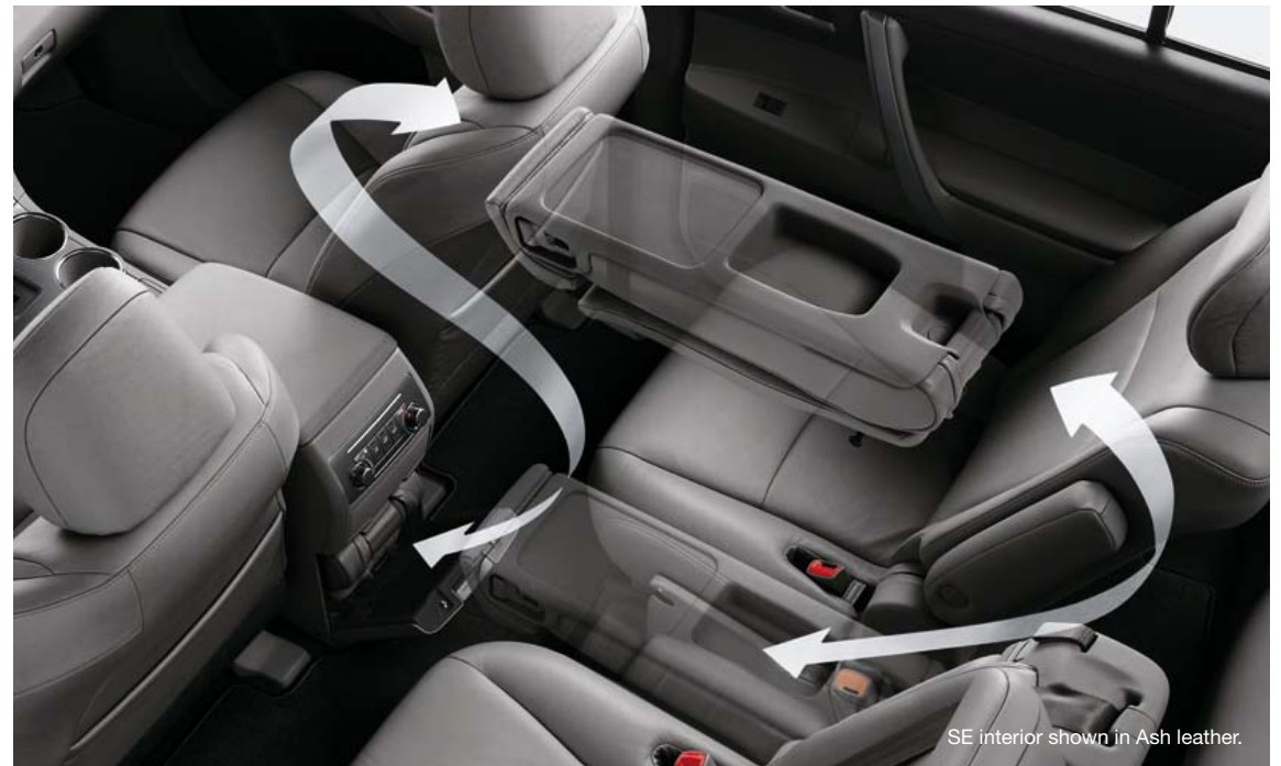
SE interior shown in Ash leather.

This innovative feature adds to Highlander's incredible versatility . Beneath the center console, there's a Center Stow™ seat that you can pull out, lock in place between the second-row captain's chairs and fold open. Remove it, and you've made a walk-through to the third row. Or replace it with the Center Stow™ console to hold drinks and smaller items.