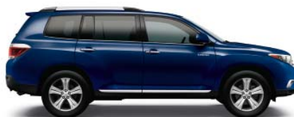
NAUTICAL BLUE METALLIC 10 Black, 9 Ash or Sand Beige interior