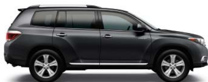
BLACK Black, 9 Ash or Sand Beige interior

Highlander is available in ten exterior colors and seven interior colors. Many choices, certainly. But Highlander has been painstakingly engineered to offer quality and versatility, so you really can't go wrong with any of them.