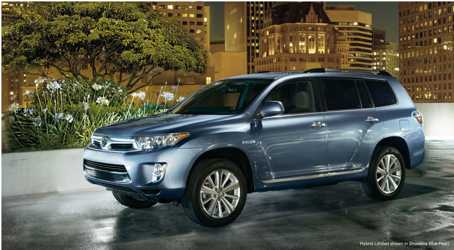
Hybrid Limited shown in Shoreline Blue Pearl.

Starting From initial light or moderate acceleration to low speeds and under certain conditions, Highlander Hybrid is powered solely by the high-torque electric motors. 1