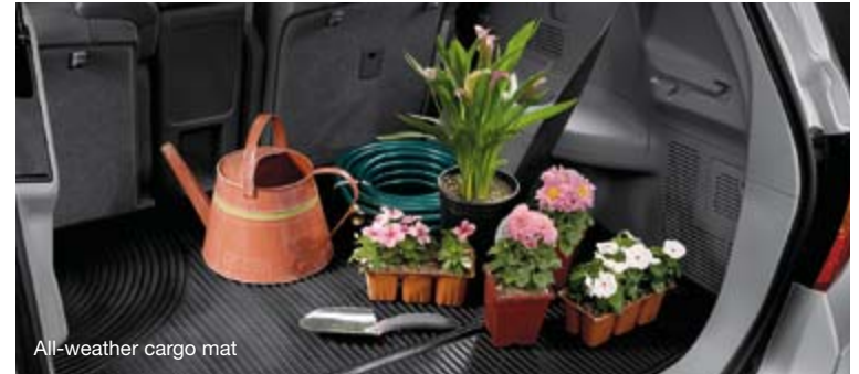
All-weather cargo mat