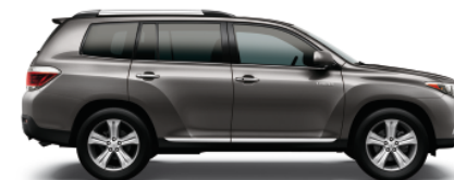
MAGNETIC GRAY METALLIC 10 Black, 9 or Ash interior