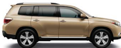
SANDY BEACH METALLIC 10 Black, 9 or Sand Beige interior