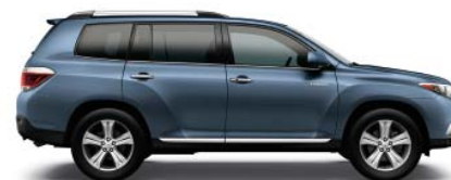
SHORELINE BLUE PEARL Black, 9 Ash or Sand Beige interior