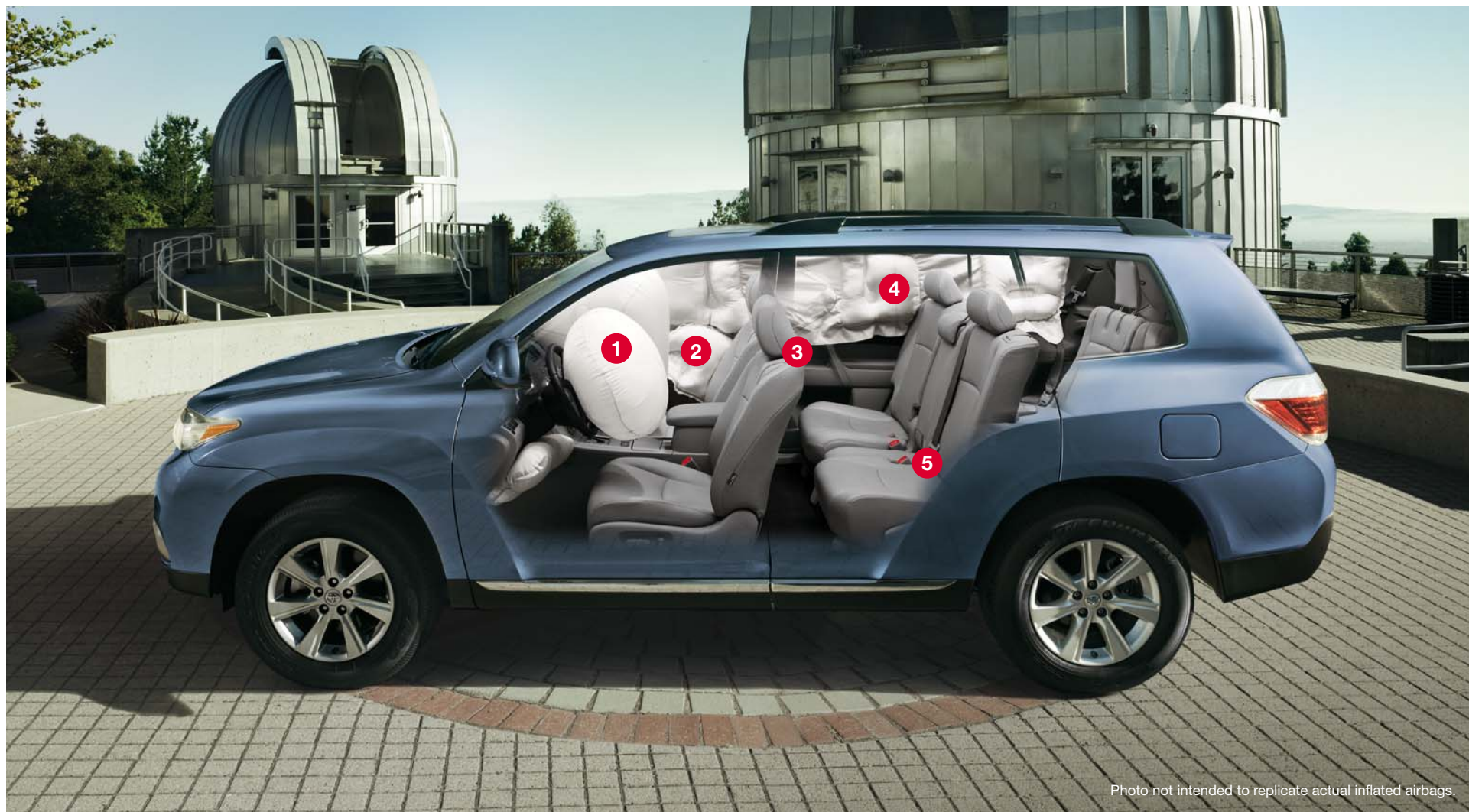
Photo not intended to replicate actual inflated airbags.

LATCH (Lower Anchors and Tethers for Children) includes lower anchors and tethers on all outboard second-row seats.