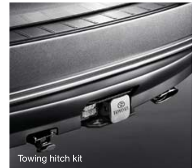
Towing hitch kit