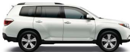
BLIZZARD PEARL 12 Black, 9 Ash or Sand Beige interior