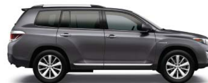
PREDAWN GRAY MICA 11 Black, 9 Ash or Sand Beige interior