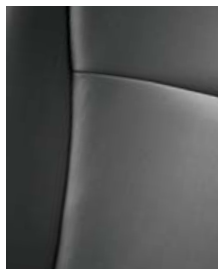
Hybrid available/SE standard leather in Black