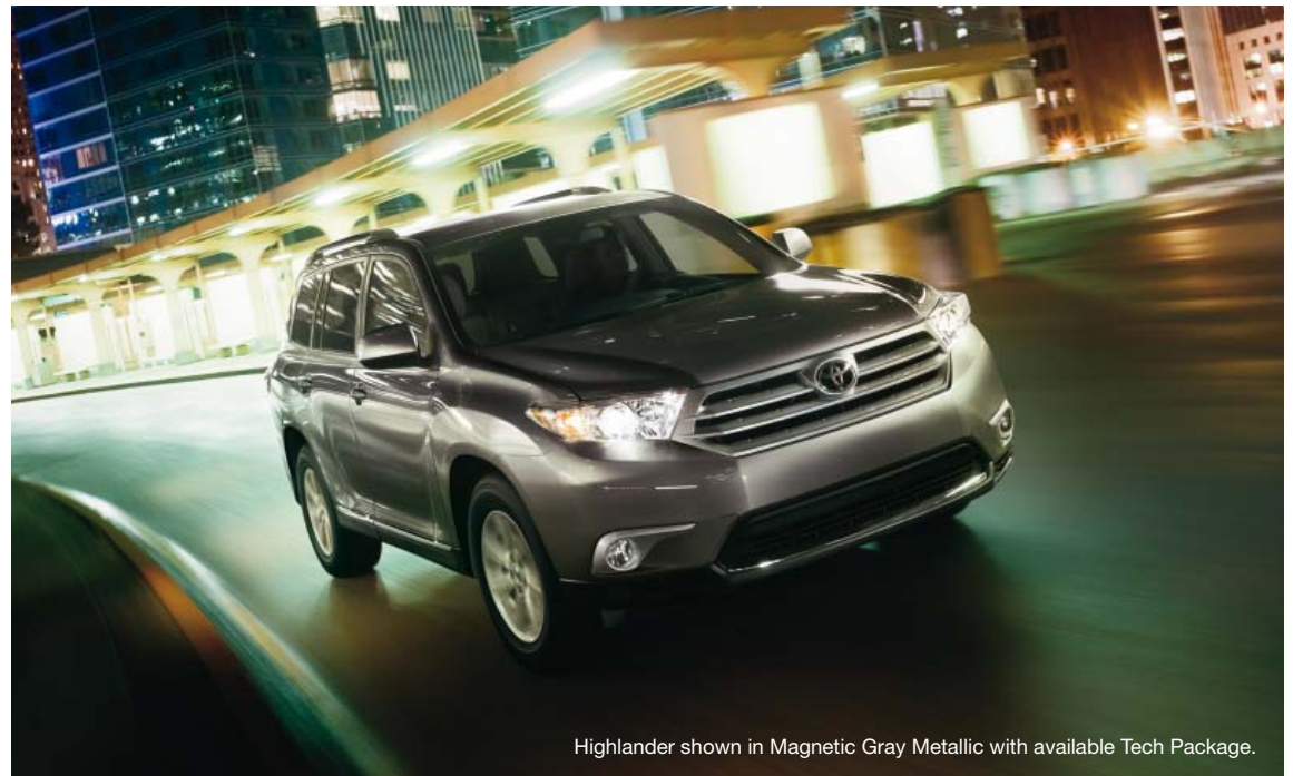
Highlander shown in Magnetic Gray Metallic with available Tech Package.

An available 24-valve V6 engine uses a Double Overhead Cam (DOHC) and Dual VVT-i to deliver 270 hp and 248 lb.-ft. of torque with an EPA-estimated 24 highway mpg rating 2 . Yet Highlander still manages to achieve an Ultra Low Emission Vehicle II (ULEV-II) rating.