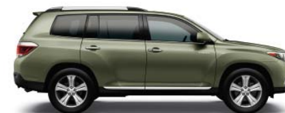
CYPRESS PEARL 10 Black, 9 Ash or Sand Beige interior