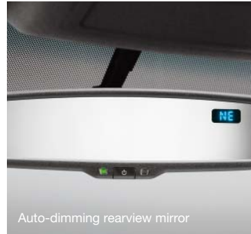
Auto-dimming rearview mirror