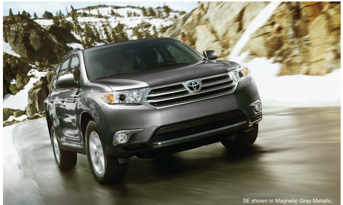
SE shown in Magnetic Gray Metallic.

The Anti-lock Brake System (ABS) that's standard on Highlander is an important element of its active safety capability. Brake Assist (BA) is designed to detect whether the driver is attempting a panic stop, and if so, applies increased braking power. Electronic Brake-force Distribution (EBD) works with ABS and BA to optimize the distribution and amount of brake force between the front and rear wheels, based on driving conditions and vehicle load. When braking during cornering, EBD also distributes brake force between the left and right wheels to help maintain vehicle control.