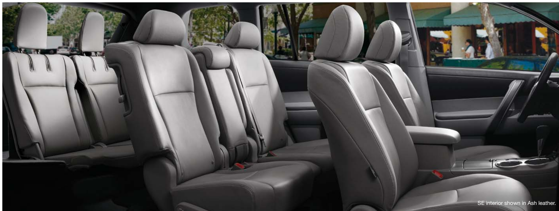
SE interior shown in Ash leather.