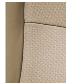
Limited and Hybrid Limited perforated leather in Sand Beige