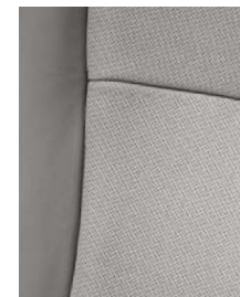
Limited and Hybrid Limited perforated leather in Ash