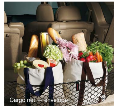
Cargo net – envelope