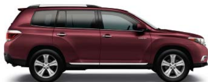
SIZZLING CRIMSON MICA Black, 9 Ash or Sand Beige interior