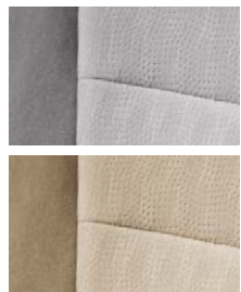
Highlander fabric in Ash or Sand Beige