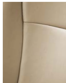
Hybrid available/SE standard leather in Sand Beige