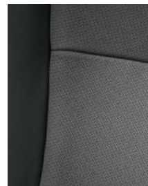
Limited and Hybrid Limited perforated leather in Black