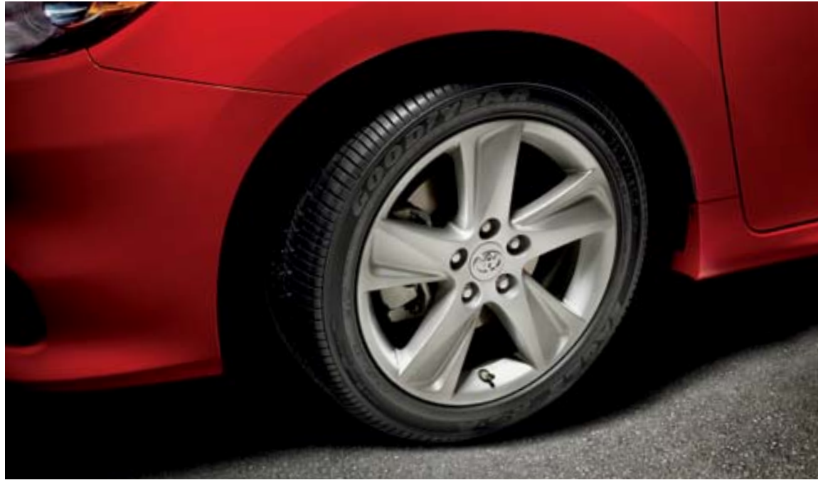
1. Standard on S AWD models only. 2. Standard on S models only. 3. See footnote 3 in Disclaimers section. 4. Available on S models only.