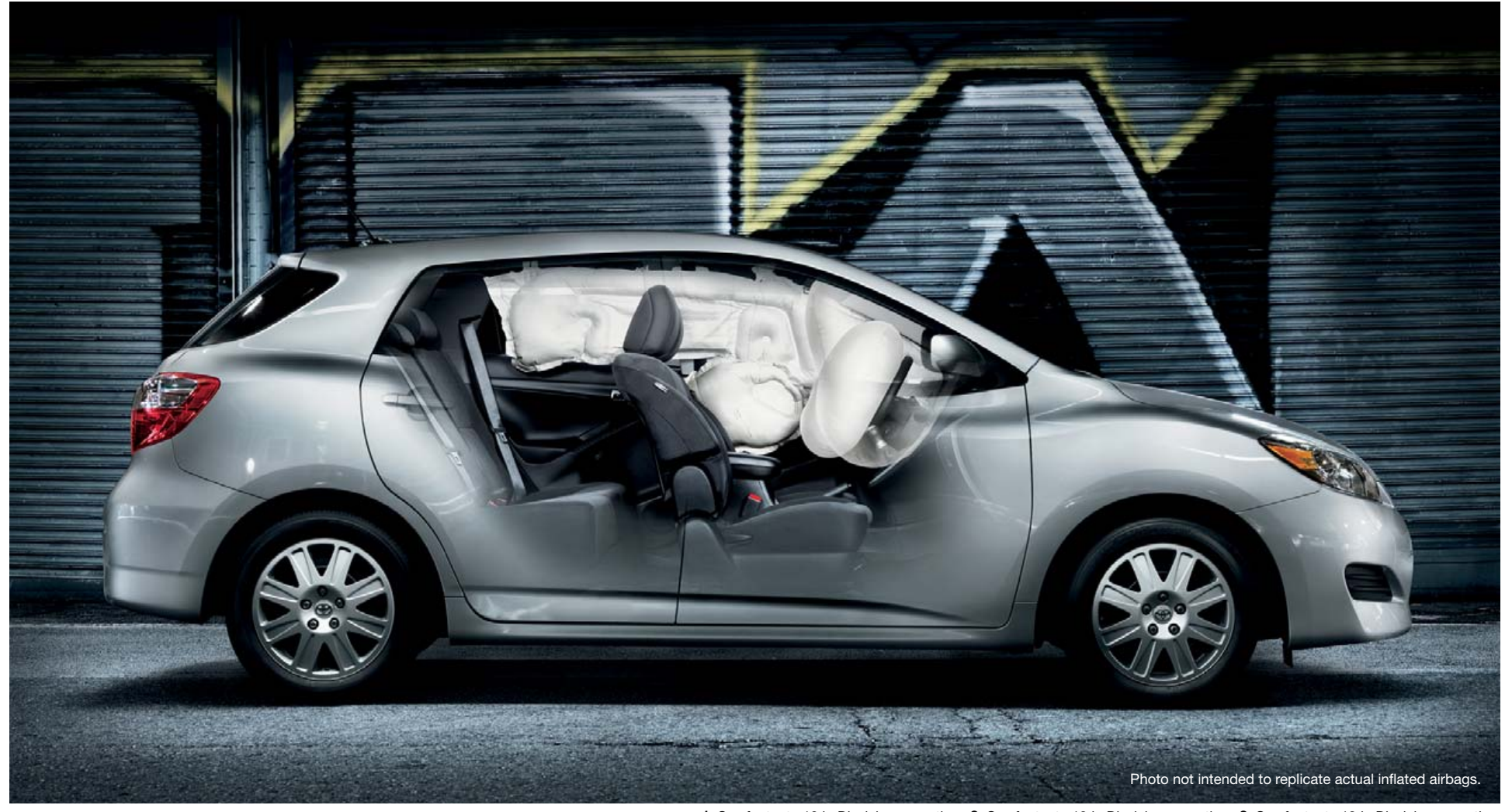
1. See footnote 10 in Disclaimers section. 2. See footnote 12 in Disclaimers section. 3. See footnote 13 in Disclaimers section.

Absolutely. Matrix offers some of the most advanced safety equipment in the industry. It starts with the Star Safety System,™ standard on all Matrix models, and its many "active" safety features, including Enhanced Vehicle Stability Control (VSC)¹ and Traction Control (TRAC). Add to that a host of standard "passive" safety features, such as six airbags,² active front headrests,³ and front and rear crumple zones, and Matrix offers comprehensive protection against the unexpected.