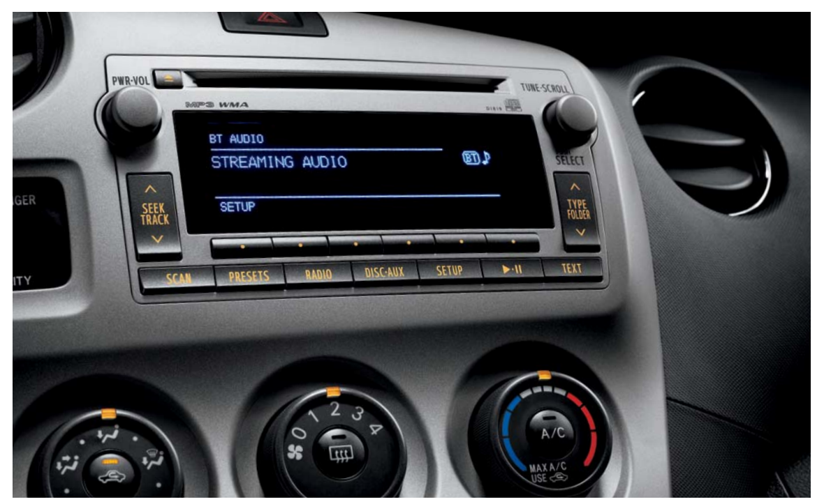
1. See footnote 9 in Disclaimers section. 2. See footnote 6 in Disclaimers section. 3. See footnote 7 in Disclaimers section.

The available audio system can be controlled by its head unit interface or the steering wheel-mounted controls, and offers a USB <sup>3</sup> port , so you can put music on a flash drive. The system comes with available XM<sup>®</sup> Radio<sup>2</sup> and has presets that can be mixed and matched. Use the standard 12V outlet as a charging station for your player, cell phone or games.