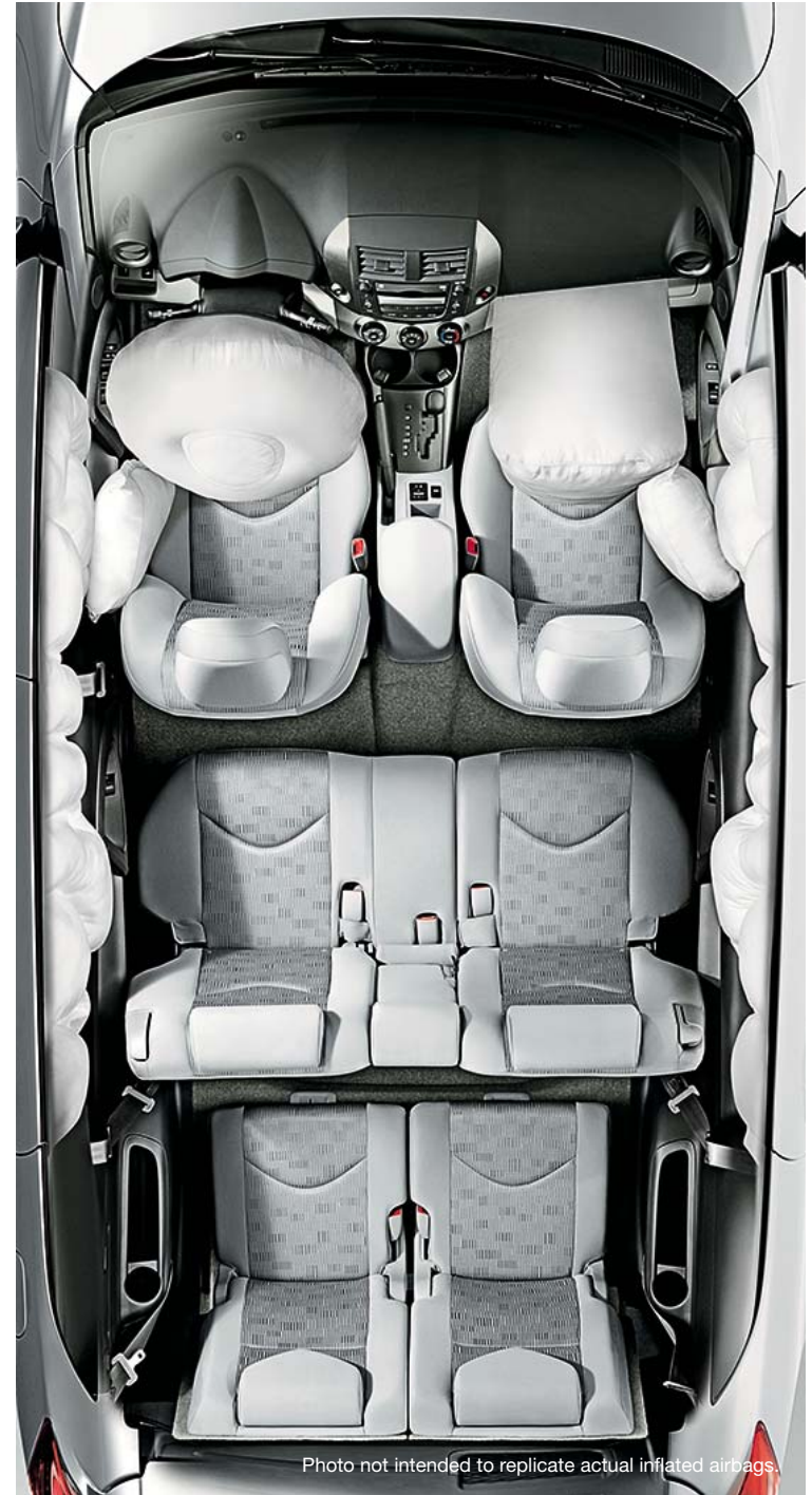
Photo not intended to replicate actual inflated airbags.

To help drivers when braking, RAV4 comes standard with EBD and BA . These systems sense braking situations and react quickly to modulate brake pressure to optimize stopping power.