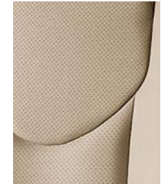
Limited leather in Sand Beige