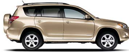
SANDY BEACH METALLIC 4 Sand Beige interior