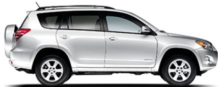
BLIZZARD PEARL 2,4,5 Ash or Sand Beige interior