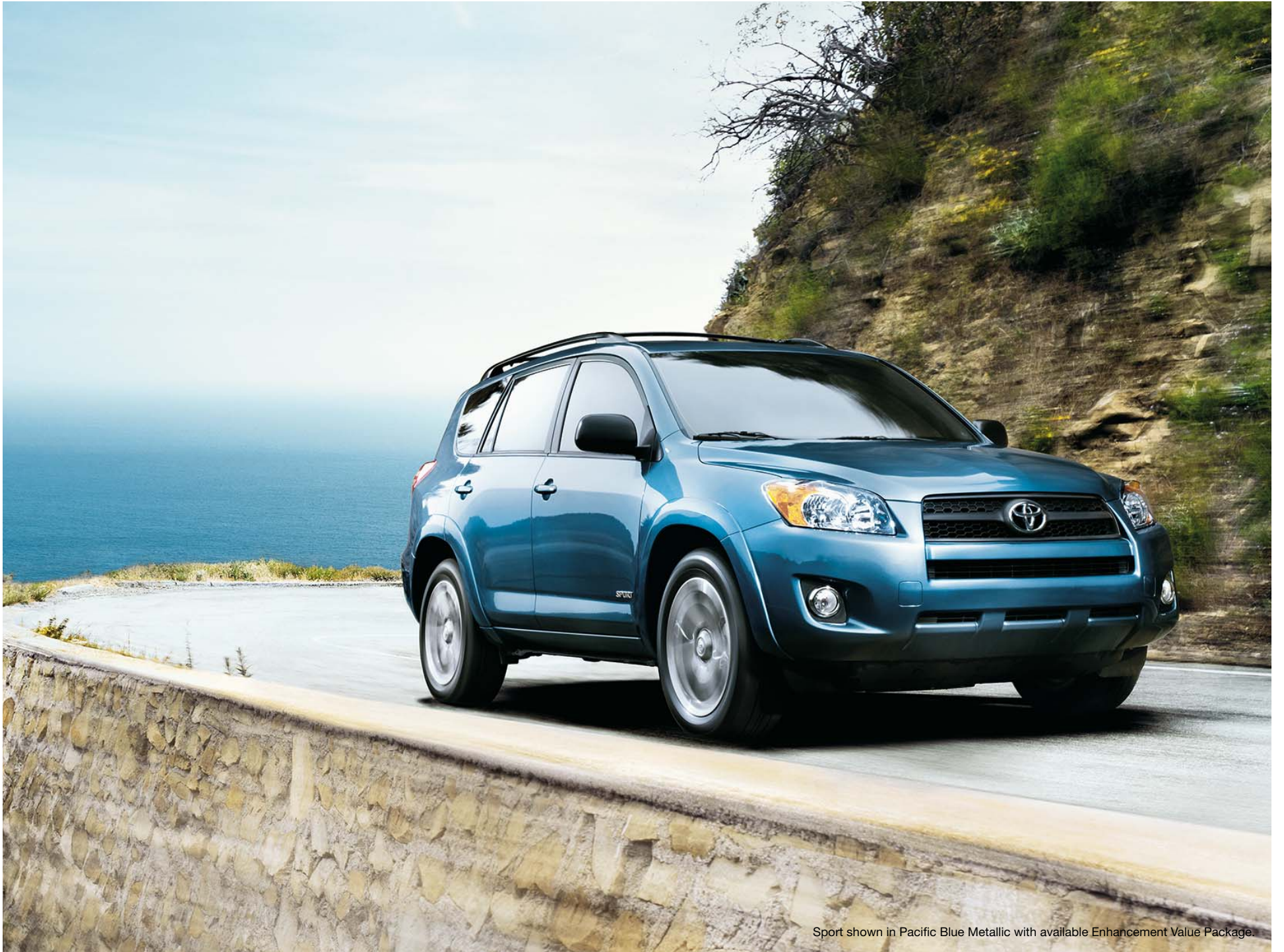
Sport shown in Pacific Blue Metallic with available Enhancement Value Package.