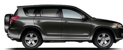
MAGNETIC GRAY METALLIC 1,2 Dark Charcoal 1,2 interior