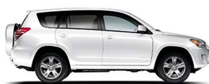
SUPER WHITE 1,3 Ash, Sand Beige or Dark Charcoal 1,2 interior