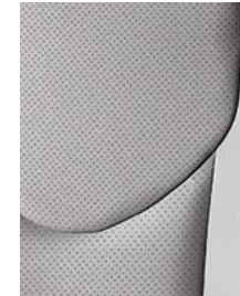
Limited leather in Ash