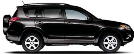
BLACK Ash, Sand Beige or Dark Charcoal 1,2 interior