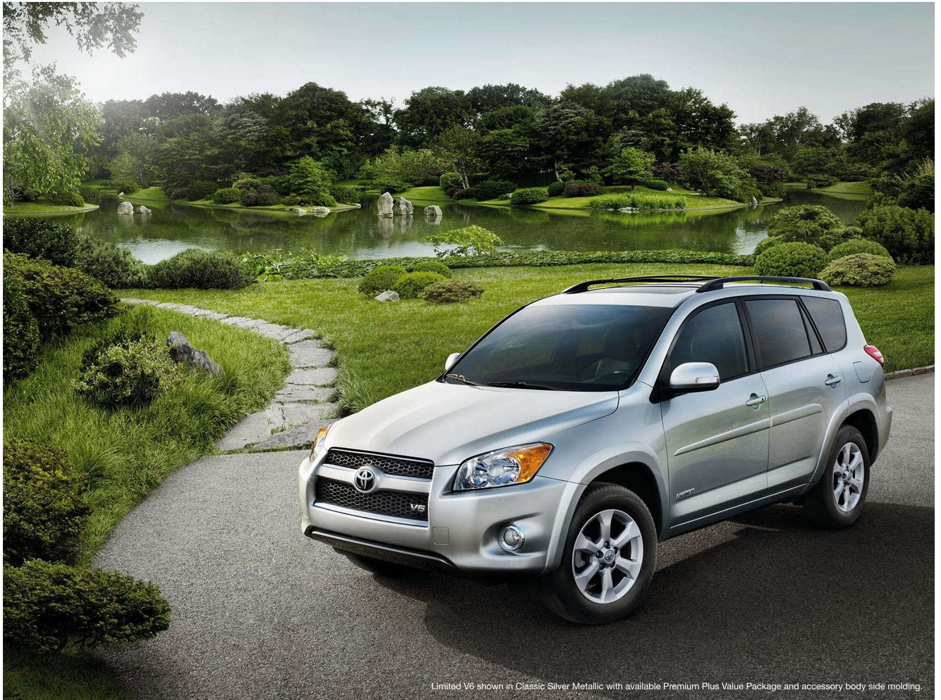
Limited V6 shown in Classic Silver Metallic with available Premium Plus Value Package and accessory body side molding.