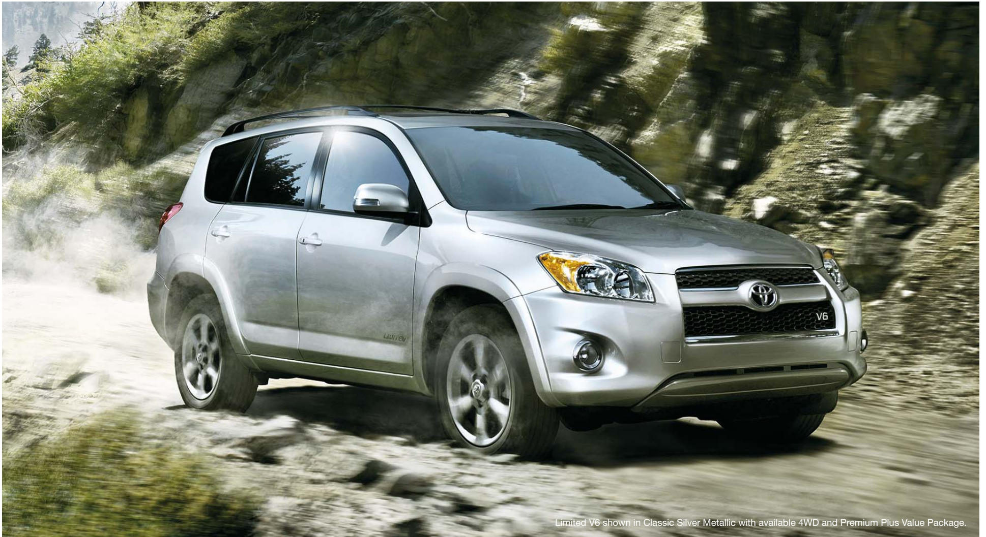
Limited V6 shown in Classic Silver Metallic with available 4WD and Premium Plus Value Package.

It's not surprising that a RAV4 gets an EPA-estimated highway rating of up to 26 mpg 1 . What is surprising is that it's a RAV4 4WD model powered by an available 269-hp V6. The secret is Dual VVT-i, an engine valve timing technology that optimizes power and fuel efficiency.