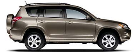
PYRITE MICA 4 Ash or Sand Beige interior