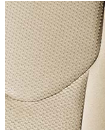
RAV4 available/Limited standard fabric in Sand Beige