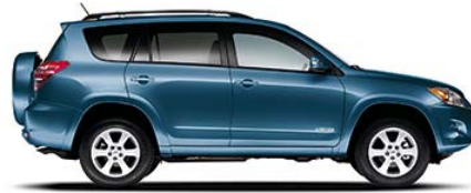
PACIFIC BLUE METALLIC 3 Ash, Sand Beige or Dark Charcoal 1,2 interior