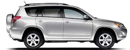
CLASSIC SILVER METALLIC Ash or Dark Charcoal 1,2 interior