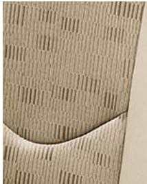
RAV4 fabric in Sand Beige