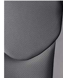
Sport leather in Dark Charcoal