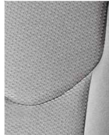
RAV4 available/Limited standard fabric in Ash