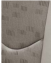
RAV4 fabric in Ash