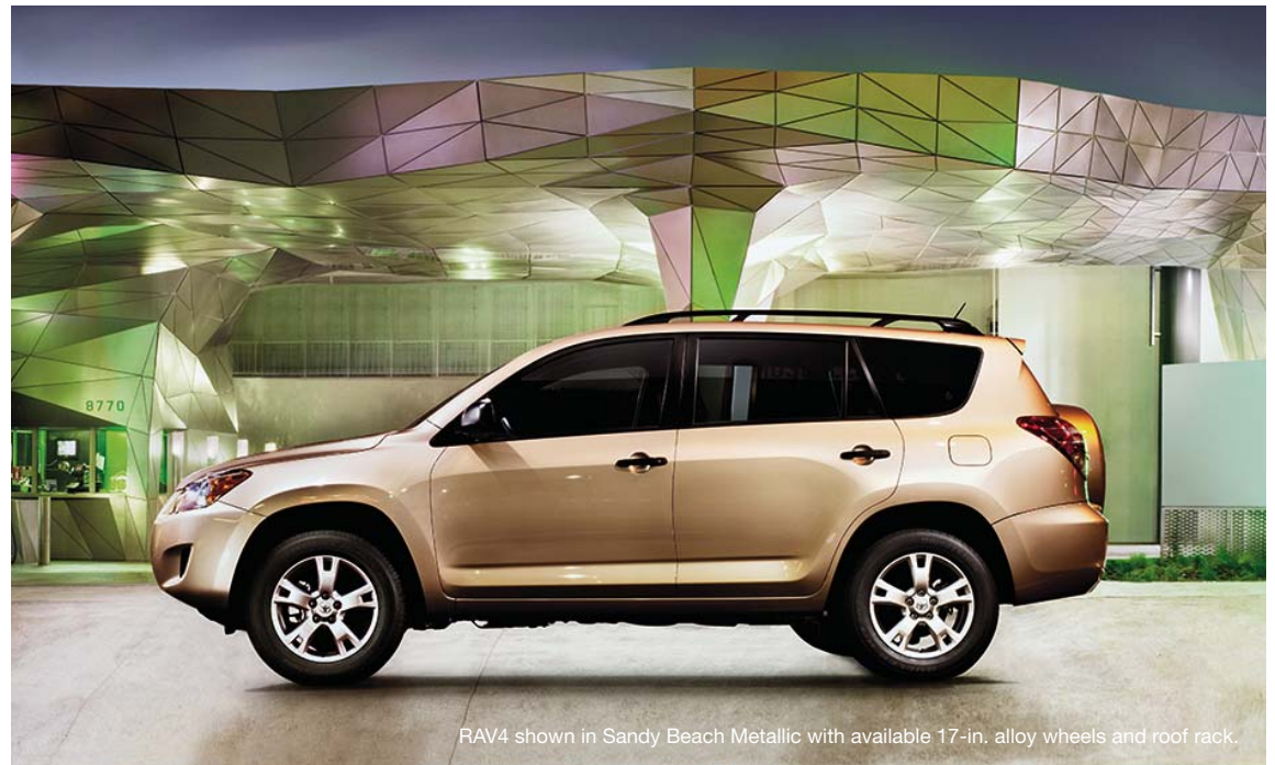
RAV4 shown in Sandy Beach Metallic with available 17-in. alloy wheels and roof rack.