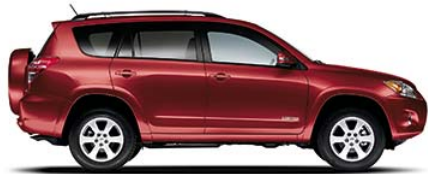
BARCELONA RED METALLIC Ash, Sand Beige or Dark Charcoal 1,2 interior