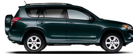
BLACK FOREST PEARL 3 Ash, Sand Beige or Dark Charcoal 1,2 interior