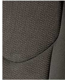
Sport fabric in Dark Charcoal