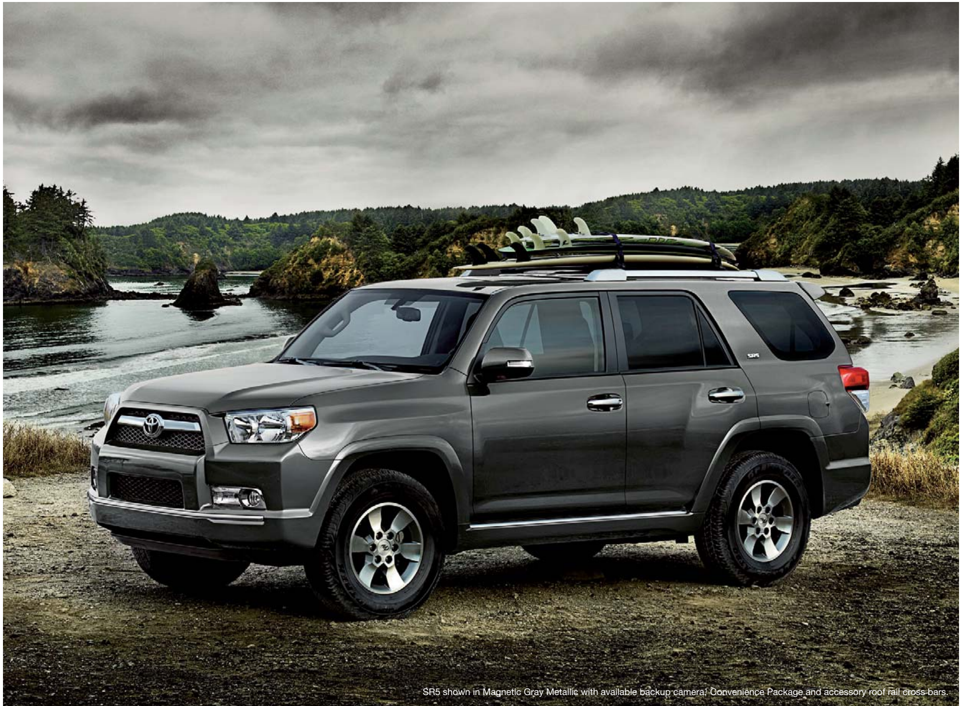
SR5 shown in Magnetic Gray Metallic with available backup camera, Convenience Package and accessory roof rail cross-bars.

1. See footnote 13 in Disclaimers section.