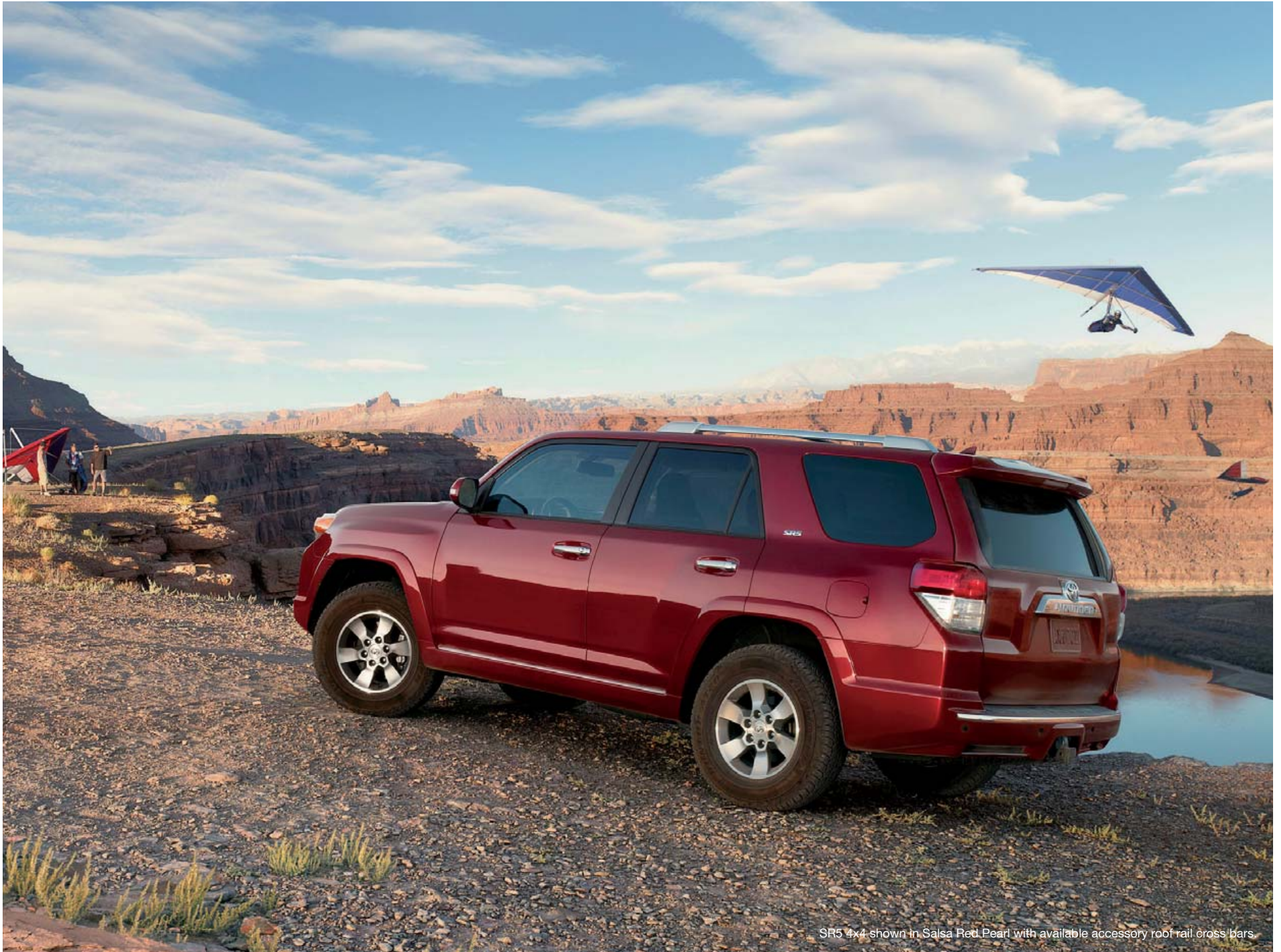
SR5 4x4 shown in Salsa Red Pearl with available accessory roof rail cross bars.