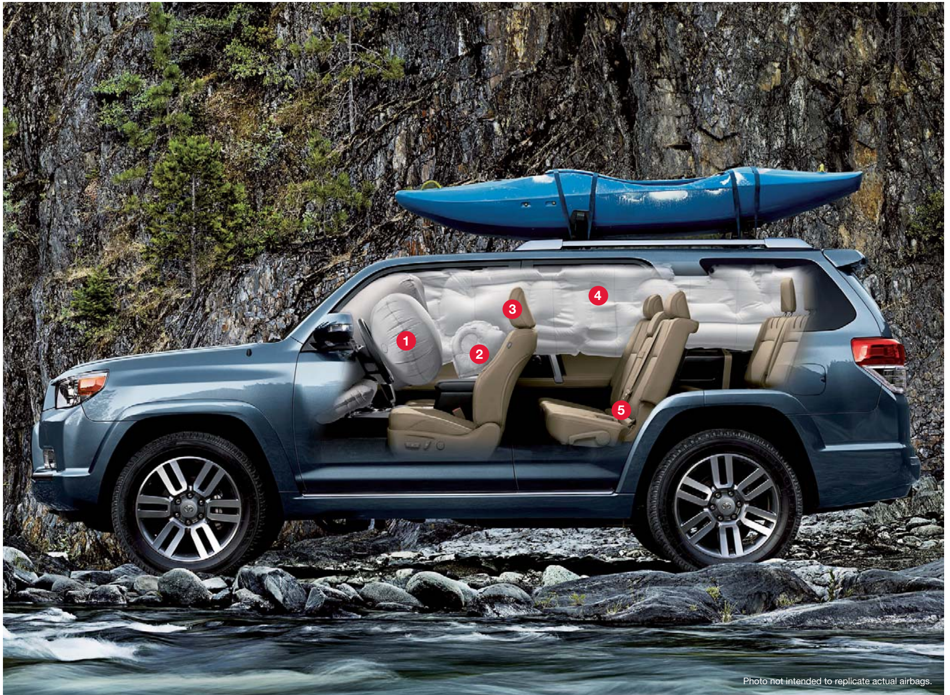
Photo not intended to replicate actual airbags.

Numbers 1-5 descriptions on previous page.