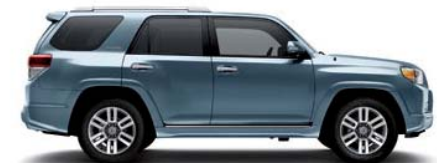
SHORELINE BLUE PEARL 4