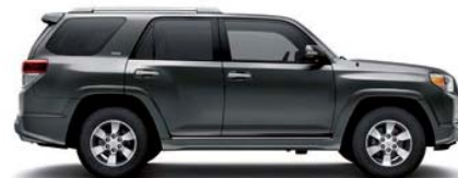
MAGNETIC GRAY METALLIC