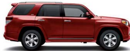
SALSA RED PEARL 1