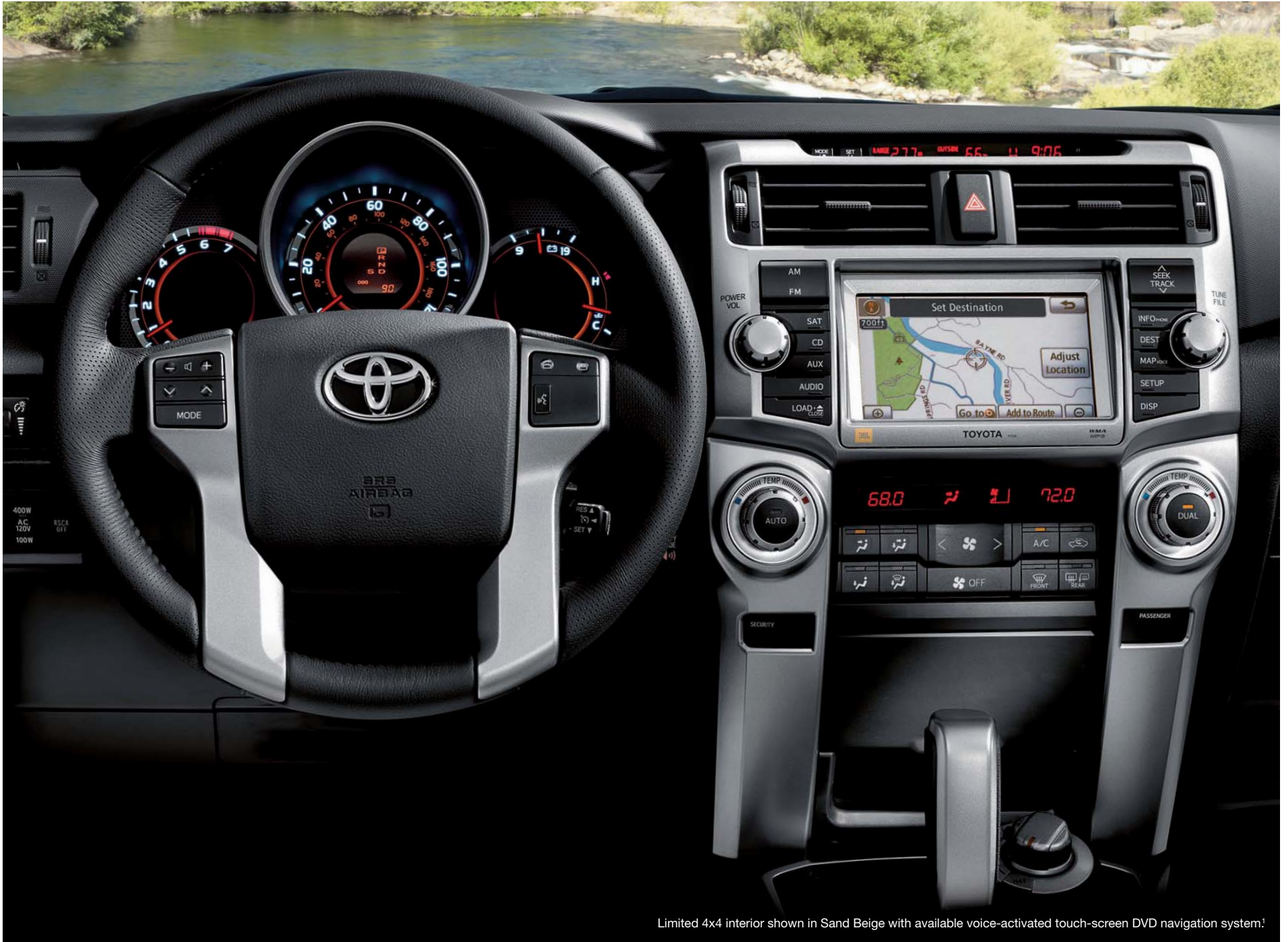
Limited 4x4 interior shown in Sand Beige with available voice-activated touch-screen DVD navigation system!