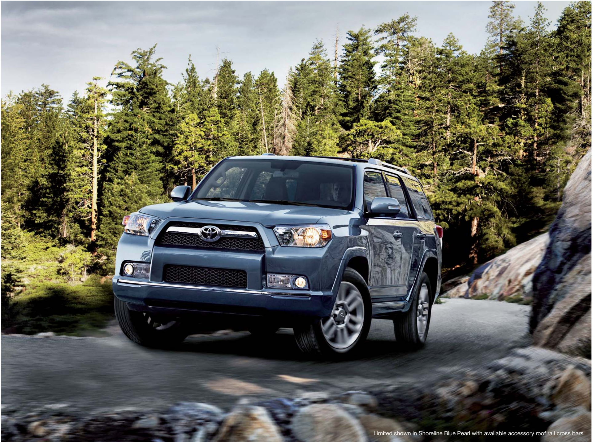
Limited shown in Shoreline Blue Pearl with available accessory roof rail cross bars.