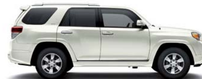
BLIZZARD PEARL 2,3