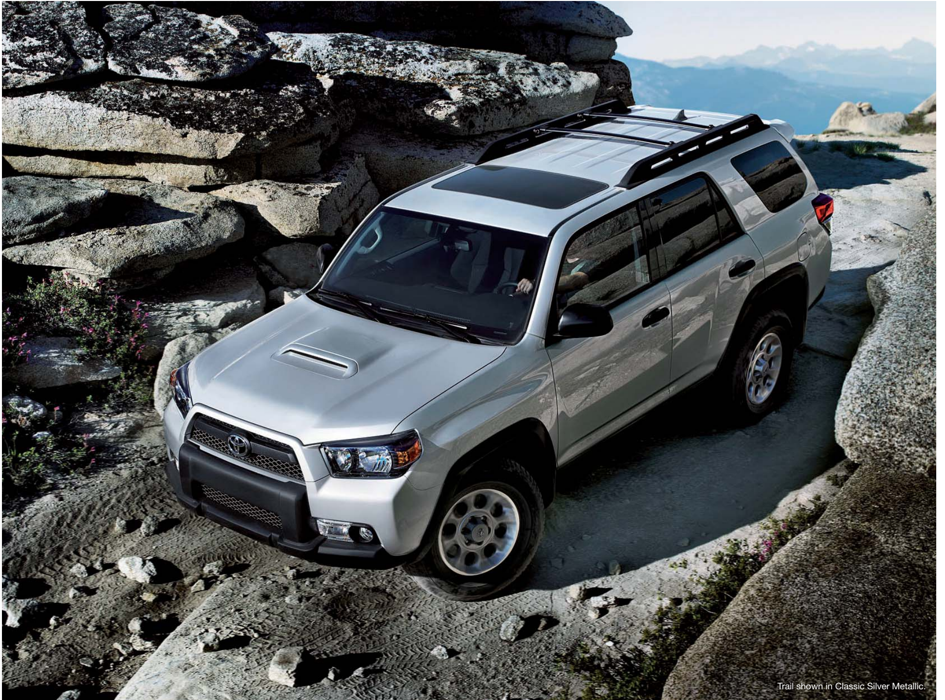
Trail shown in Classic Silver Metallic.