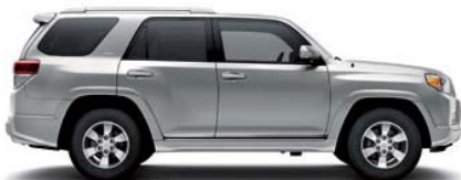
CLASSIC SILVER METALLIC