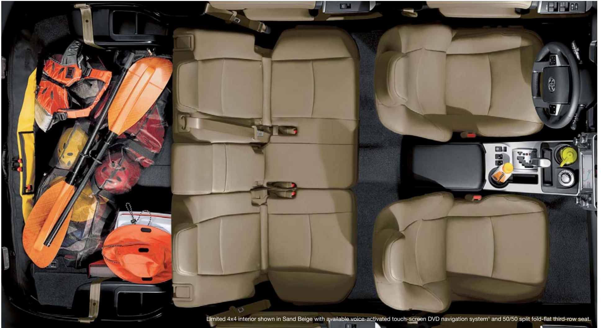
Limited 4x4 interior shown in Sand Beige with available voice-activated touch-screen DVD navigation system 1 and 50/50 split fold-flat third-row seat.